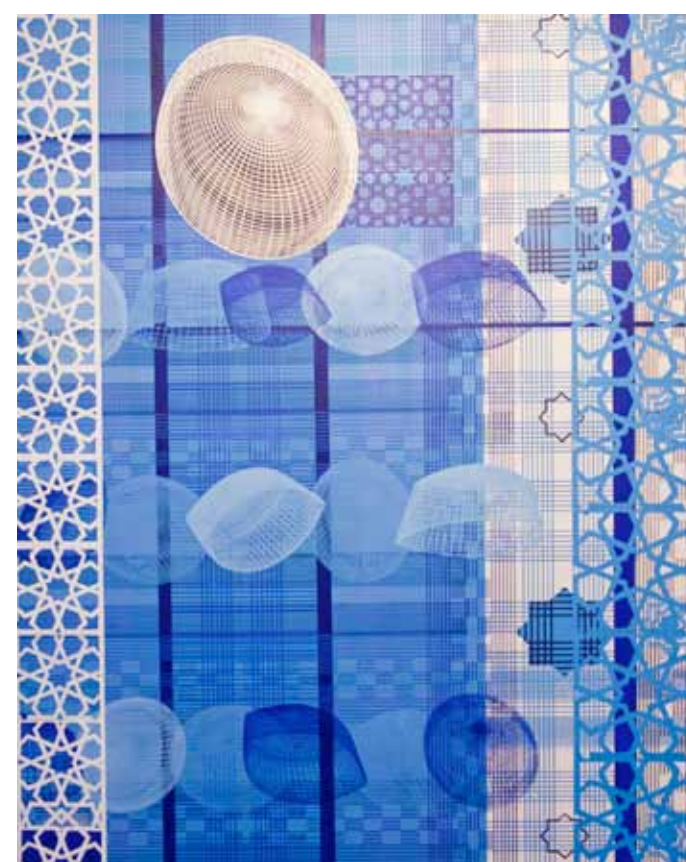
Friday . 122cm x 152cm . Acrylic on Canvas . 2010