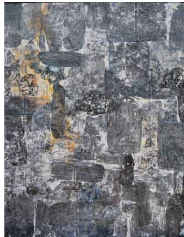
Divine Land - Long ago people believed that the world was flat II . 146cm x 114cm . PVC Glue, Clear Glue, Plaka White, Tempera, Acrylic, Oil on Canvas . 2010