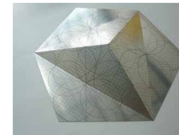
Metallanguge . 142cm x 142cm x 12.7cm . Aluminium . 2010

Shahrul Jamili may have coined the word 'metallanguge' as a title for his work, a play on the words 'meta', 'metal' and 'language'. 'Meta', Greek for with, across, after. He has always been intrigued by Islamic geometrical patterns. His metal sculptures have such designs etched onto the surface. Blind embossed prints are taken before the sculptures are assembled. The metal sheets are also cut into, creating new spatial areas. He is dealing with the concepts of 'perfect and imperfect', the realization of 'space' and the circular character of his process: Infinity.