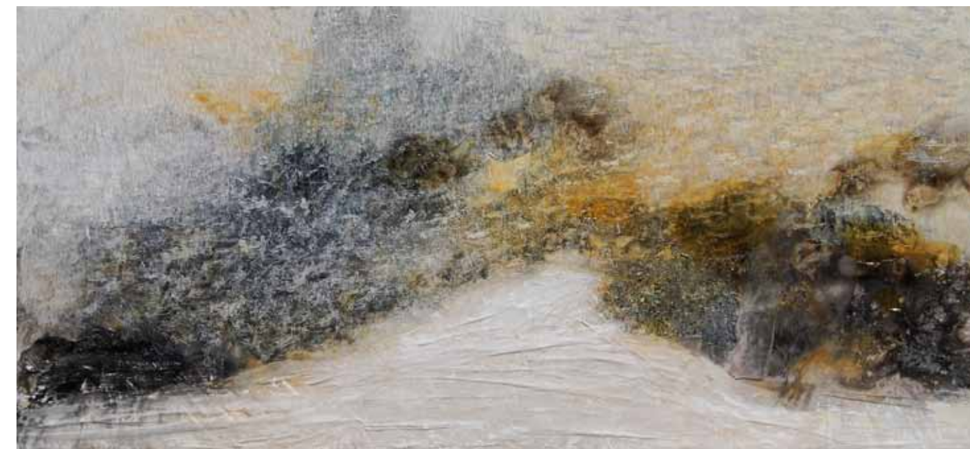
Mythology Series - The World was formed ages ago when an ancient legend ran dry . 105cm x 227cm . Gauze, Silk Screen, Tempera, Charcoal, Acrylic, Oil Colour, Drawing Ink, Pencil, White Glue, Varnish on Canvas . 2010

Tuck Wai's paintings are about the desecration of the environment and history. His mixed media works are richly textured and largely monochromatic. They express the erosion and decay that besets our world and our traditions. Some of the images are akin to ancient walls of stone seemingly still standing and fighting off the ravages of time