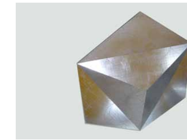
Metallanguge . 142cm x 142cm x 12.7cm . Aluminium . 2010