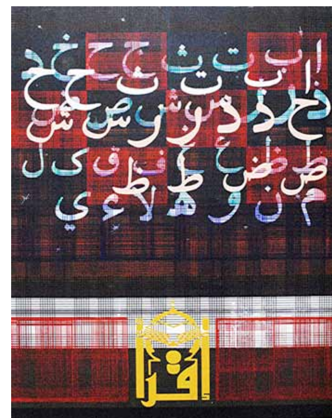
Iqra' . 122cm x 152cm . Acrylic on Canvas . 2010