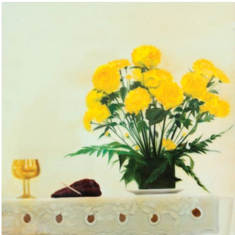
Inspirations (2018) | Oil on canvas and Giallo Cleopatra marble; 75 x 150 x 8cm