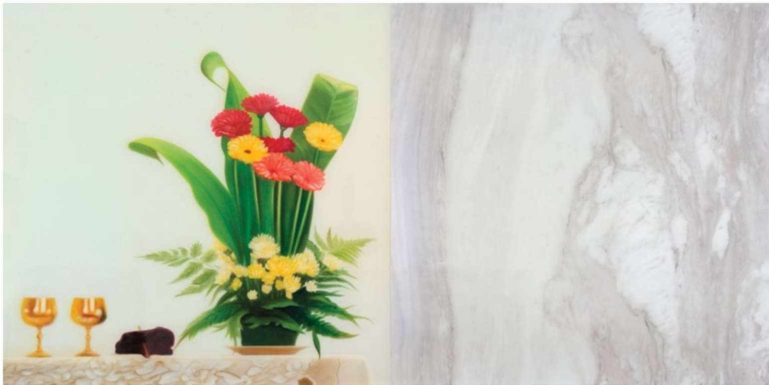
Just For You (2018) | Oil on canvas and Vermont marble; 75 x 150 x 8cm