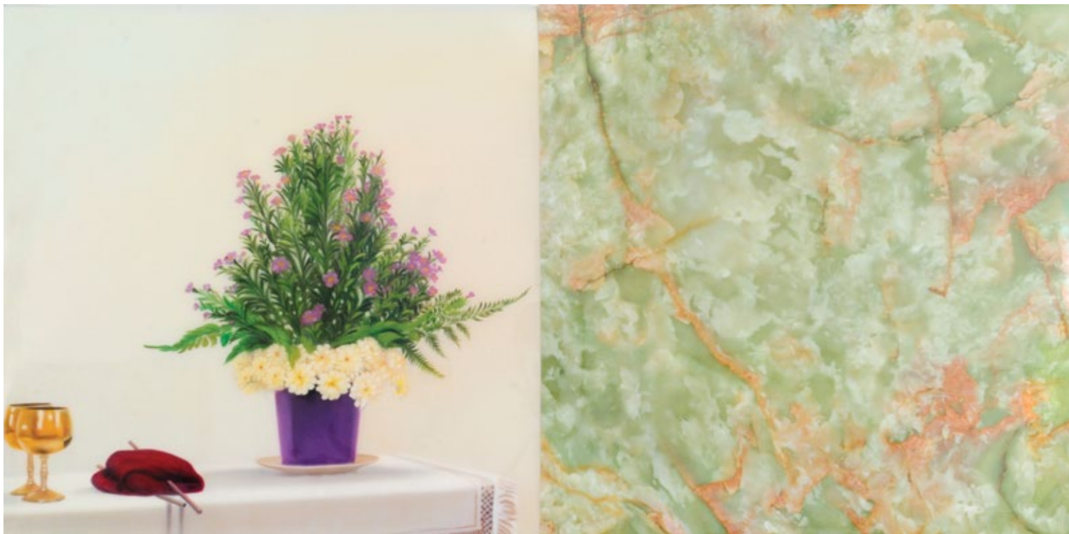
Looking Up to You (2018) | Oil on canvas and Onice Verde marble; 75 x 150 x 8cm