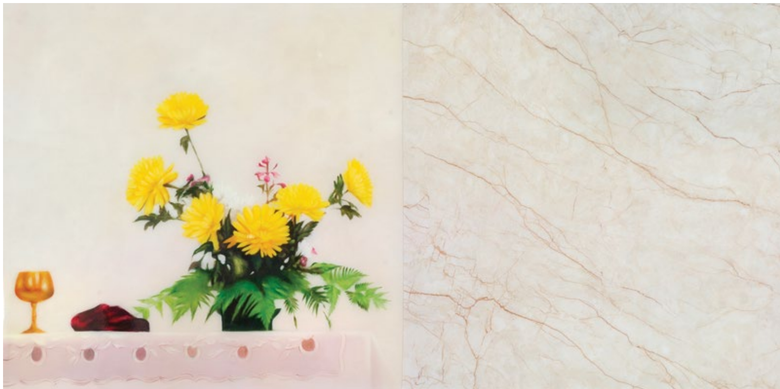
Be Thankful (2018) | Oil on canvas and Sylacauga marble; 75 x 150 x 8cm