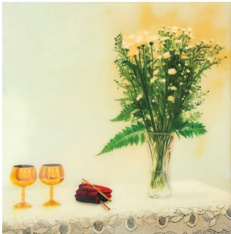
Tempus Fugit (2018) | Oil on canvas and Aurelio Yellow marble; 75 x 150 x 8cm