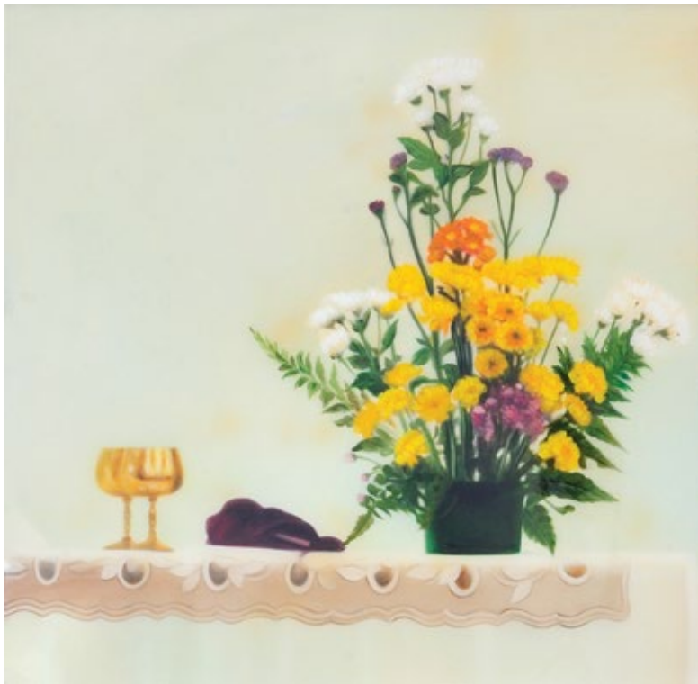
At Your Good Service (2018) | Oil on canvas and Pentelic marble; 75 x 150 x 8cm