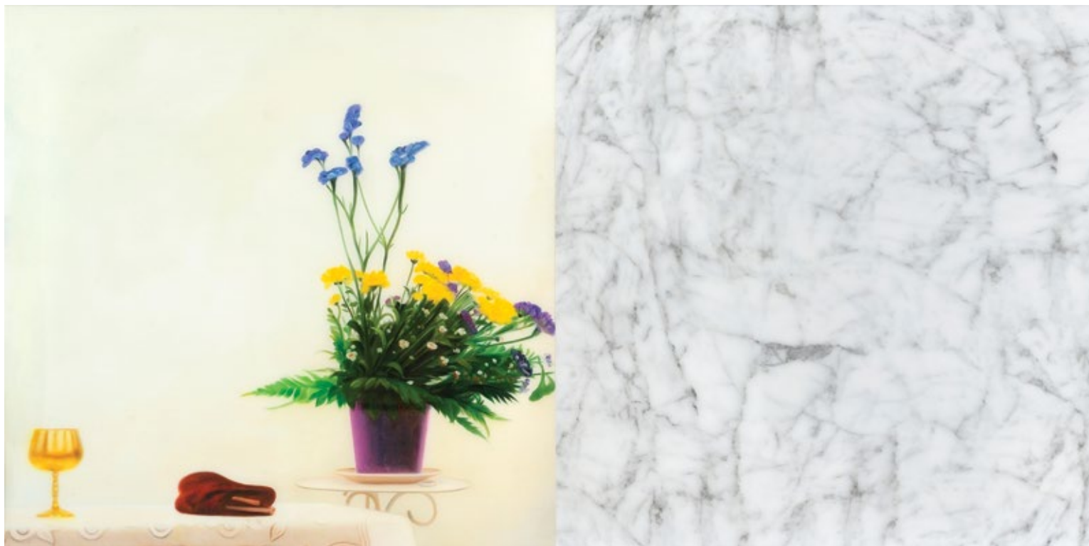
Always Waiting (2018) | Oil on canvas and Bianco Sivec marble; 75 x 150 x 8cm