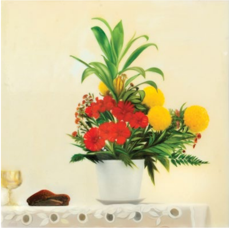
Depending On You (2018) | Oil on canvas and Ruskeala marble; 75 x 150 x 8cm