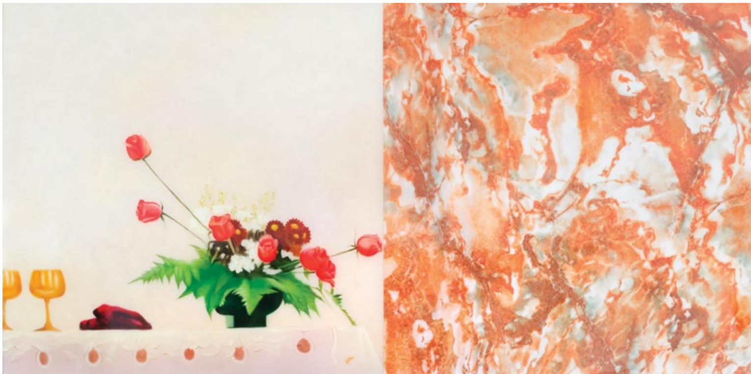
Dedication (2018) | Oil on canvas and Athena red marble; 75 x 150 x 8cm