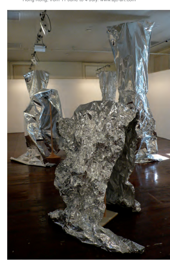
Koji Ryui, The Tree of Life (installation view). 2009, foil and wood. Koji Ryui - Moai is showing at Gallery 4A, Sydney, alongside Huseyin Sami - Painter I am why not , until 6 June. Courtesy the artist and Sarah Cottier Gallery, Sydney. www.gallery4a.com.au