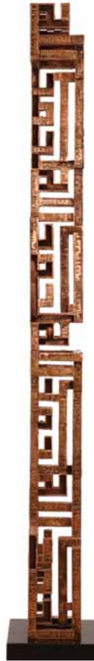
Amin Gulgee Algorithm I Copper 213.4cm x 18.3cm x 18.5cm 2015