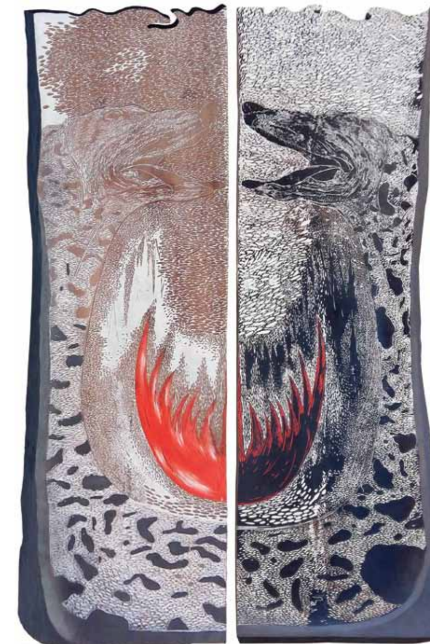
Juhari Said Dalmation / Flower Oil on wood 200cm x 108cm (Diptych) 2016