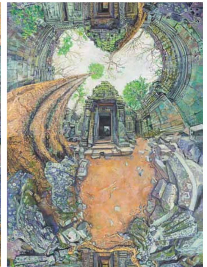
Chin Kong Yee Jack and The beanstalk Oil on jute 260cm x 190cm (Diptych) 2016 (Arrangement 1 & 2)