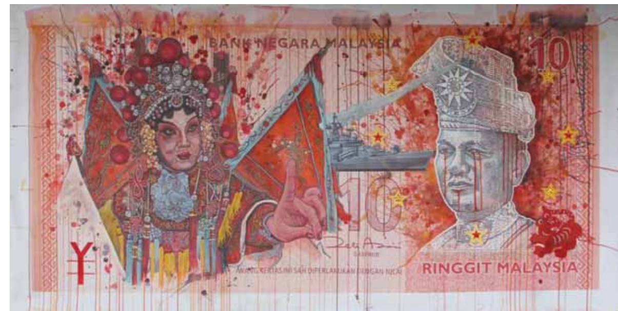
Top: Anurendra Jegadeva The Red Wedding I Acrylic on printed canvas 83.5cm x 179cm 2016