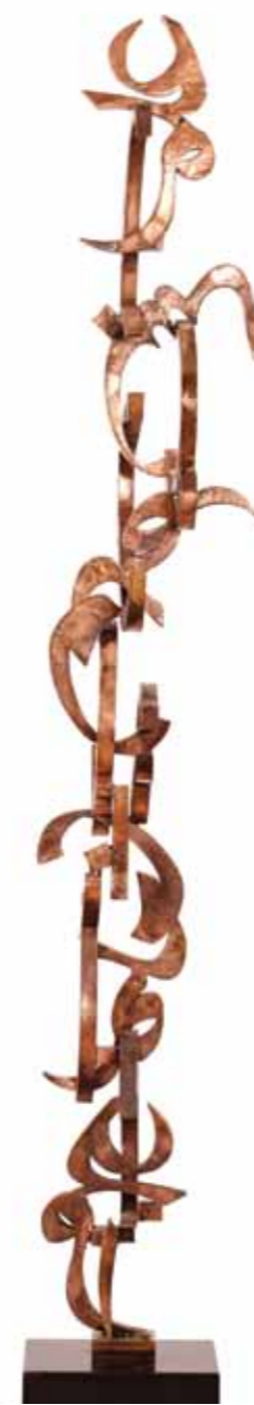
Amin Gulgee Ascension II Copper 213.4cm x 27cm x 30.5cm 2014