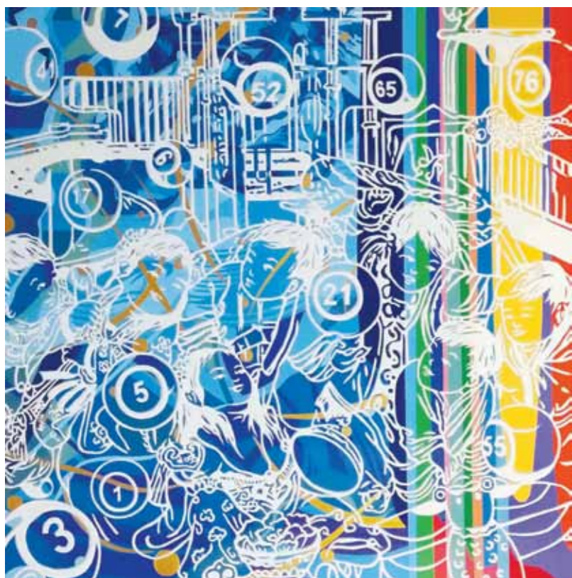
Left: Wong Chee Meng Hundred Subgraph Acrylic on canvas 152.4cm x 152.4cm 2015