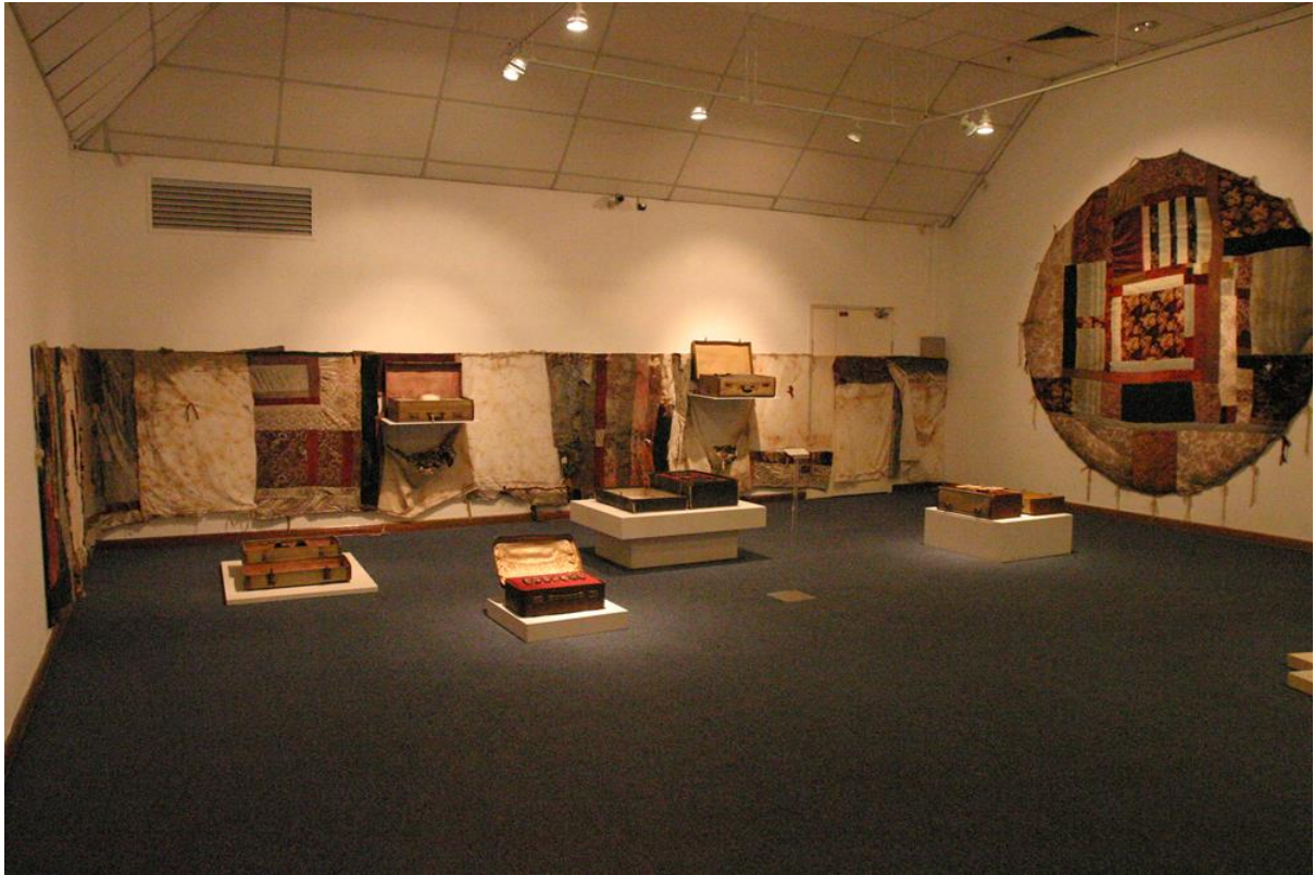
Noor Azizan Paiman To whom this city belongs to 2005