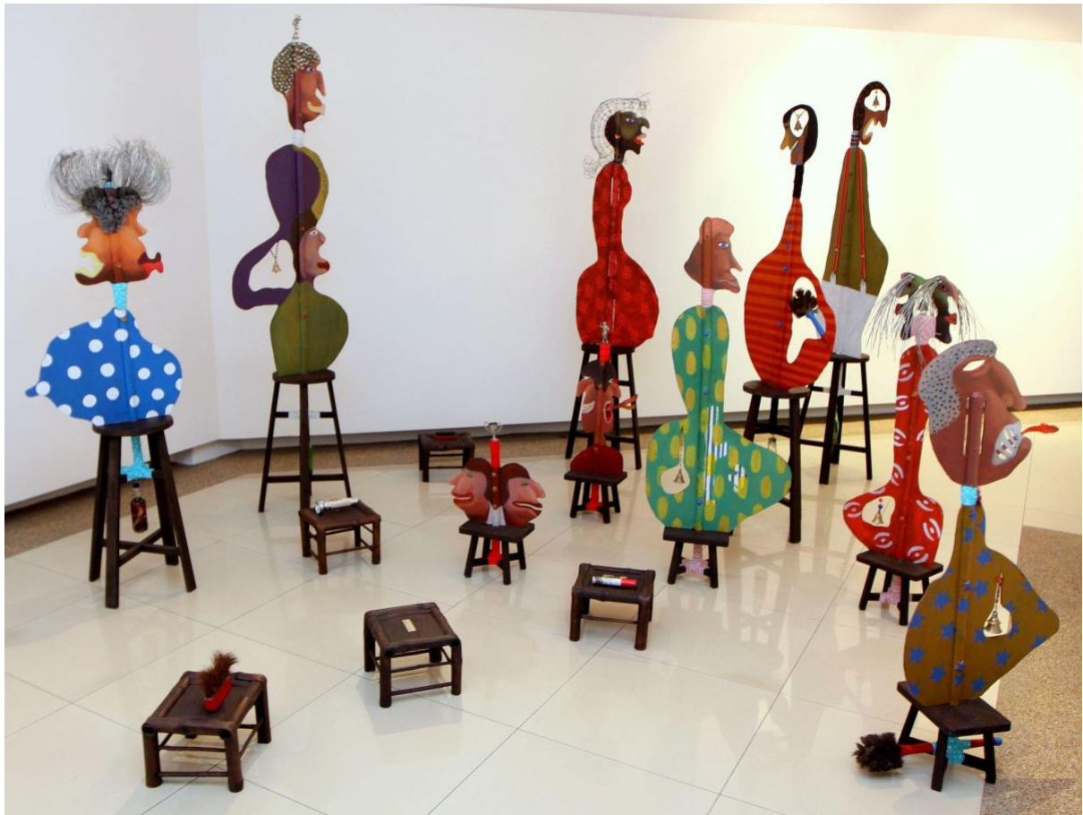
Noor Azizan Paiman Hopeless Image Awards 1995