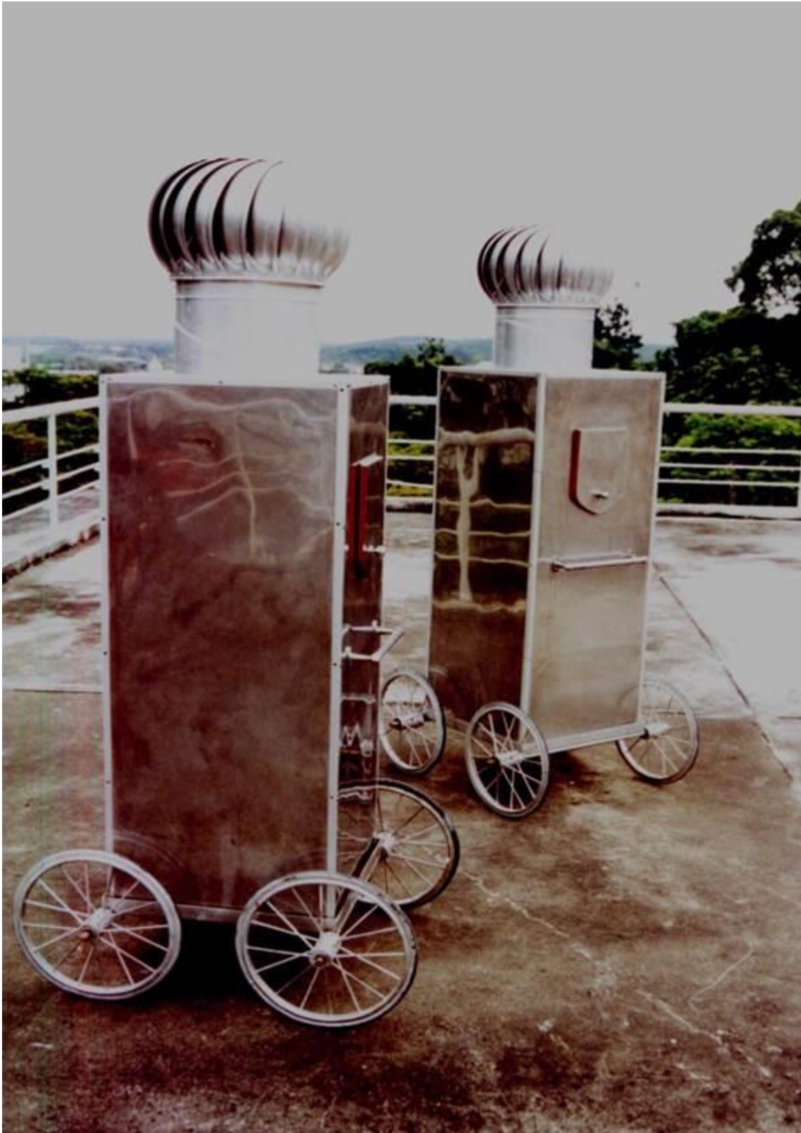
Noor Azizan Paiman The Wailing Wheel 1996