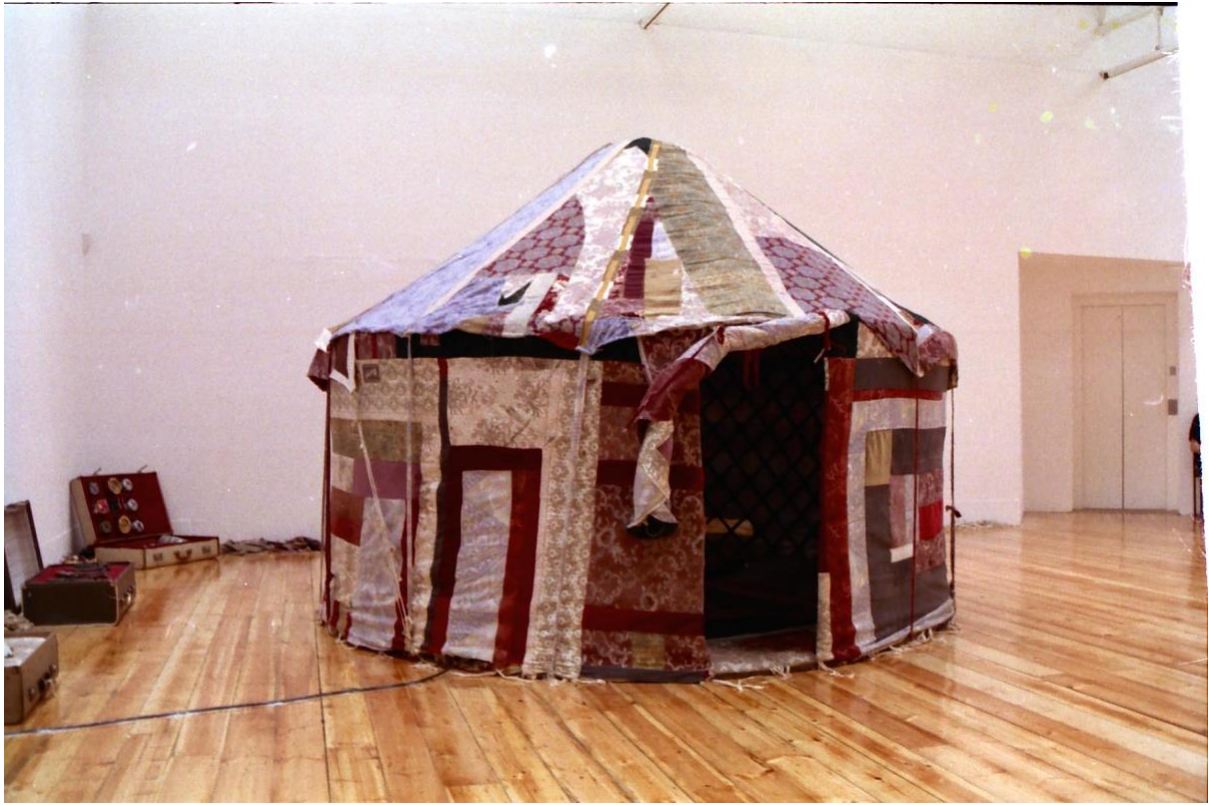
Noor Azizan Paiman case Case 2000