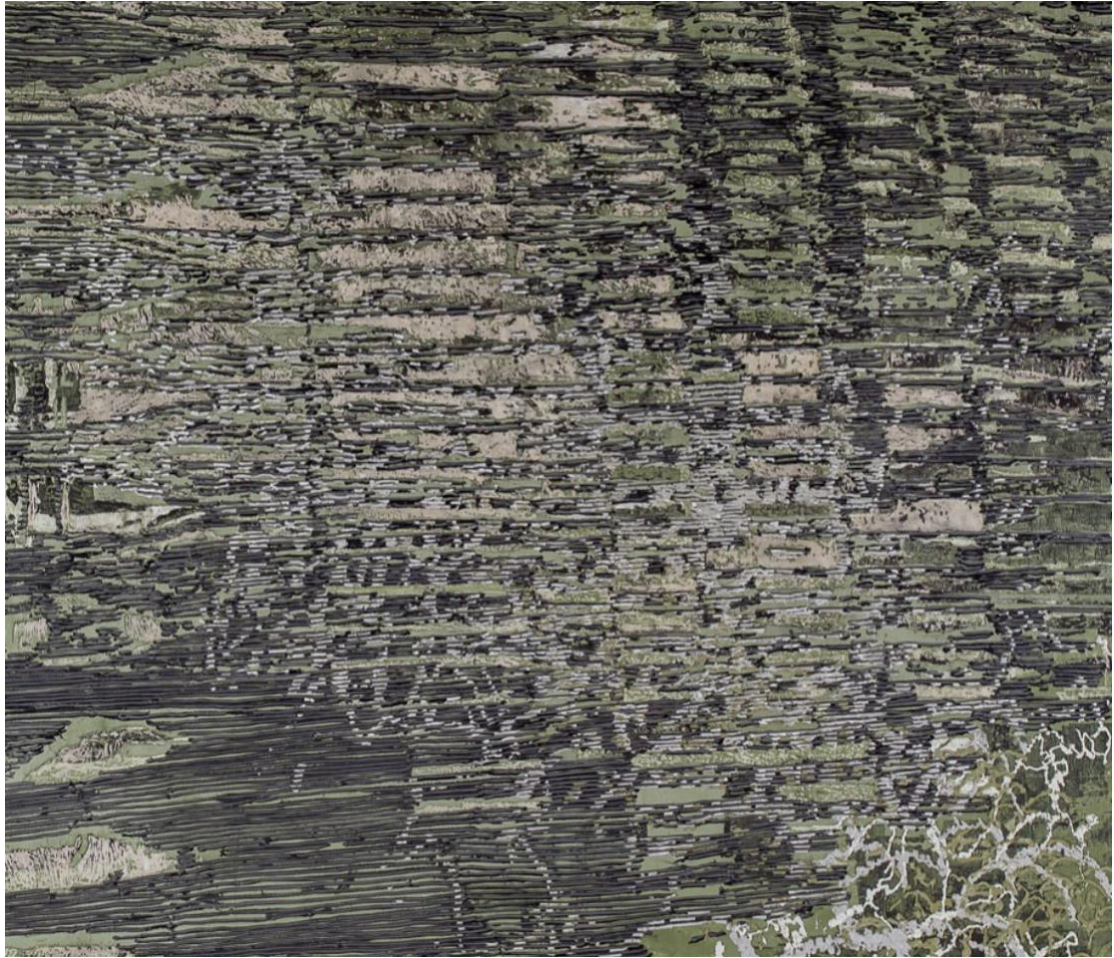
Sabri Idrus Silent Fortress Acrylic on Canvas 180cm x 180cm 2020

Award: The UOB Painting of The Year (Malaysia)