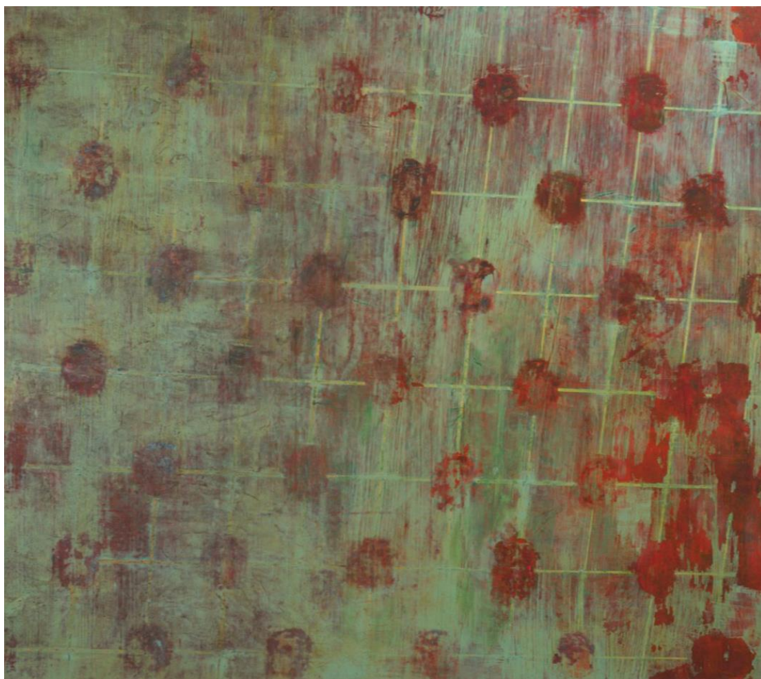
Sabri Idrus Mailbox Acrylic on Canvas 178cm x 229cm 2017

Exhibition: Abstraction Now! Wei Ling Gallery, Kuala Lumpur, Malaysia