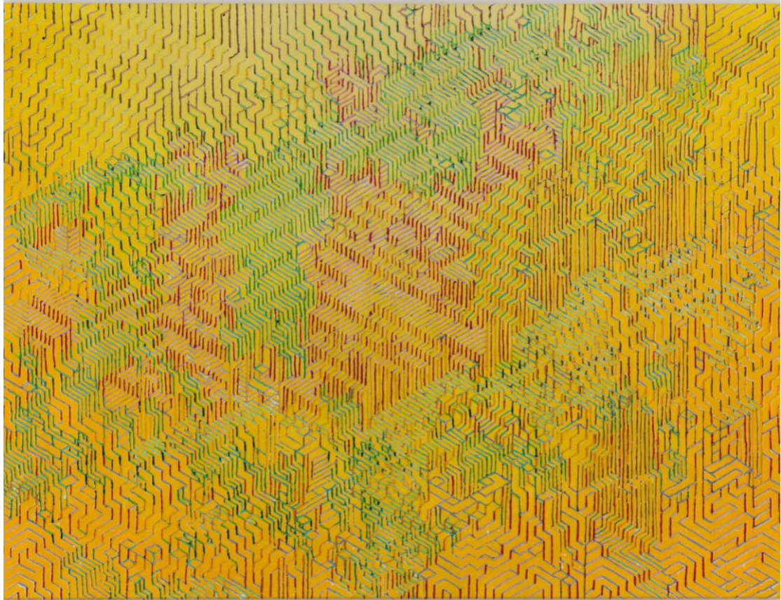
Sabri Idrus Information Acrylic on canvas 180cm x 240cm 2018

Exhibition: Power- A solo exhibition, Gajah Gallery, Singapore (2018)