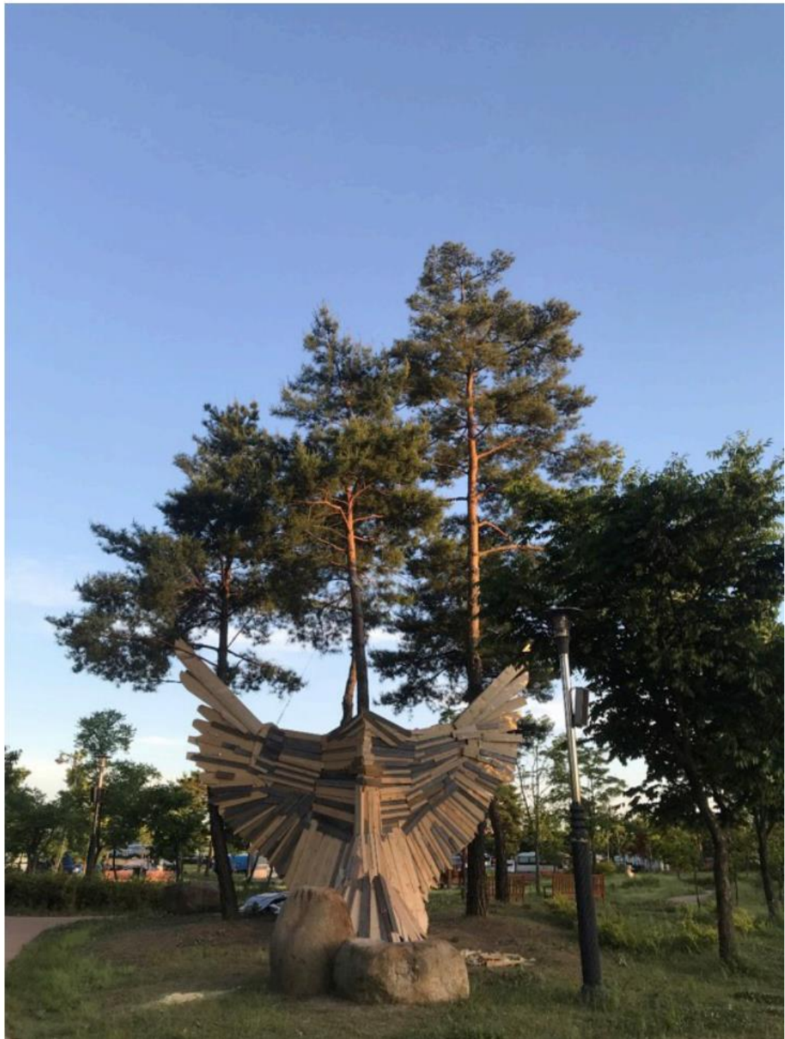
Sabri Idrus The Unseen Physic Pine Wood, Metal and Lacquer 10m x 10m 2019

Exhibition: Gyeongju Residency Art Festa 2019, Gyeongju Art Center, South Korea