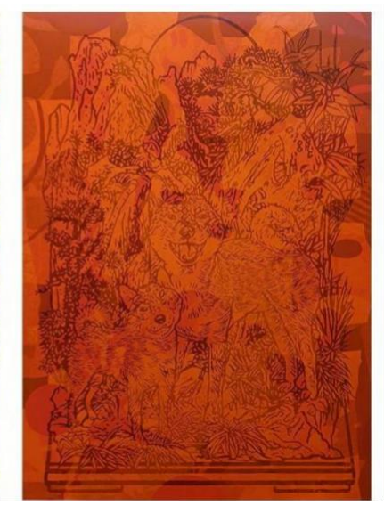
Wong Chee Meng 13 Safe and Sound Acrylic on canvas 152.5cm x 107.5cm 2020

Exhibition: Good Days Will Come 13 November 2020 – 16 January 2021 WEI-LING GALLERY 7 October – 12 November 2020 WEI-LING CONTEMPORARY