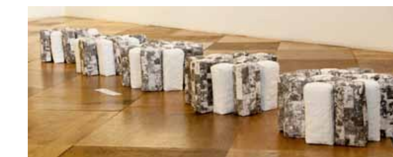
The Conversation IV - The Brick . 55cm x 200cm . Transfer Ink on Rice Paper, Plaster Cast & Rags . 2010