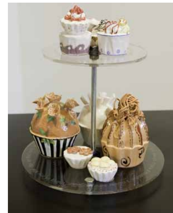
See It, Take It, Taste It & Feel it (Or you will think about it) I . Variable Sizes . Ceramic and Mixed Media . 2010