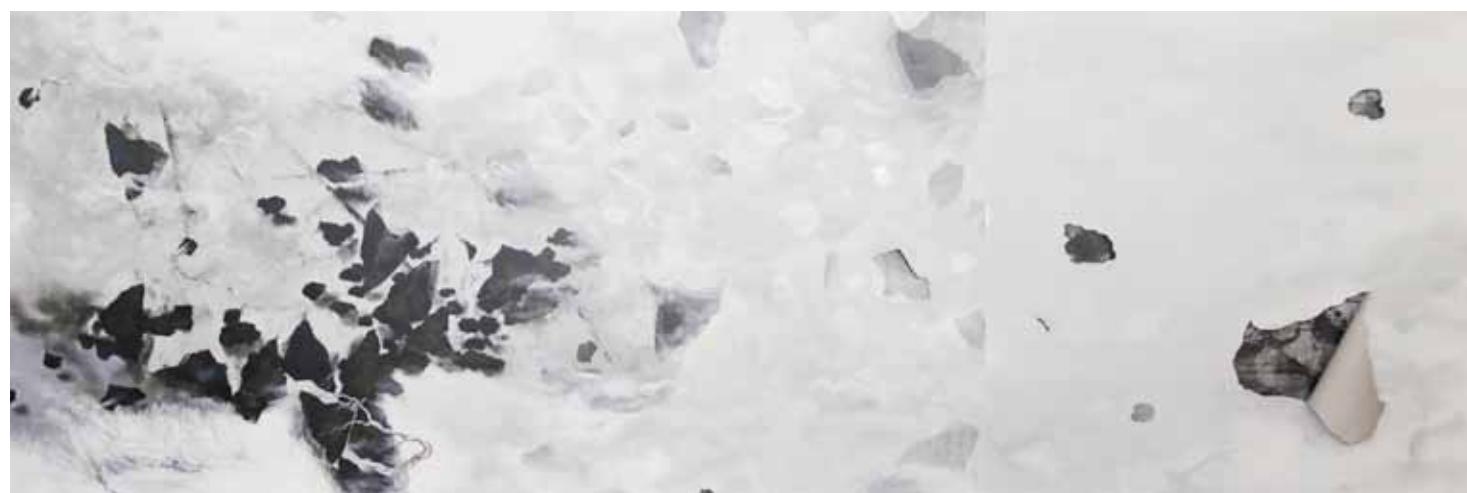
Rhino and Son . 76cm x 152cm . Cement Cut and Monoprint on Canvas . 2010