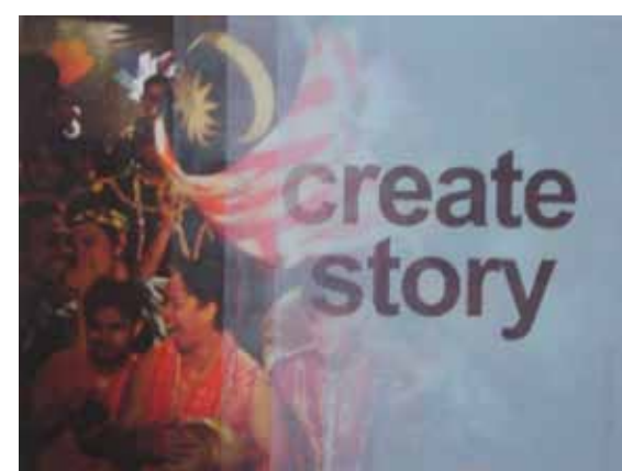
We Create Our Story . 27cm x 33cm . Hologram . 2010