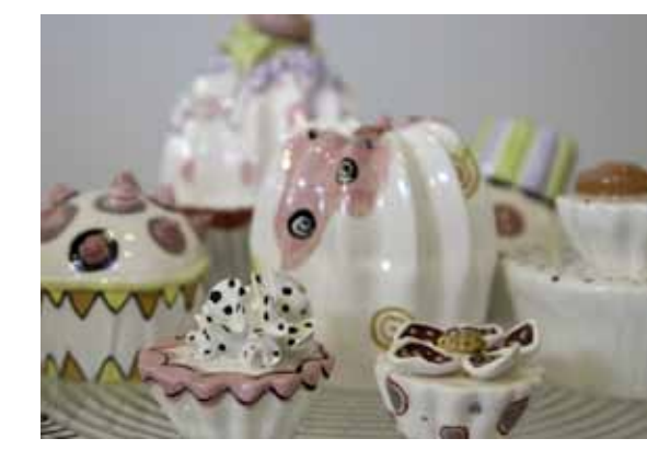
See It, Take It, Taste It & Feel it (Or you will think about it) II (detail) . Variable Sizes . Ceramic and Mixed Media . 2010