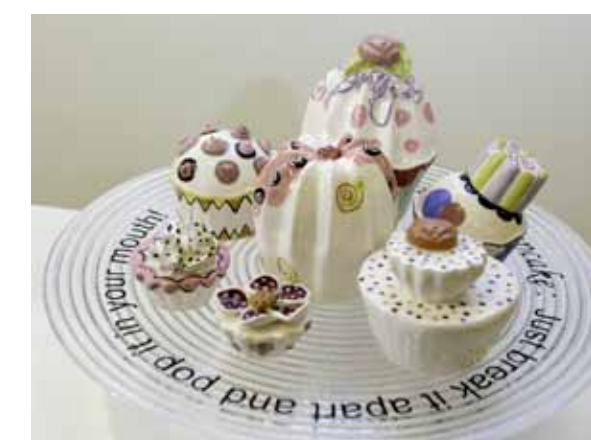
See It, Take It, Taste It & Feel it (Or you will think about it) II . Variable Sizes . Ceramic and Mixed Media . 2010