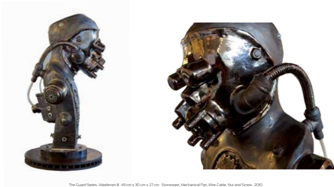
The Guard Series - Maskman III - 49 cm x 30 cm x 27 cm - Stoneware, Mechanical Part, Wire Cable, Nut and Screw - 2010

National Art Gallery, KL, Malaysia Nova Scotia Bank, KL, Malaysia