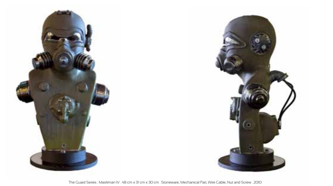
The Guard Series - Maskman IV - 48 cm x 31 cm x 30 cm - Stoneware, Mechanical Part, Wire Cable, Nut and Screw - 2010