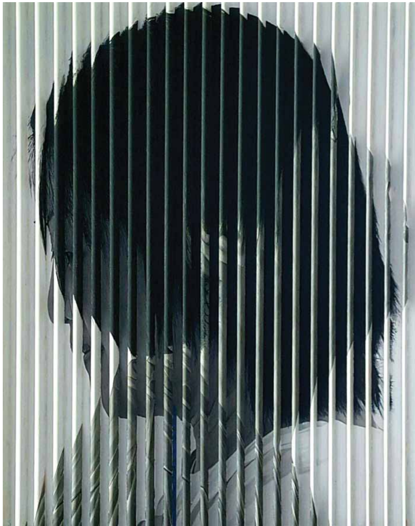
24 cuts 150 x 120 x 7.6cm Synthetic polymer paint on wood board 2015

Cover image: 30 cuts, 91.44 x 91.44 x 4.5cm (variable), Synthetic house paint, resin on wood, 2016