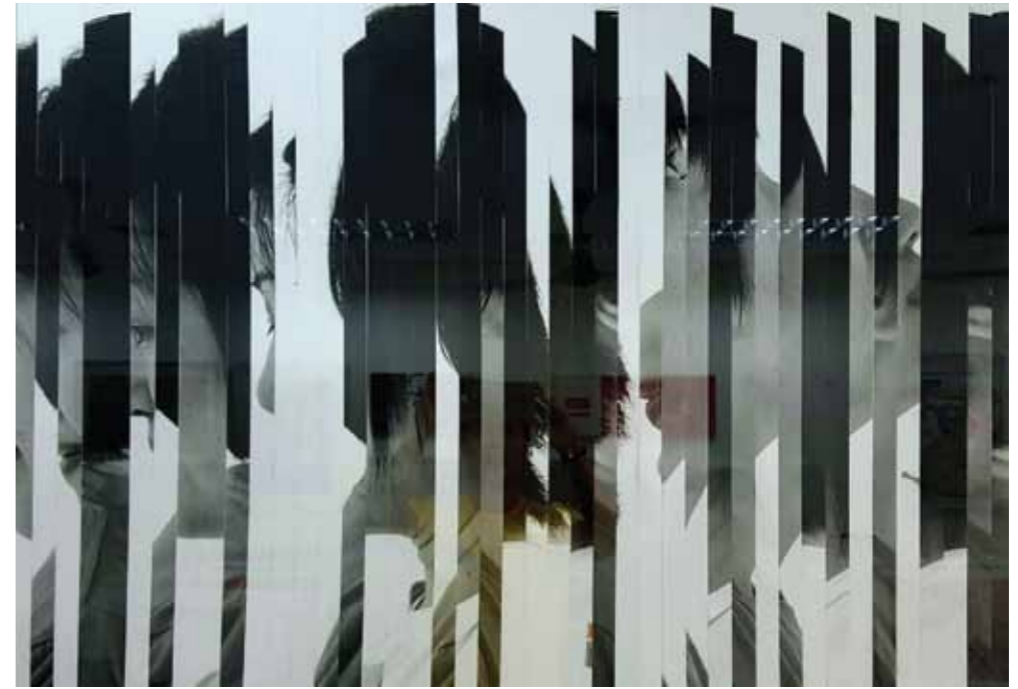
Patchwork of not seeing face to face 89 x 122 x 3cm Laminated print on matt paper, framed 2016