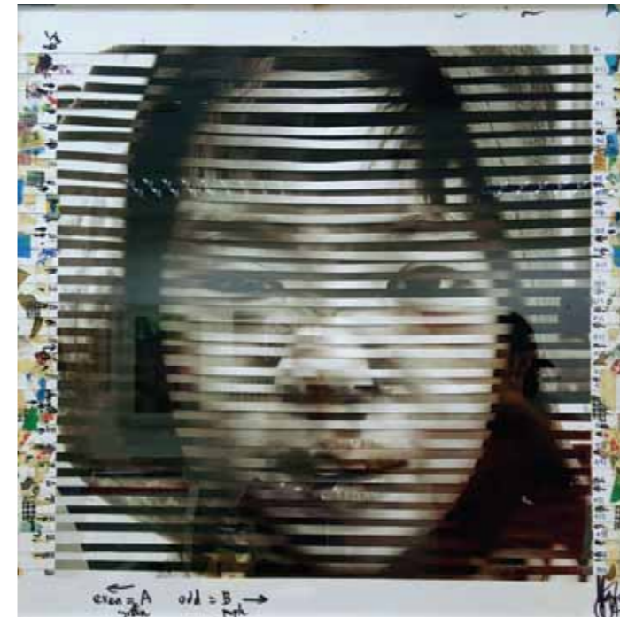
Patchwork of sibling rivalry 73.6 x 73.6 x 3.8cm Laminated print on matt paper, framed 2015

For full CV please visit http://weiling-gallery.com/wp-content/uploads/2016/02/Ivan-Lam.pdf