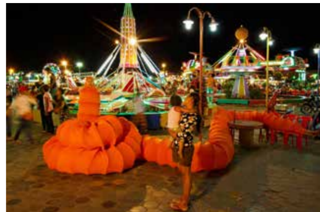
Bug Sightings (The Buddhist Bug series) (2012-2015) | Photo documentation of live performances of The Bug performances around the world; Archival Inkjet prints mounted on angular foam core structures; 6 sets of prints measuring 50cm x 75cm each