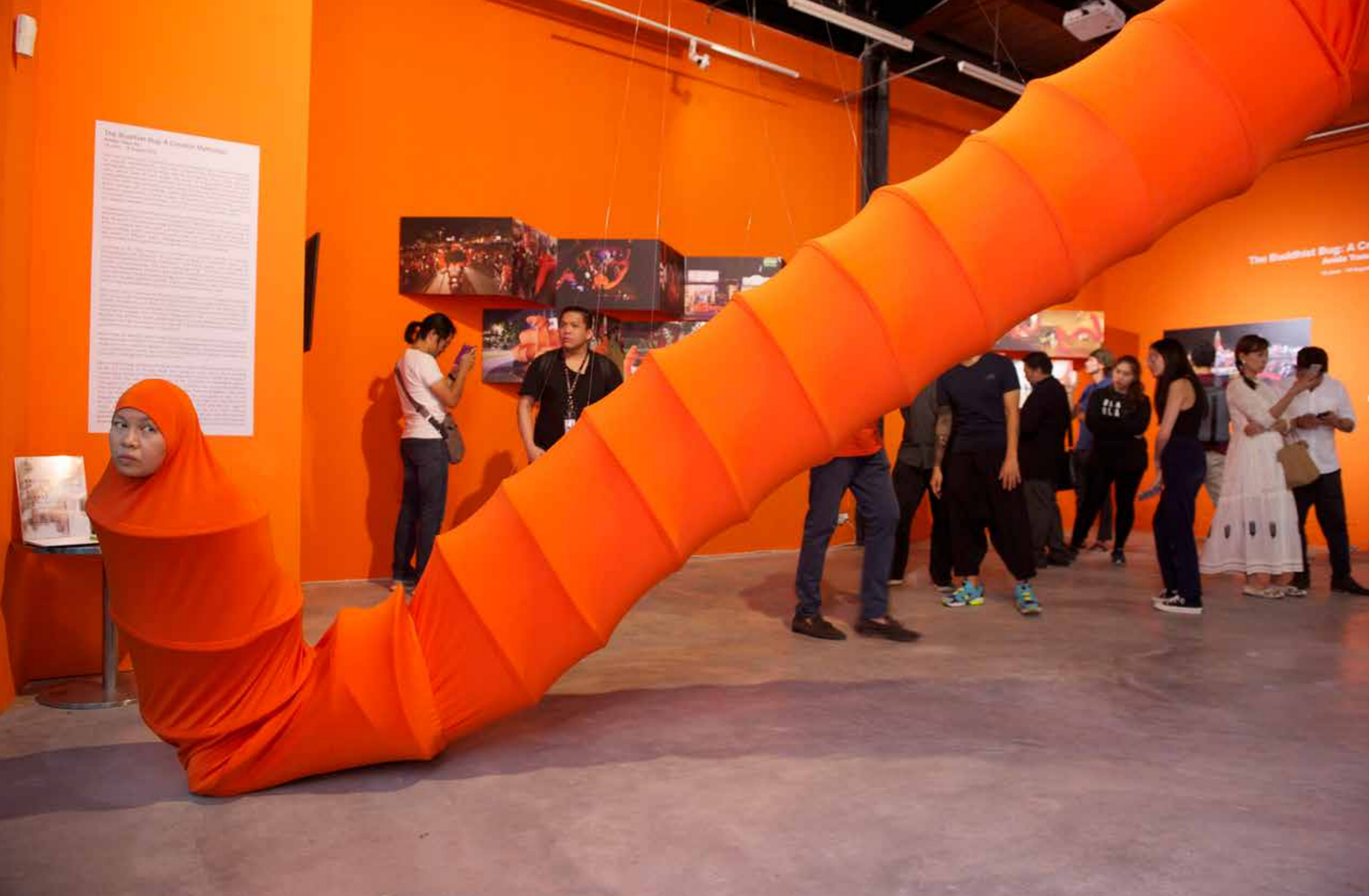
Sundried Landing (The Buddhist Bug series) (2014) Live Performance & Installation; Orange polyester-lycra blend fabric, tubing, wire, thread and 2 live bodies; 0.5m diameter x 60m length