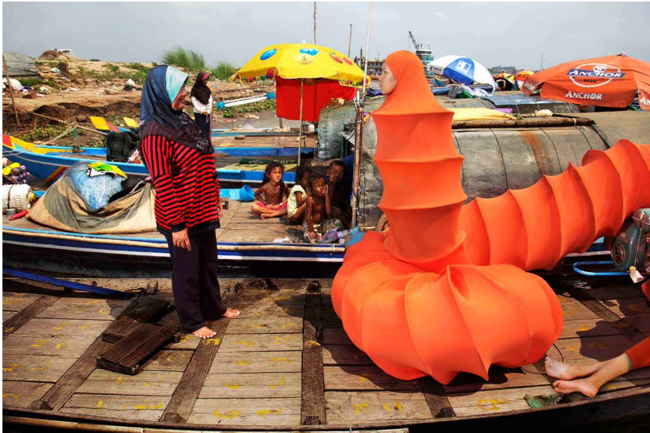
Reflection #1 (The Buddhist Bug series) (2013) | Archival Inkjet Print; 75cm x 112.5cm (edition of 5)