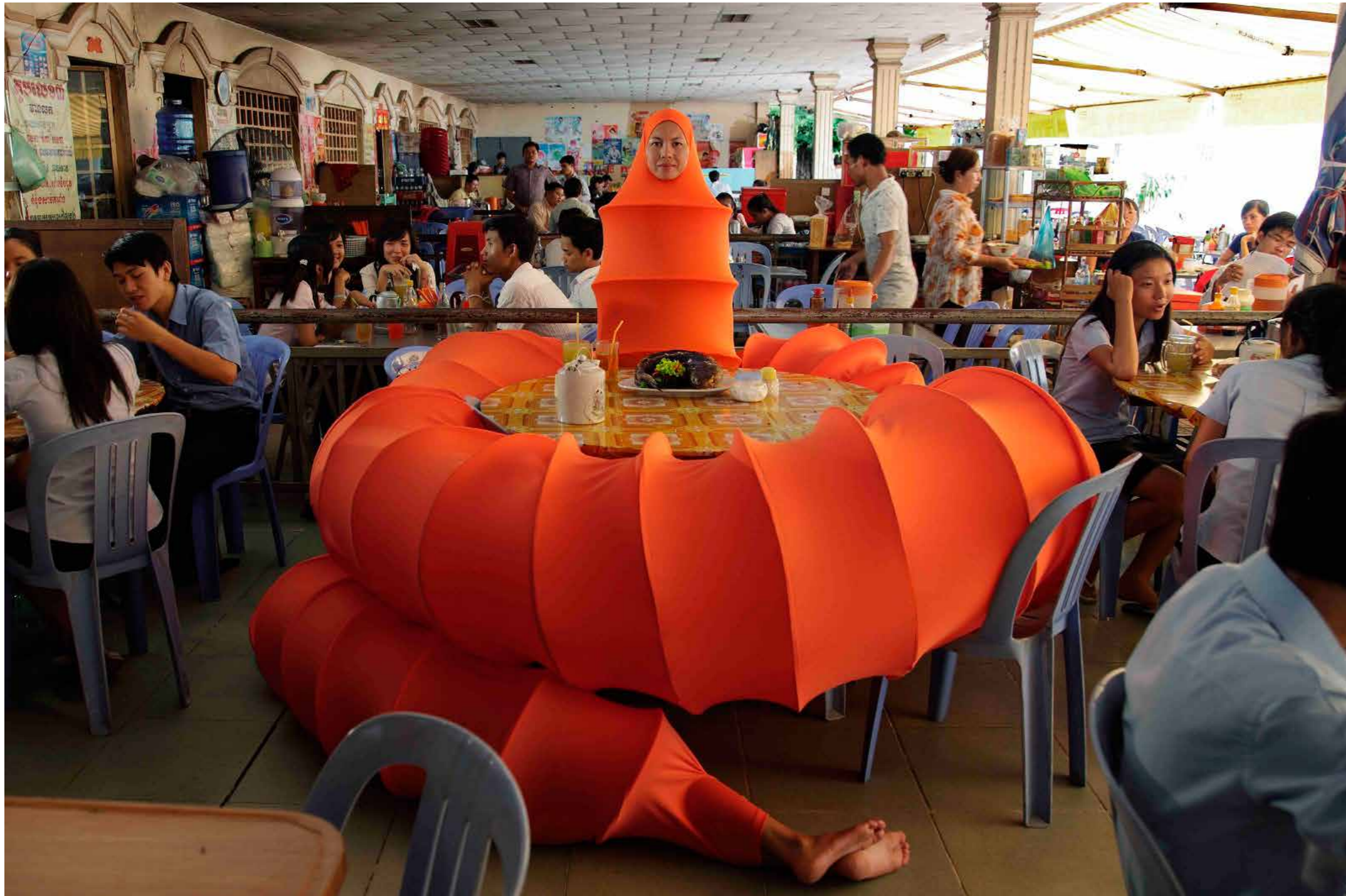
Campus Dining (The Buddhist Bug series) (2012) | Archival Inkjet Print; 100cm x 150cm (edition of 5)