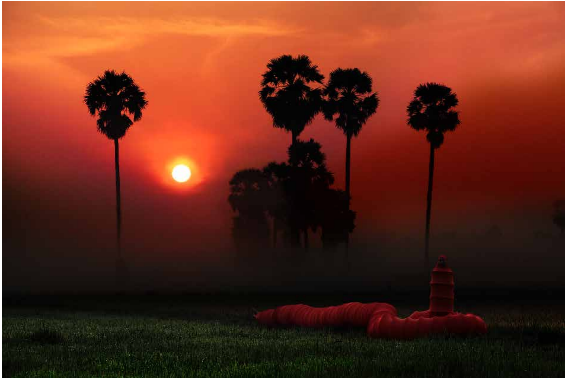
Into the Fields (The Buddhist Bug series) (2014) | Archival Inkjet Print; 100cm x 150cm (edition of 5)