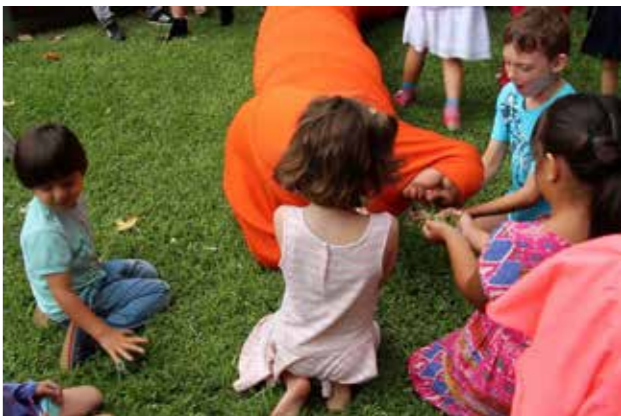
Bug Sightings (The Buddhist Bug series) (2012-2015) | Photo documentation of live performances of The Bug performances around the world; Archival Inkjet prints mounted on angular foam core structures; 6 sets of prints measuring 50cm x 75cm each