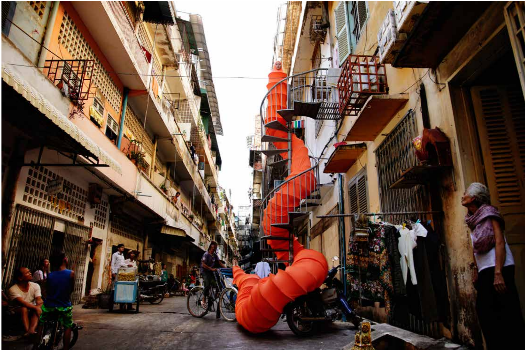
Spiral Alley (The Buddhist Bug series) (2012) | Archival Inkjet Print; 100cm x 150cm (edition of 5)