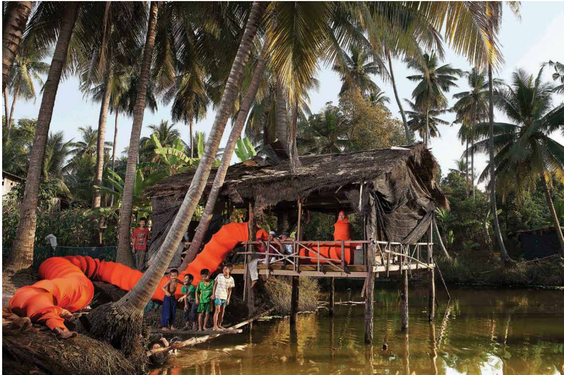
Secret Lagoon (The Buddhist Bug series) (2014) | Archival Inkjet Print; 75cm x 112.5cm (edition of 5)