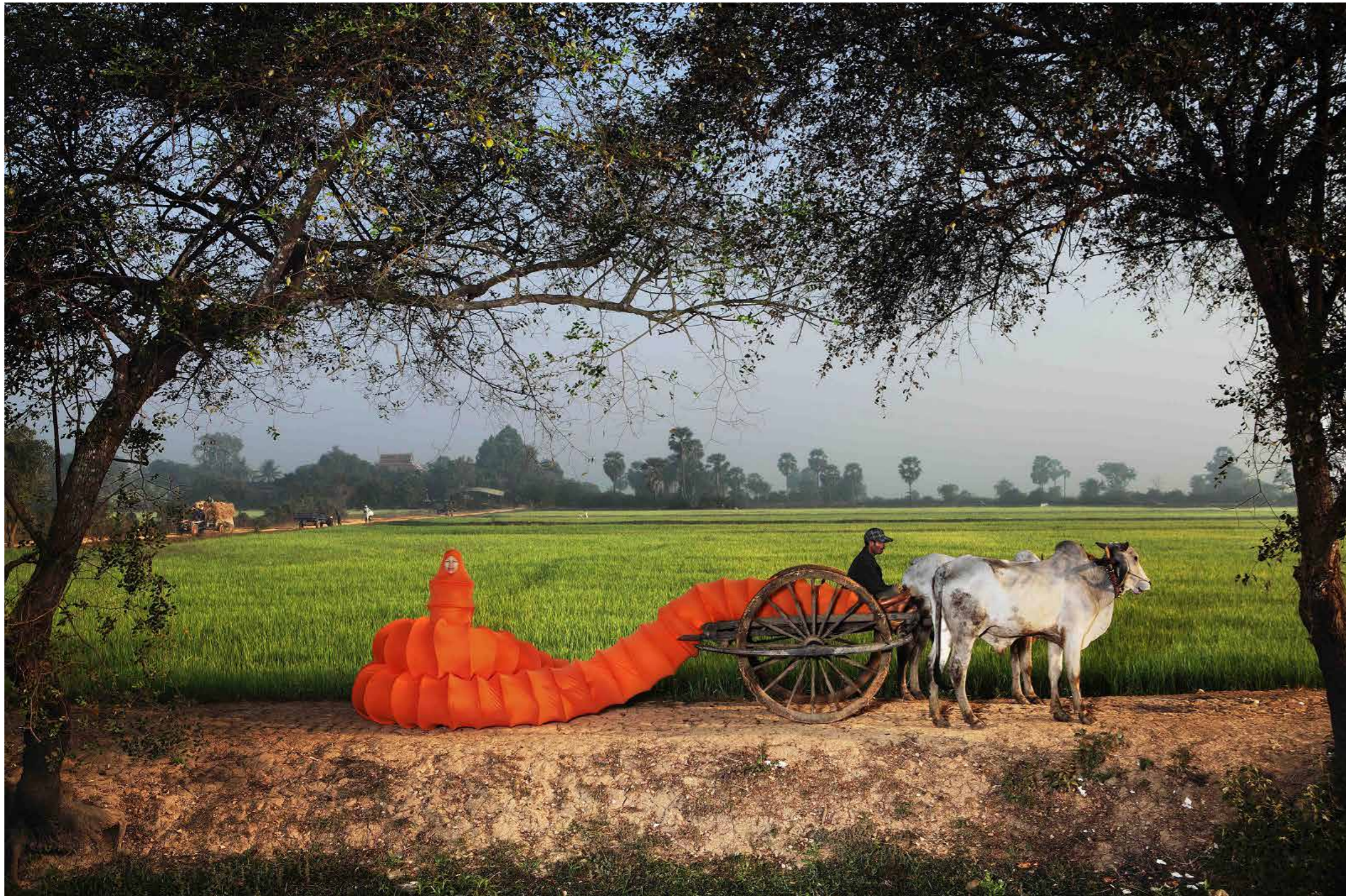
Oxcart Grazing (The Buddhist Bug series) (2014) | Archival Inkjet Print; 100cm x 150cm (edition of 5)