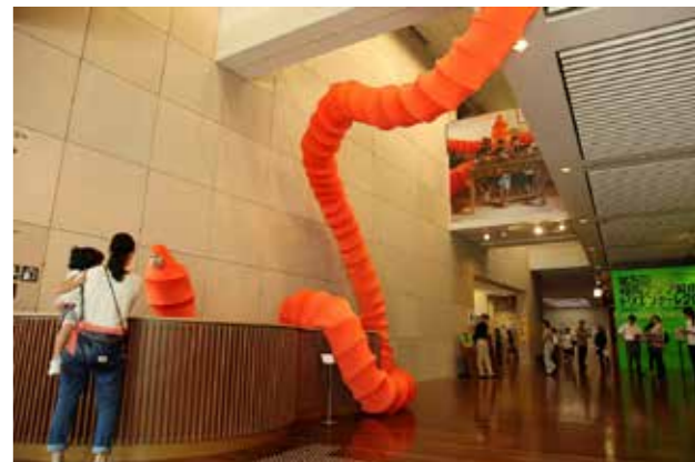
Bug Sightings (The Buddhist Bug series) (2012-2015) | Photo documentation of live performances of The Bug performances around the world; Archival Inkjet prints mounted on angular foam core structures; 6 sets of prints measuring 50cm x 75cm each