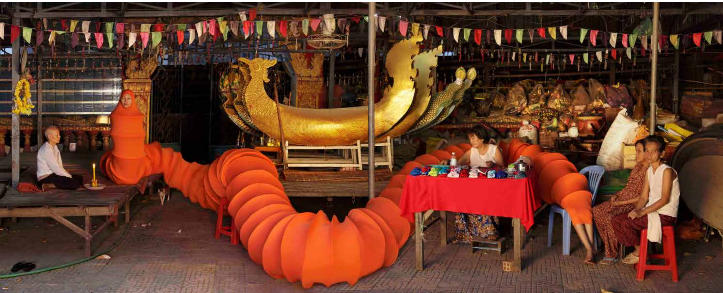
Off the Golden Ship (The Buddhist Bug series) (2013) Archival Inkjet Print; 75cm x 182cm (edition of 5)