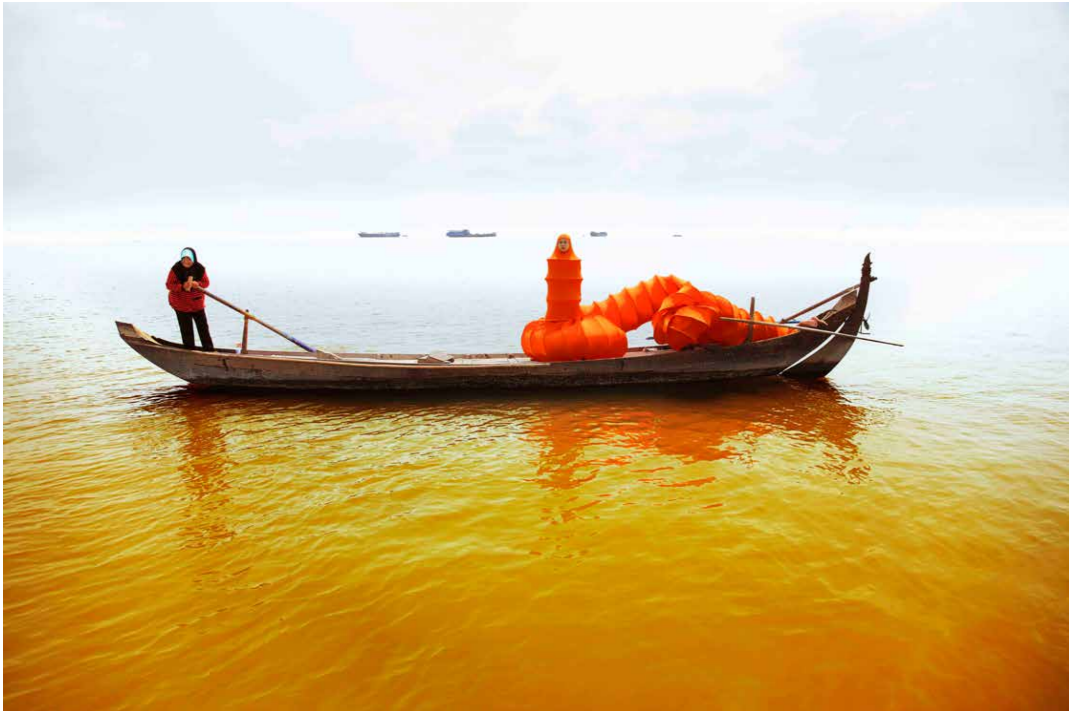
On the River (The Buddhist Bug series) (2013) | Archival Inkjet Print; 75cm x 112.5cm (edition of 5)