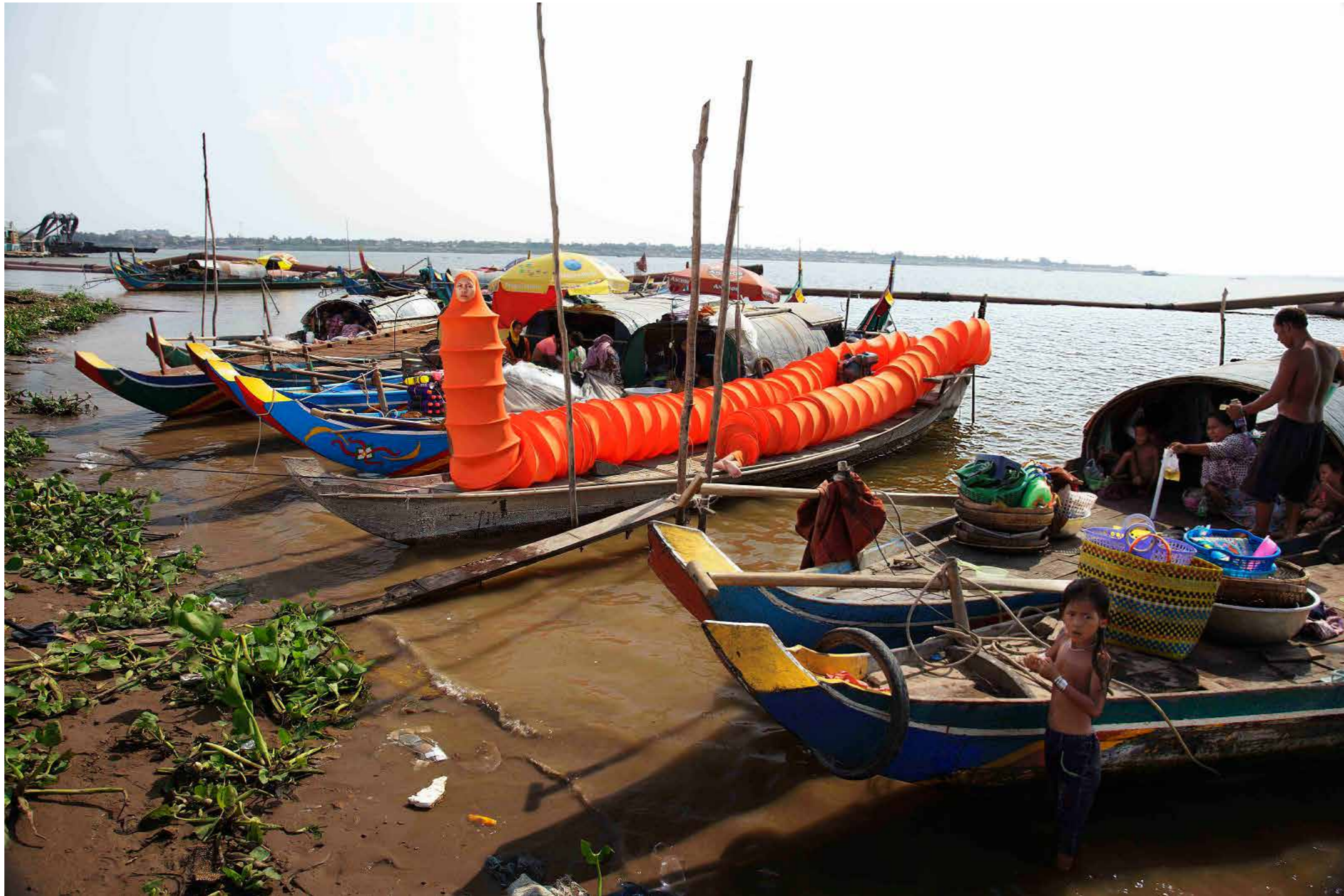
River Landing (The Buddhist Bug series) (2013) | Archival Inkjet Print; 75cm x 112.5cm (edition of 5)