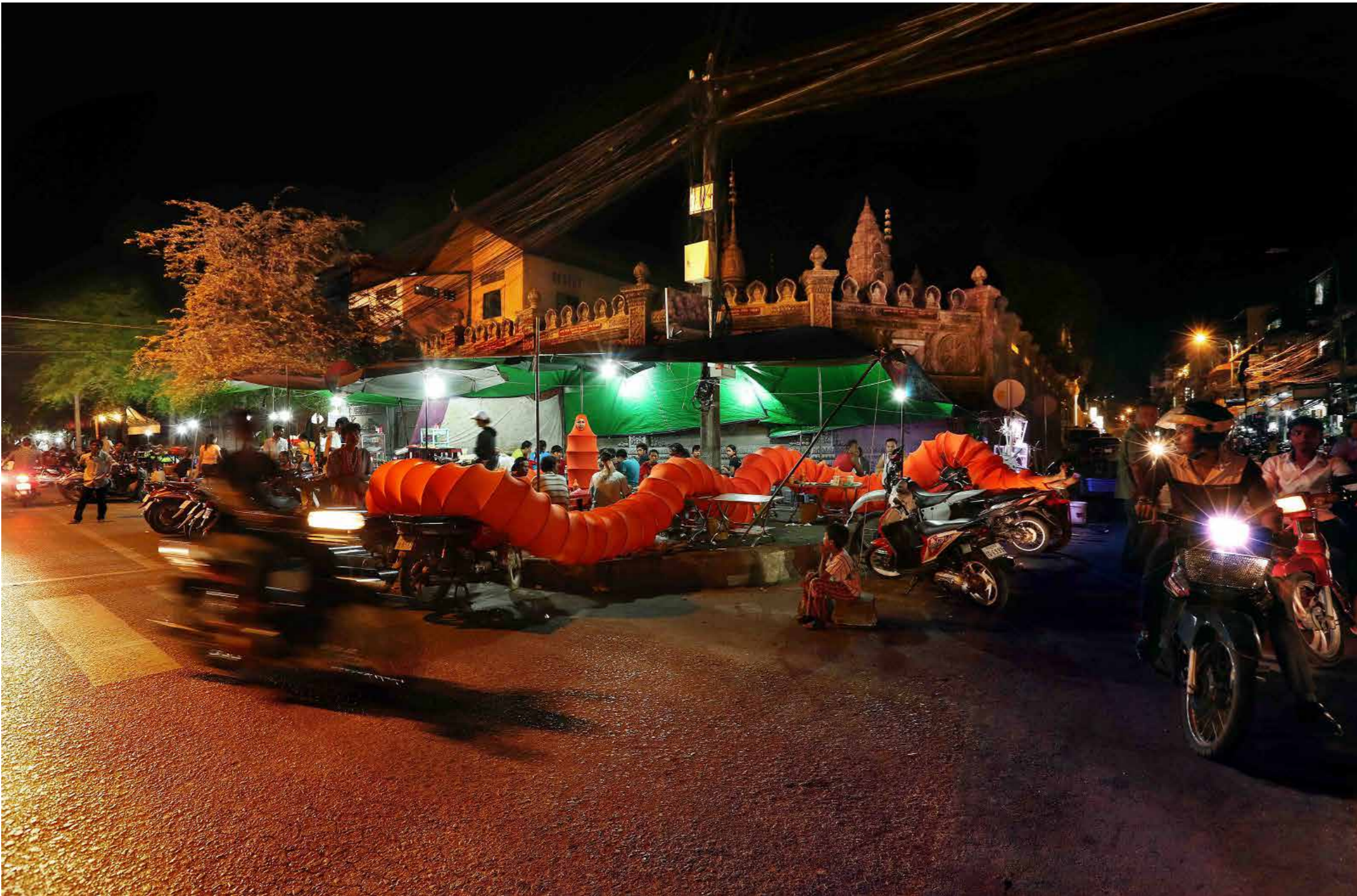
Late Night Snack (The Buddhist Bug series) (2015) | Archival Inkjet Print; 100cm x 152cm (edition of 5)