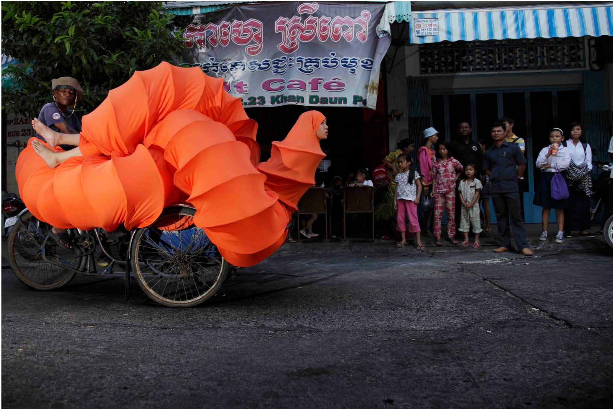
Around Town #1 (The Buddhist Bug series) (2012) | Archival Inkjet Print; 100cm x 150cm (edition of 5)