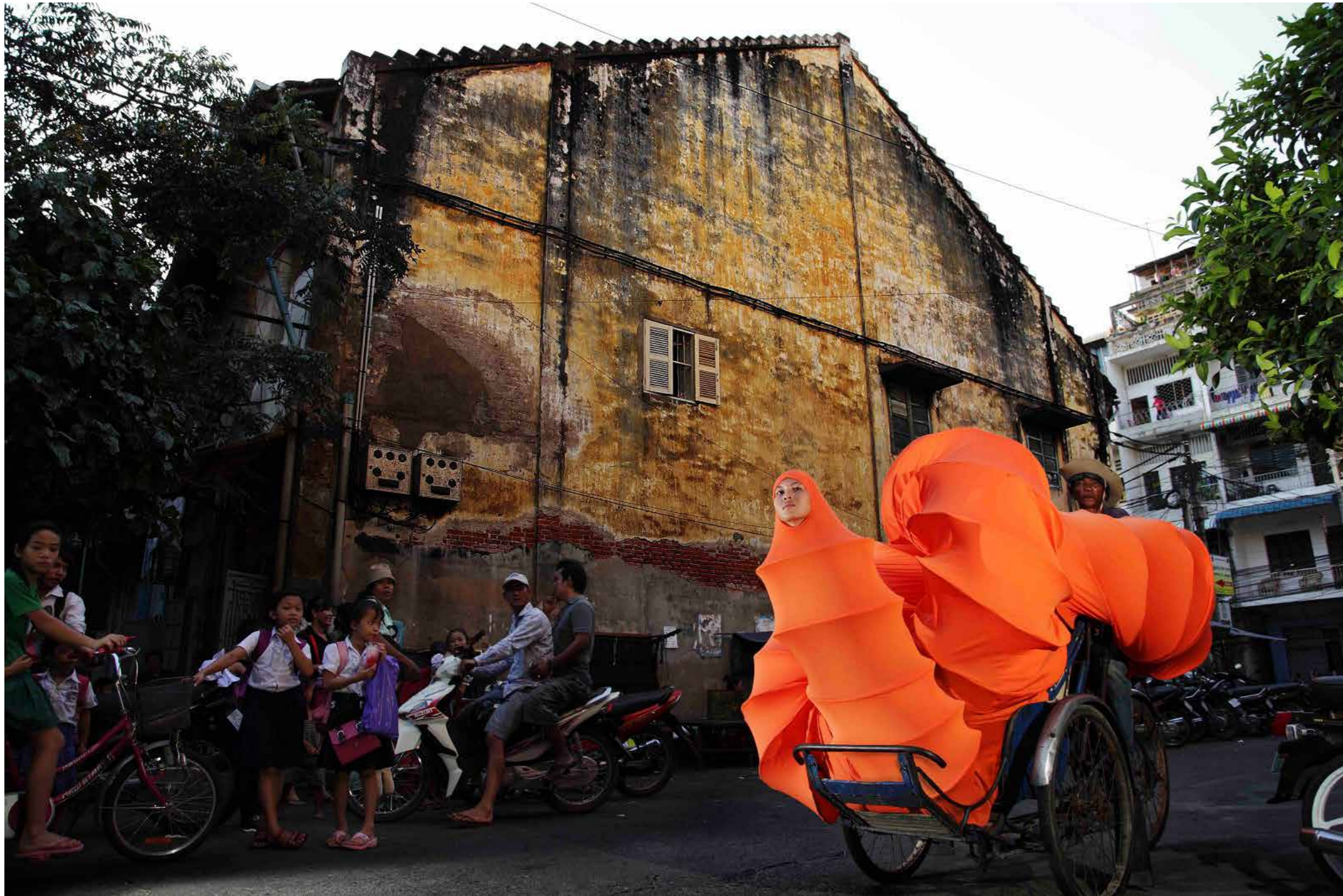
Around Town #2 (The Buddhist Bug series) (2012) | Archival Inkjet Print; 100cm x 150cm (edition of 5)