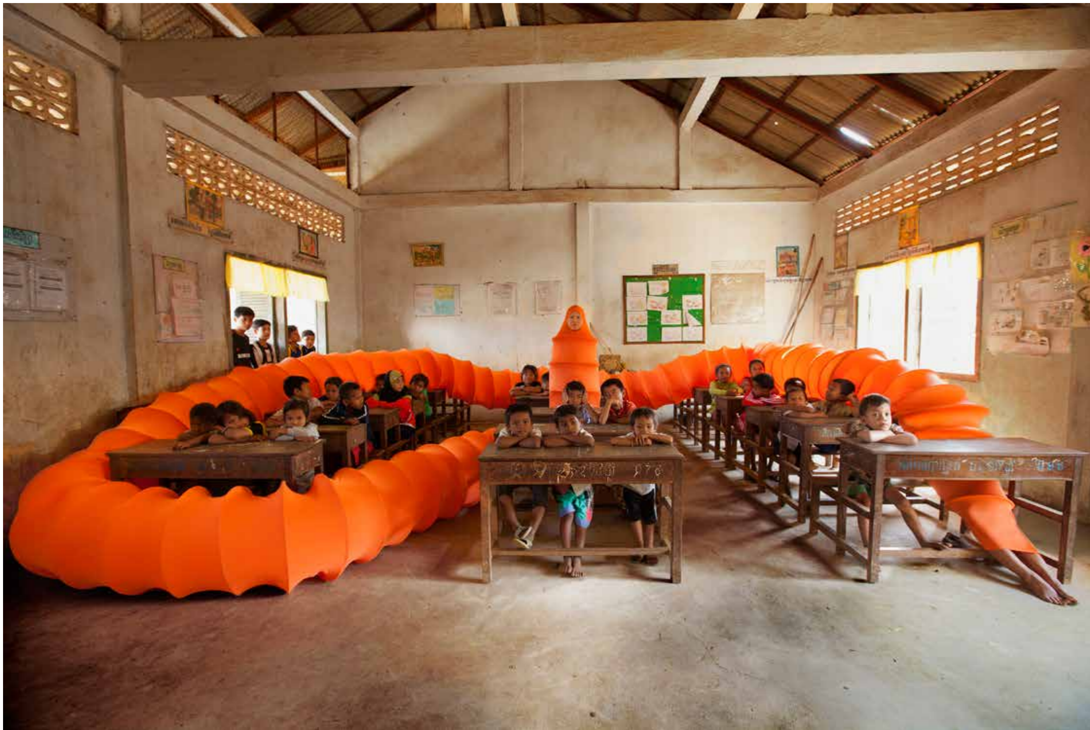
Roll Call (The Buddhist Bug series) (2014) | Archival Inkjet Print; 100cm x 150cm (edition of 5)