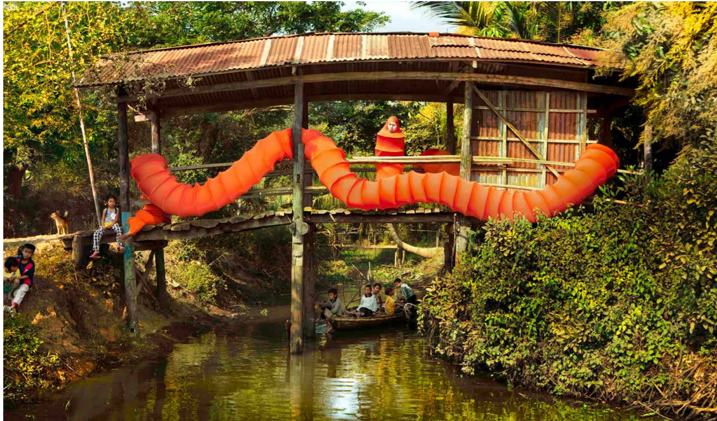
Bridge Over a Small River (The Buddhist Bug series) (2014) Archival Inkjet Print; 75cm x 127.5cm (edition of 5)