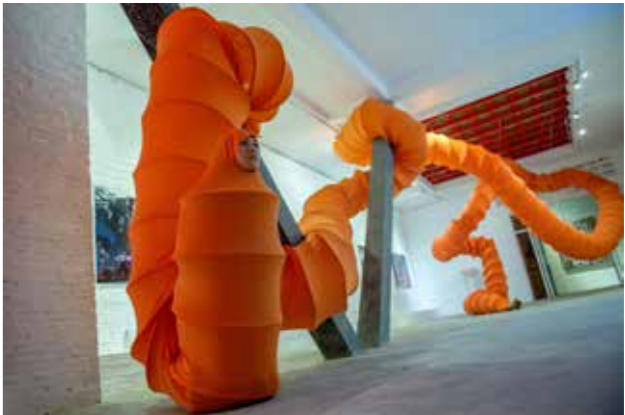
Bug Sightings (The Buddhist Bug series) (2012-2015) | Photo documentation of live performances of The Bug performances around the world; Archival Inkjet prints mounted on angular foam core structures; 6 sets of prints measuring 50cm x 75cm each