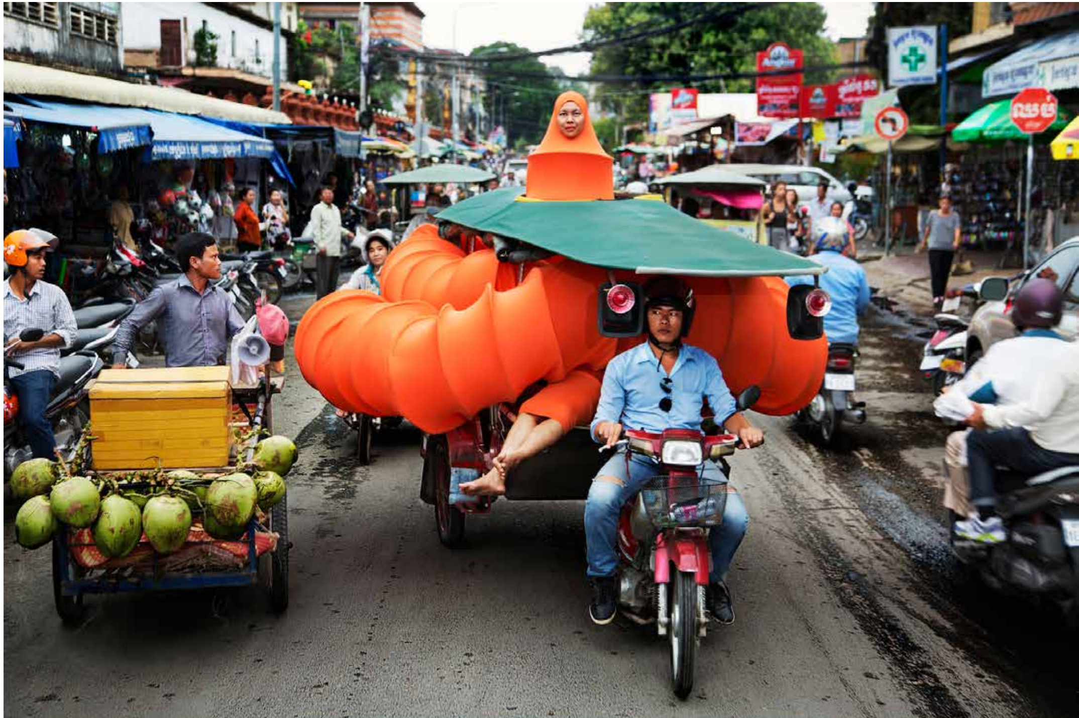
Coconut Road (The Buddhist Bug series) (2015) | Archival Inkjet Print; 100cm x 150cm (edition of 5)