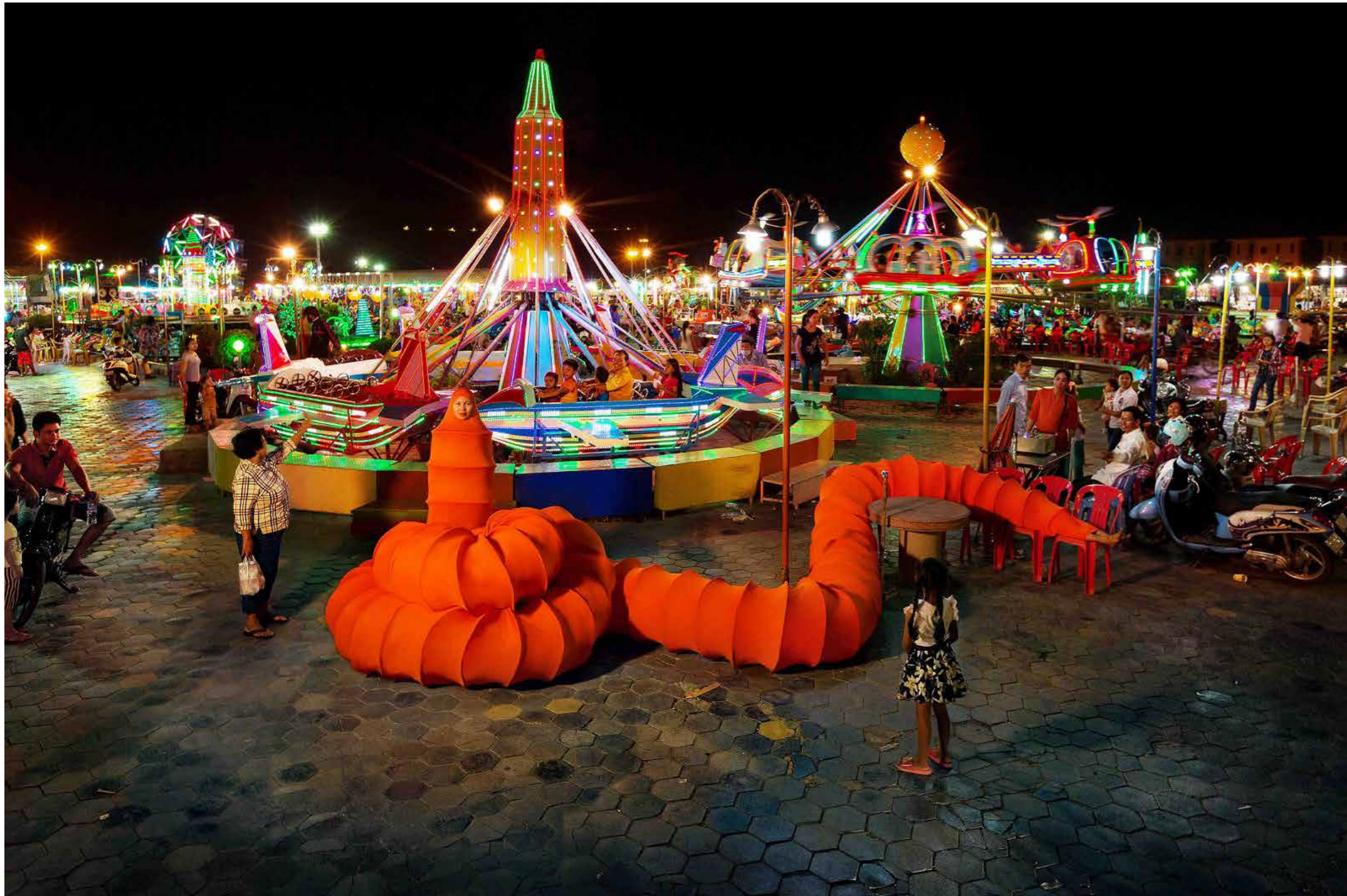
Into Dreamland (The Buddhist Bug series) (2015) | Archival Inkjet Print; 100cm x 150cm (edition of 5)