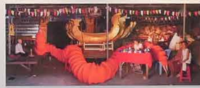
Sundried Landing (The Buddhist Bug series) (2014) Installation view