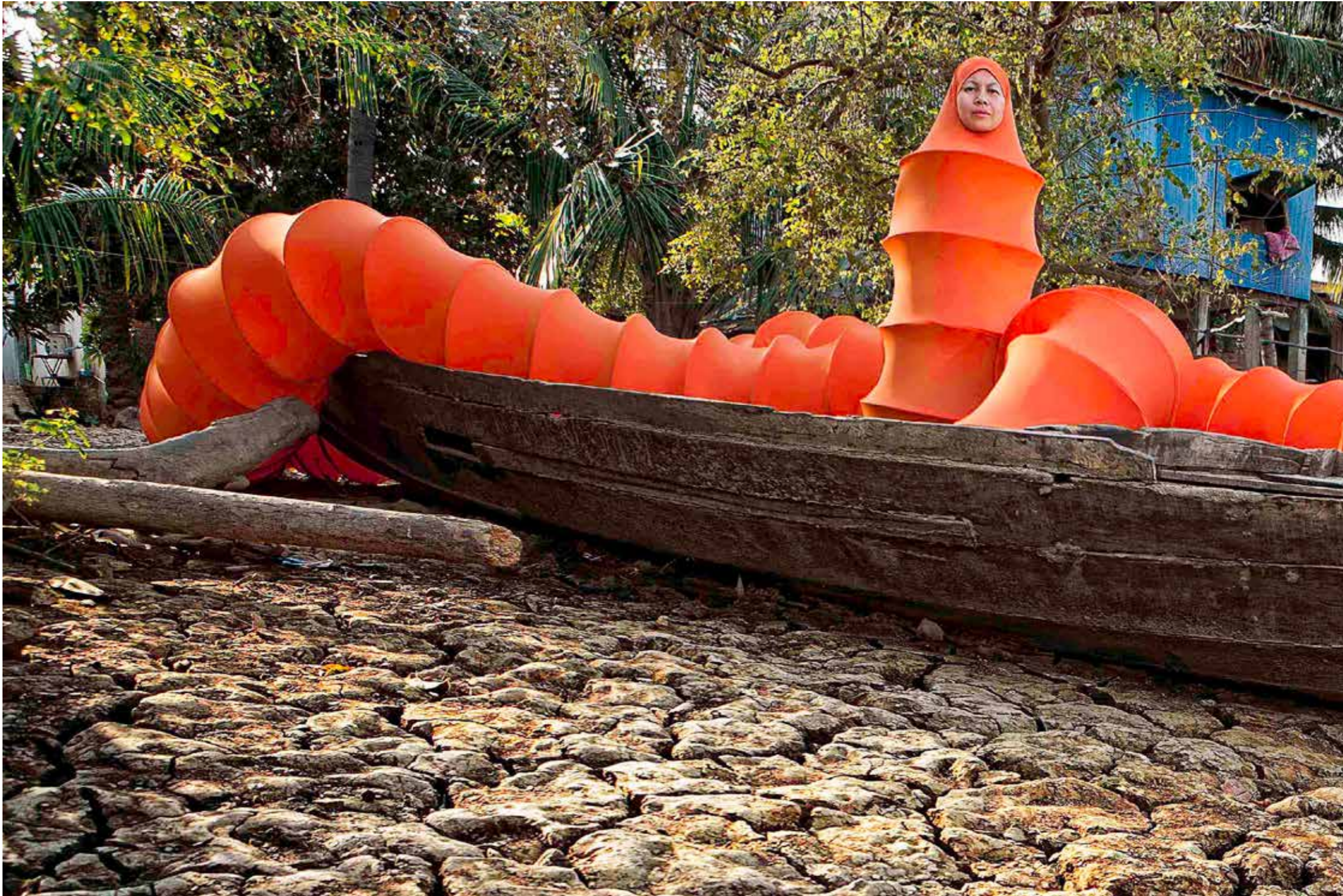
Sundried Landing (The Buddhist Bug series) (2014) | Archival Inkjet Print; 75cm x 112.5cm (edition of 5)