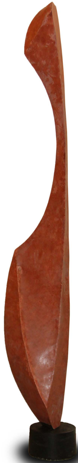
Yamlikha 275 x 50 x 50 cm - Bronze - 2009