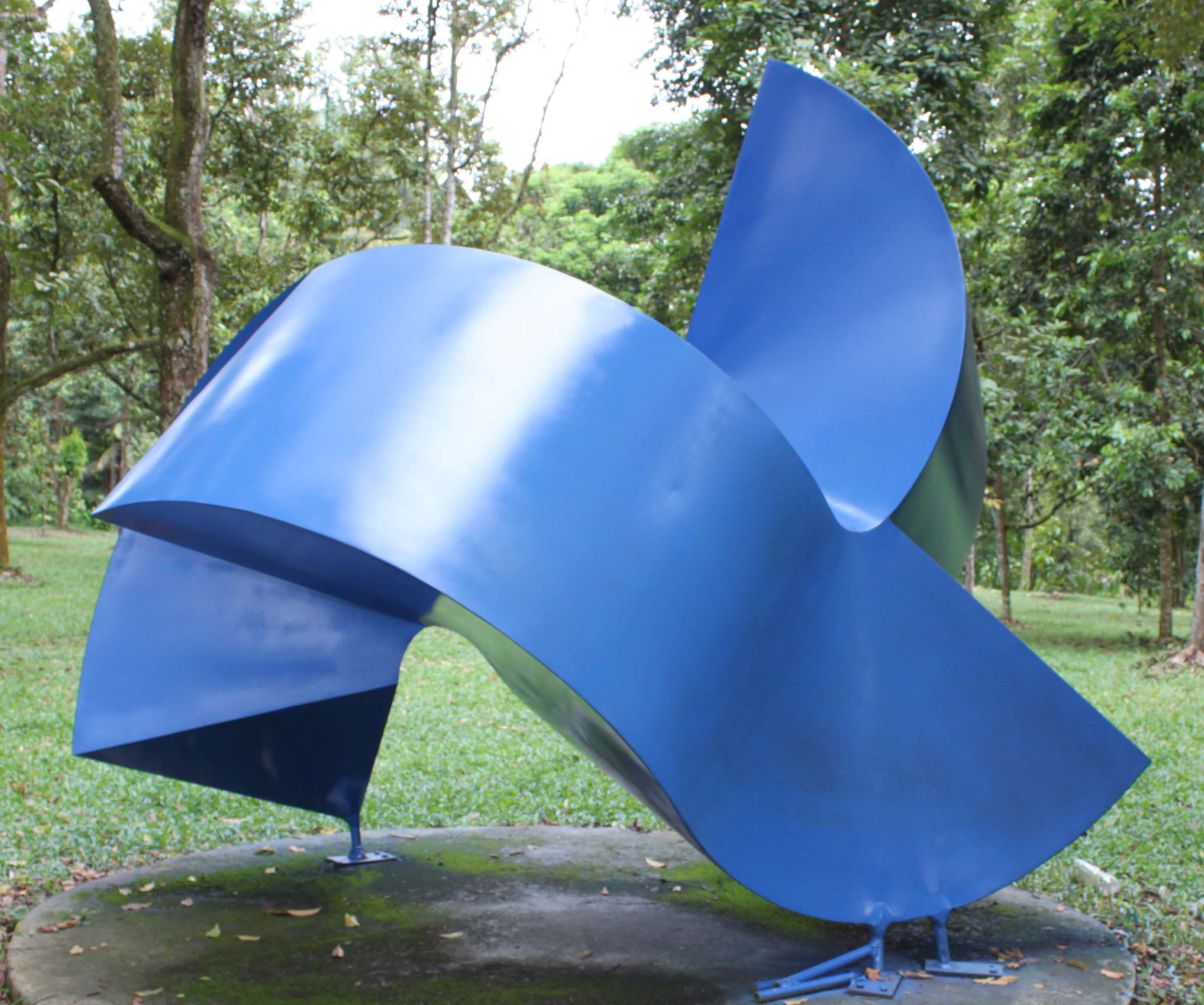
Siguntang 350 x 250 x 280 cm - Aluminium - 2009