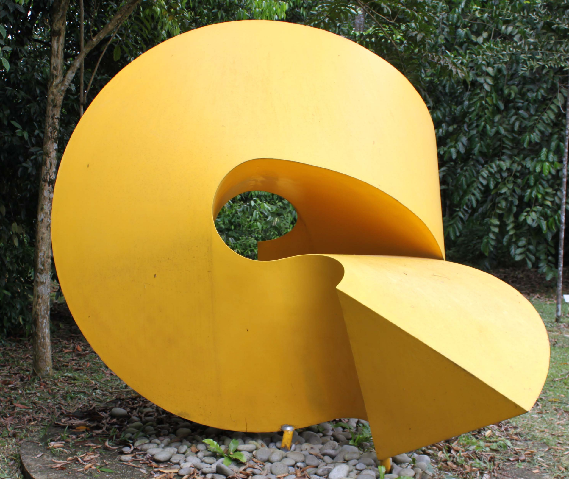
Sibayak 250 x 250 x 300 cm - Aluminium - 2007