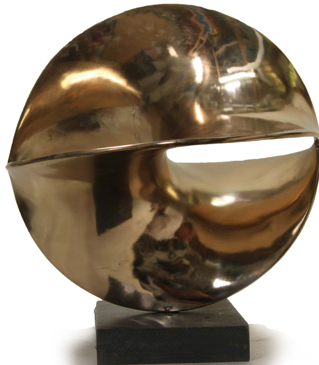
Polanoor 32 x 32 x 32 cm - Bronze - 1996