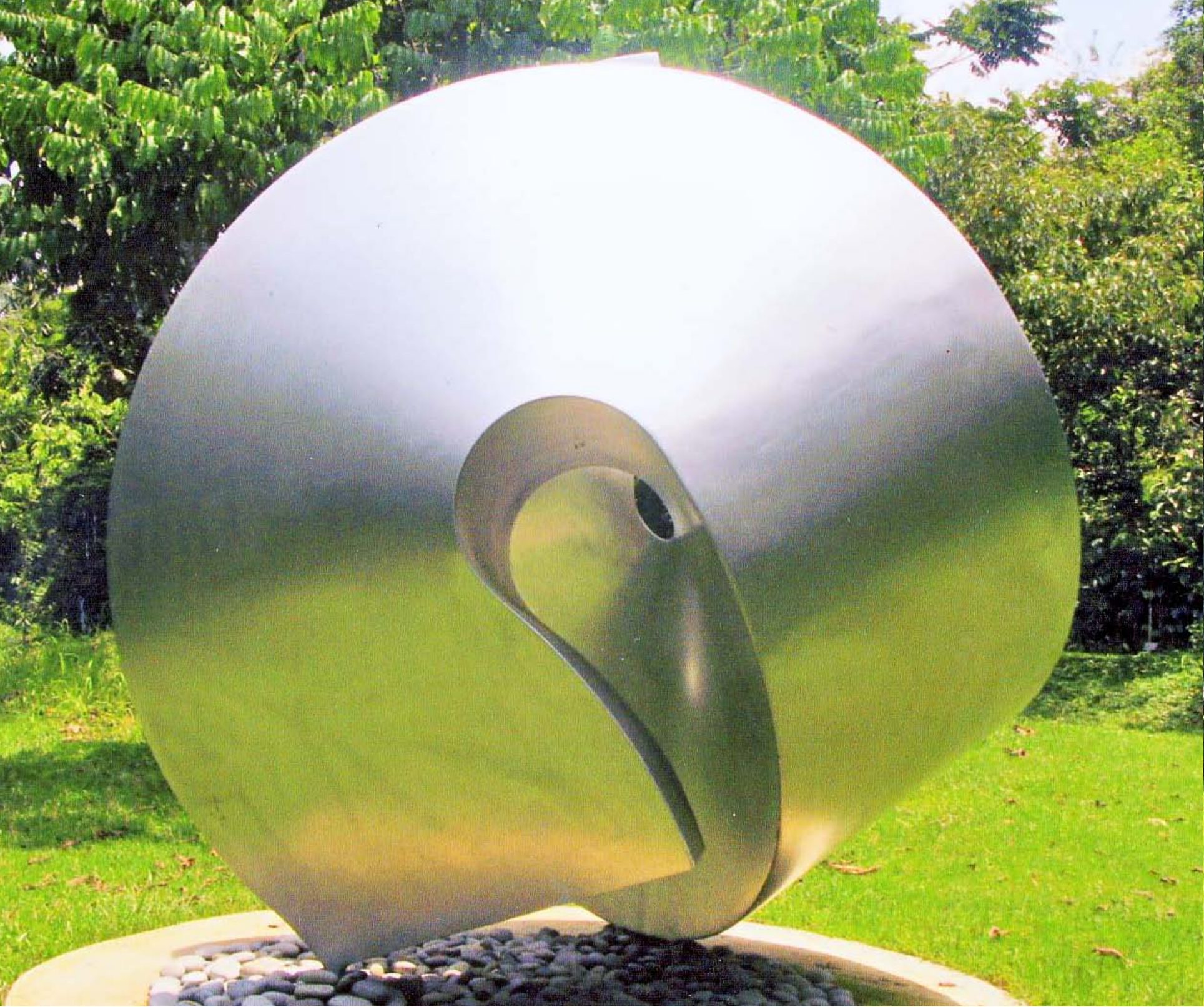
Gelang Patah 300 x 270 x 270 cm - Aluminium - 2008