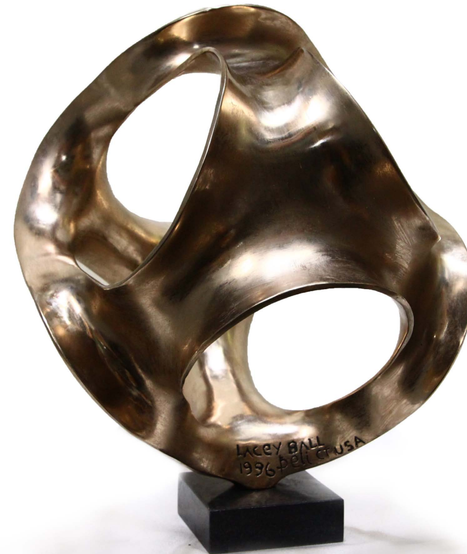
Lacey Ball 46 x 46 x 46 cm - Bronze - 1996