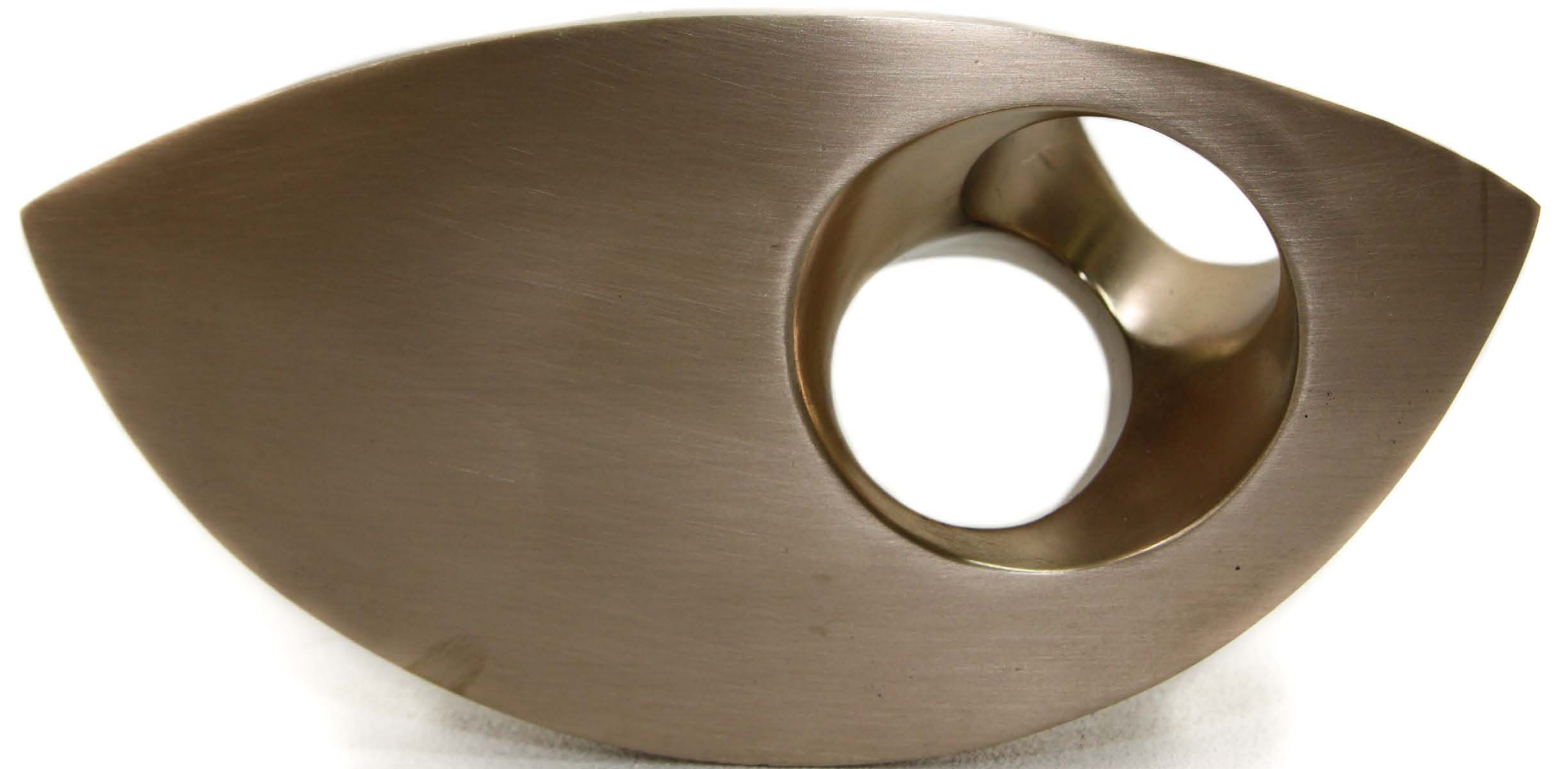
Bowarc 23 x 13 x 7.5 cm - Bronze - 1997 (Enlargeable from 1 to 4 meter)