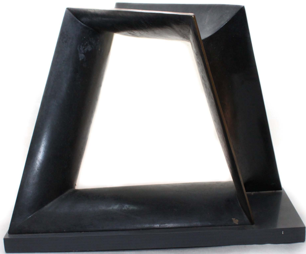
Untitled 51 x 51 x 51 cm - Bronze - 1993