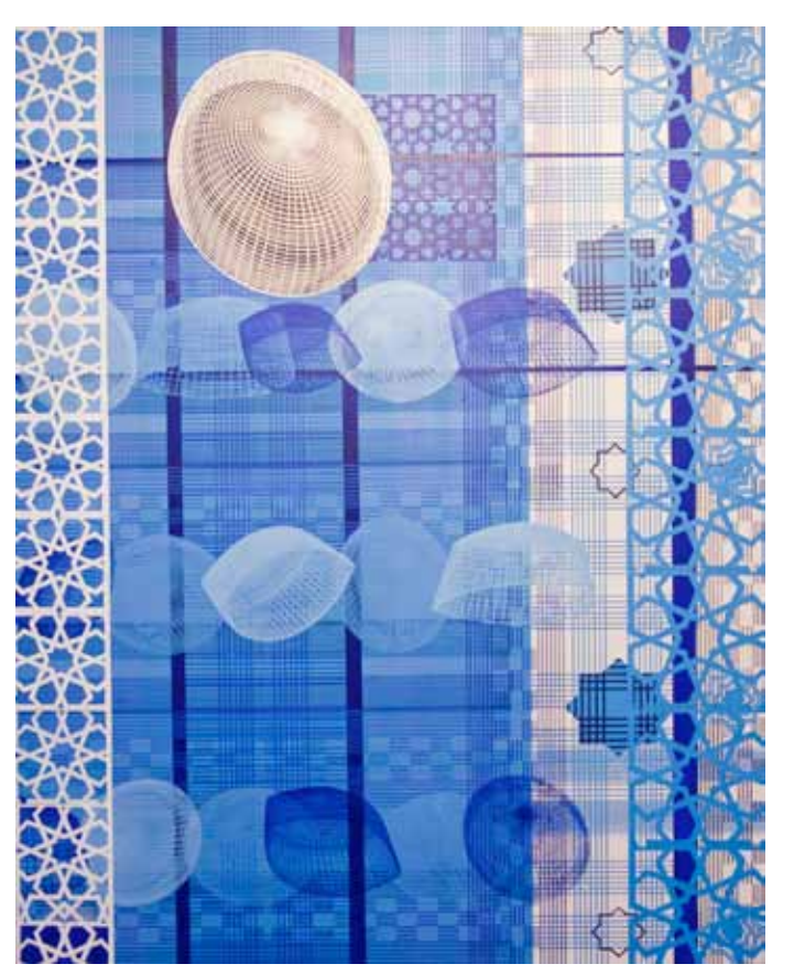
Friday . 122cm x 152cm . Acrylic on Canvas . 2010