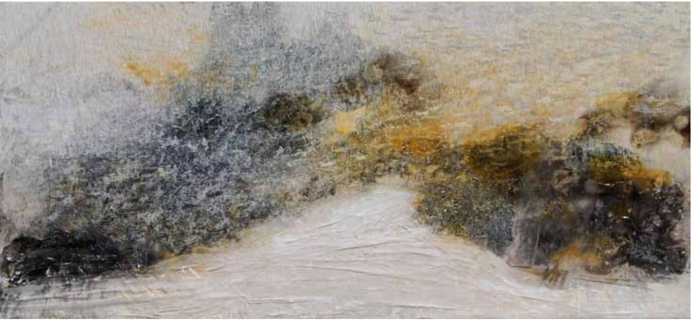
Mythology Series - The World was formed ages ago when an ancient legend ran dry . 105cm x 227cm . Gauze, Silk Screen, Tempera, Charcoal, Acrylic, Oil Colour, Drawing Ink, Pencil, White Glue, Varnish on Canvas . 2010

Tuck Wai's paintings are about the desecration of the environment and history. His mixed media works are richly textured and largely monochromatic. They express the erosion and decay that besets our world and our traditions. Some of the images are akin to ancient walls of stone seemingly still standing and fighting off the ravages of time