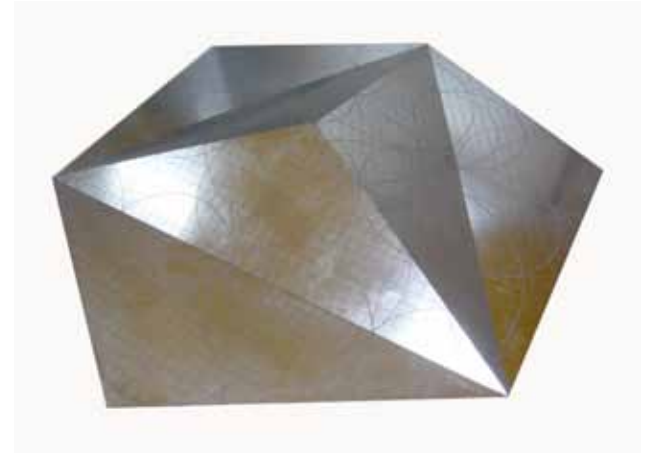
Metalanguage . 142cm x 142cm x 12.7cm . Aluminium . 2010

2009 SMU – ASEAN Artist Residency Programme, Singapore Management University, Singapore