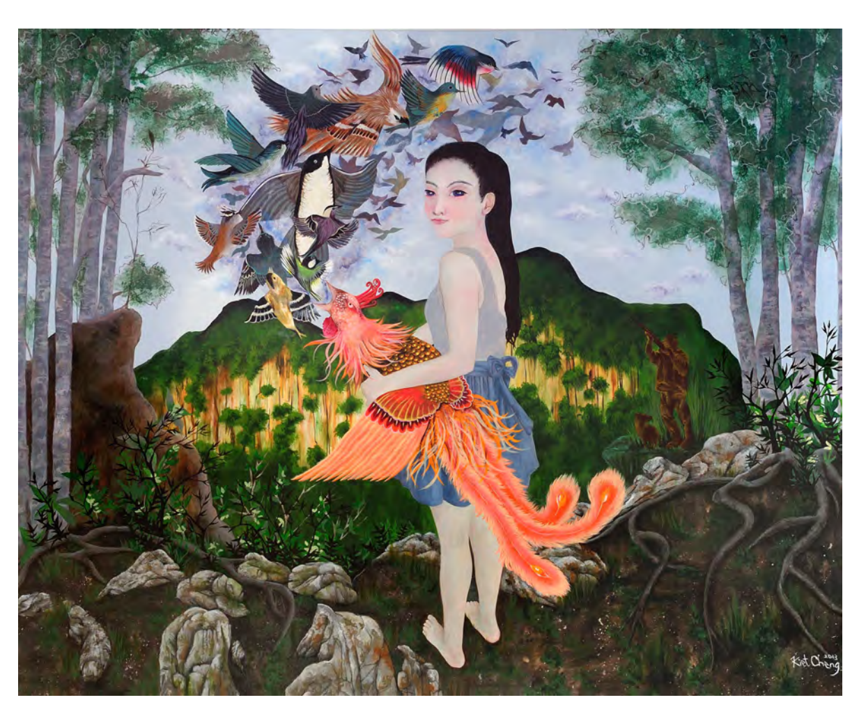
In a morning , Acrylic on canvas, 140cm x 172cm, 2013