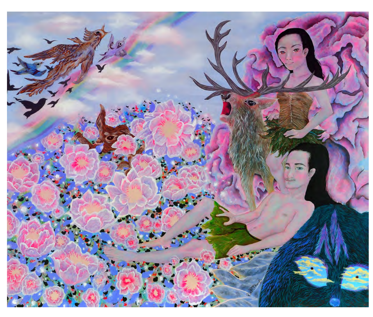
A Thousand Love, 139cm x 169 cm, Acrylic on canvas, 2013