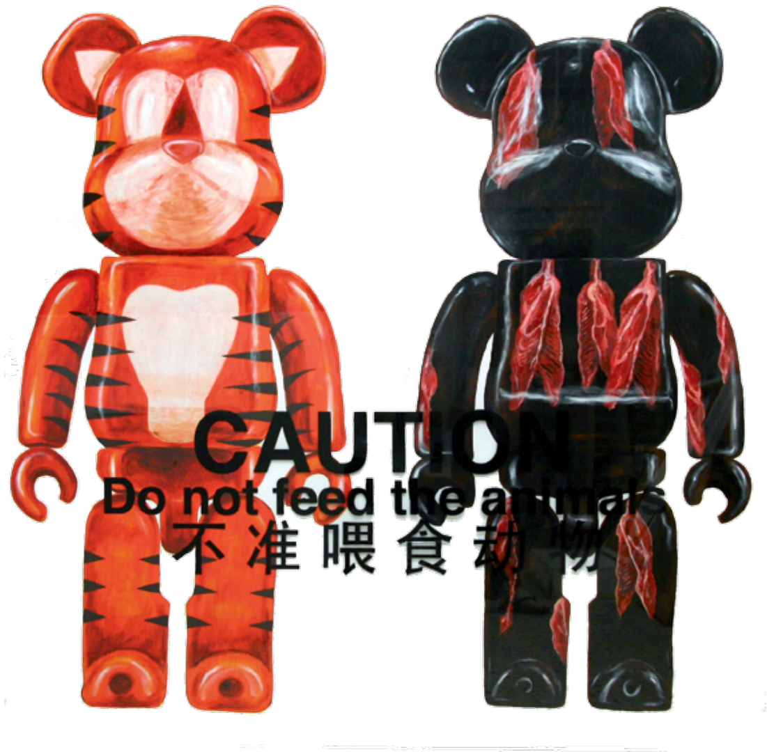
The Tiger Show 1