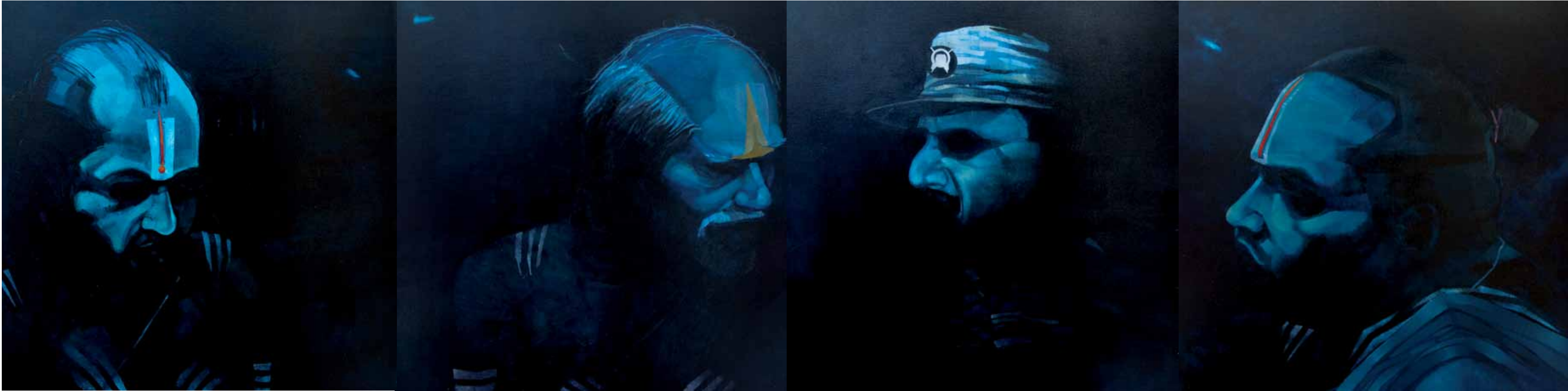
Walking With the Poets