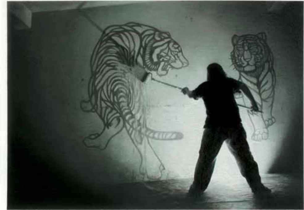
Paint(ing) Tiger II 15 x 21 cm Oil on Paper 2010