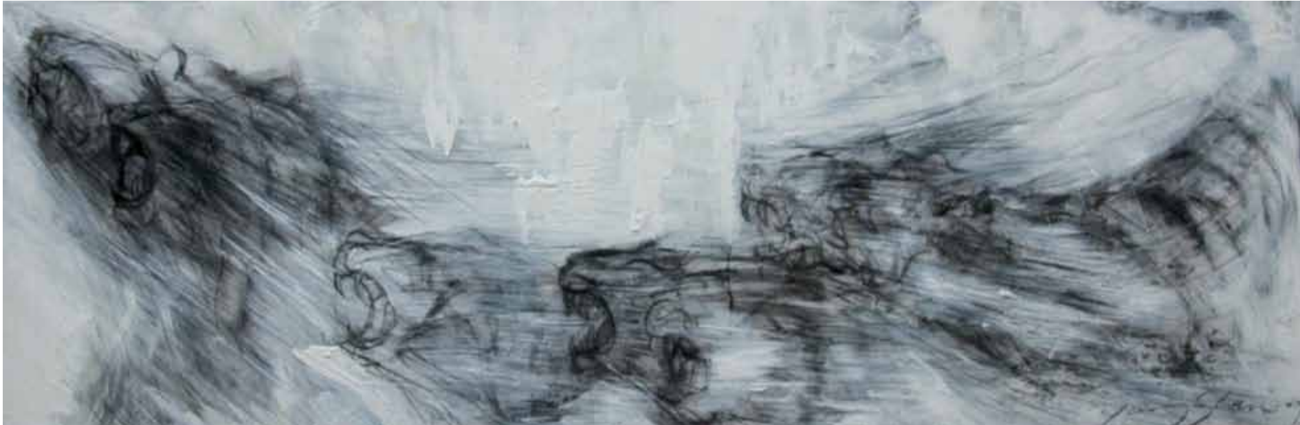
Eye of the Tiger II