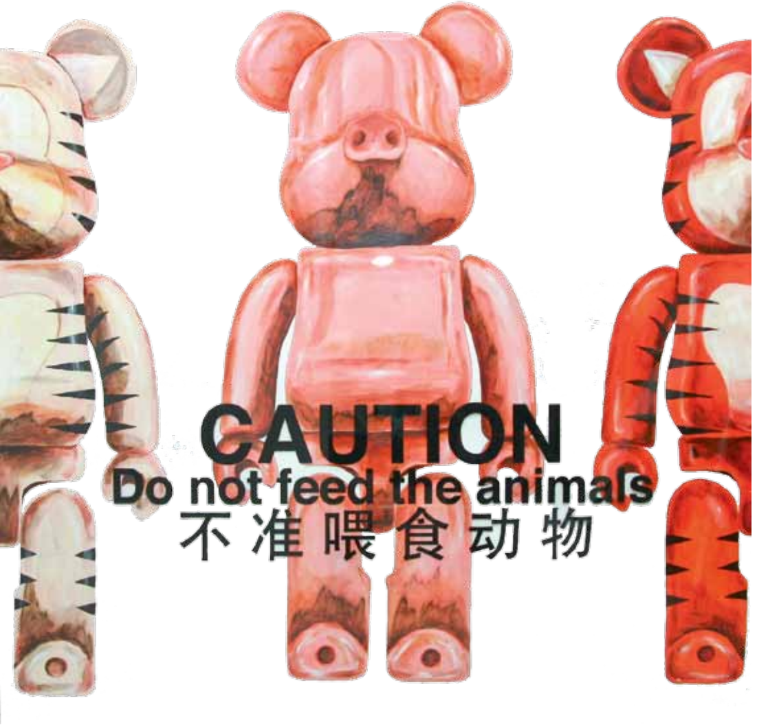
The Tiger Show 2