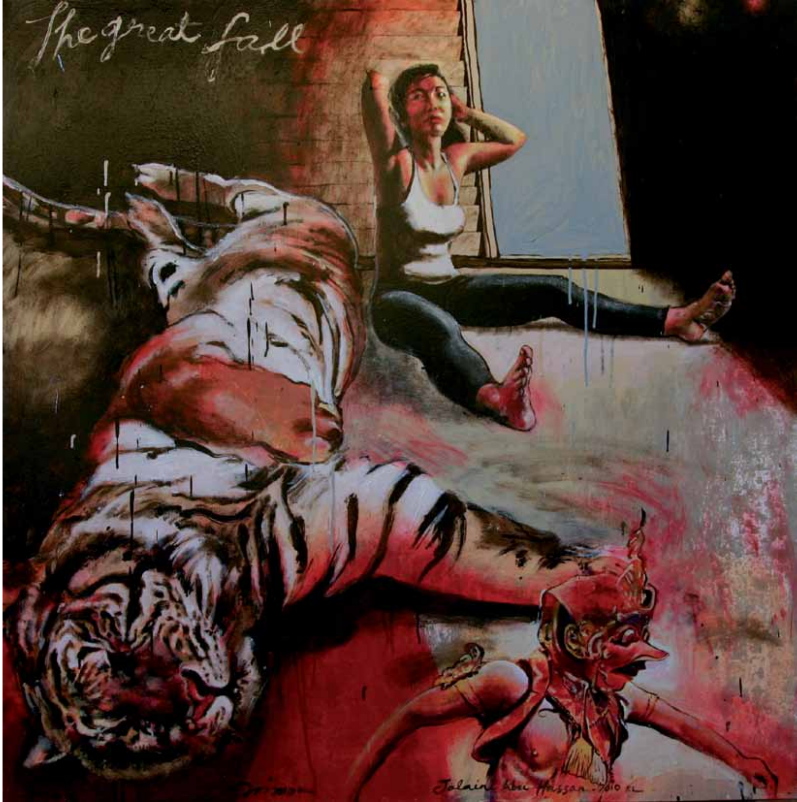
The Great Fall 122 x 122 cm Oil & Charcoal on Canvas 2009