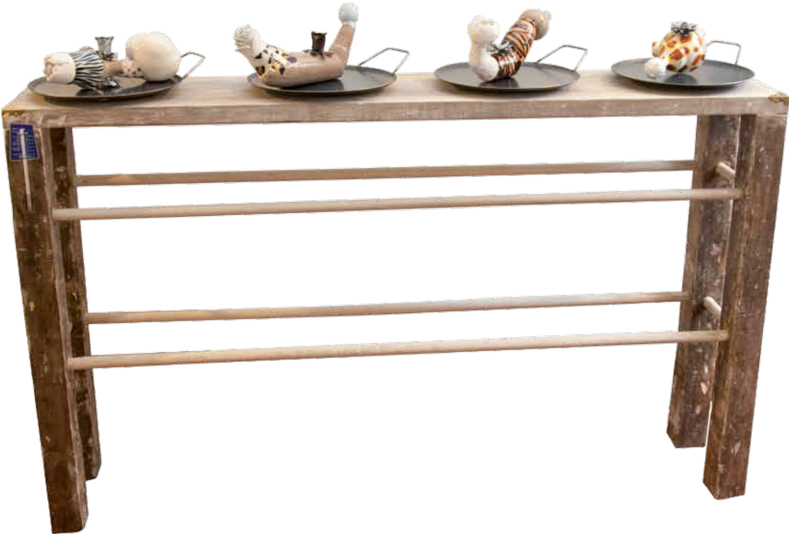
New Recipe 102 x 146 x 28 cm porcelain, decals, metal flower,screw, pan,thermometer, wooden table 2010