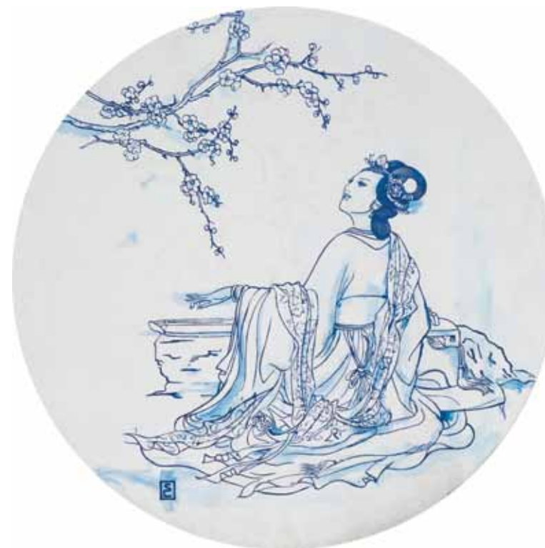
Excelsior Fresco-Stencils no.1773 Alkyd Enamel on canvas 80cm x 80cm 2015