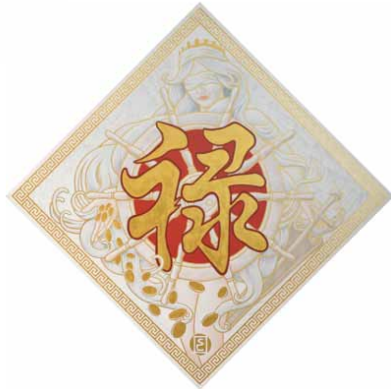
Felicitas Alkyd Enamel on canvas 273cm x 273cm 2015