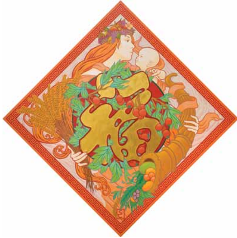
Fortuna Alkyd Enamel on canvas 273cm x 273cm 2015