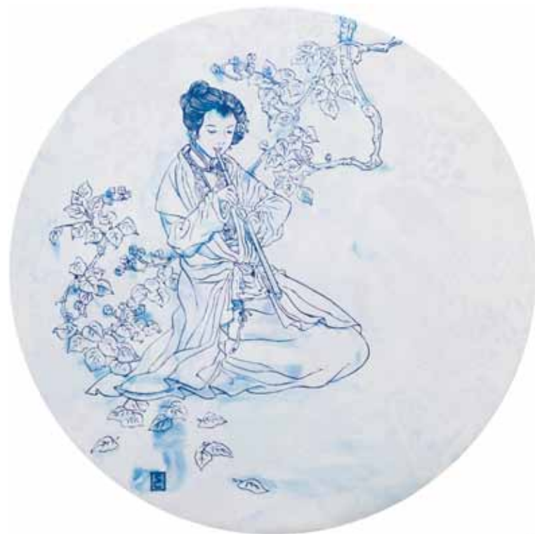
Excelsior Fresco-Stencils no.1676 Alkyd Enamel on canvas 80cm x 80cm 2015