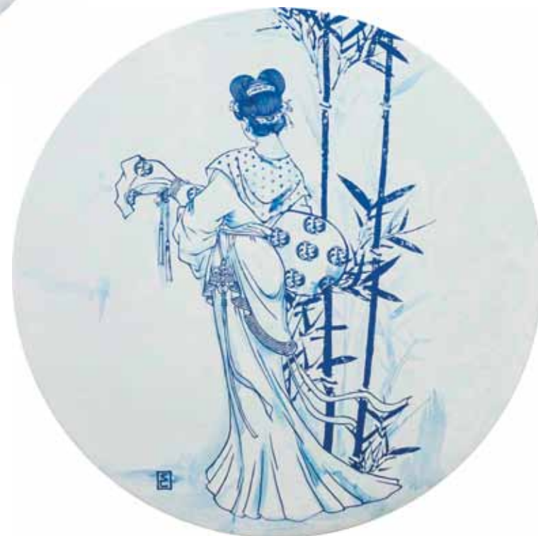
Excelsior Fresco-Stencils no.1677 Alkyd Enamel on canvas 80cm x 80cm 2015