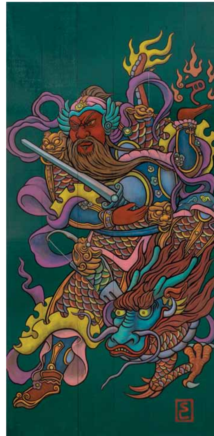
Green Door (Guardian) Alkyd Enamel on panels 230cm x 113cm 2015