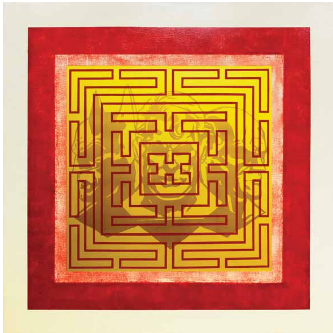
Dear God(s) II Mixed media on canvas 178cm x 178cm 2014