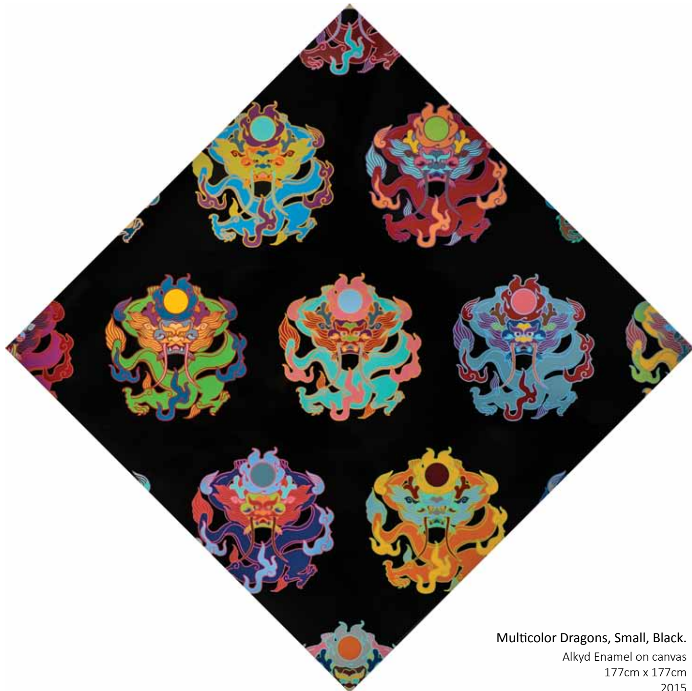
Multicolor Dragons, Small, Black. Alkyd Enamel on canvas 177cm x 177cm 2015