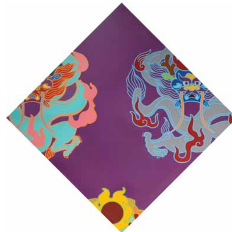
Multicolor Dragon, Medium, Purple. Alkyd Enamel on canvas 177cm x 177cm 2015