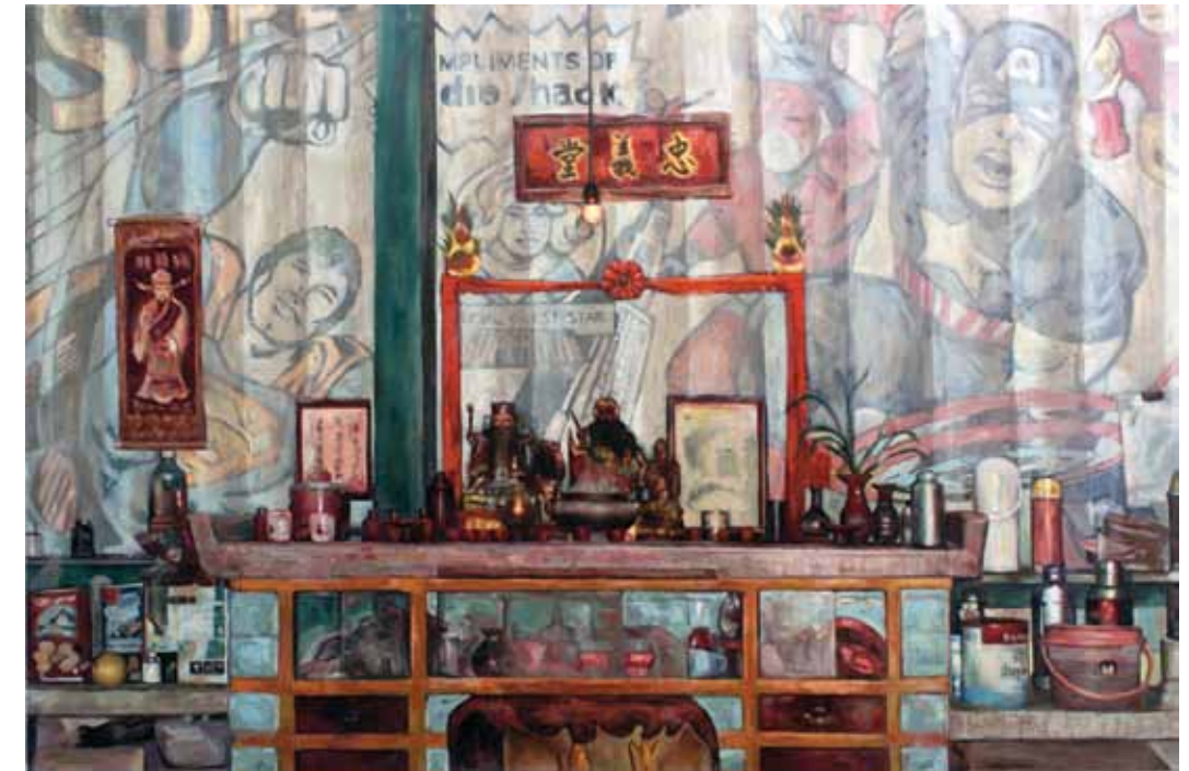
Dear God(s) Oil on canvas 122cm x 183cm 2009