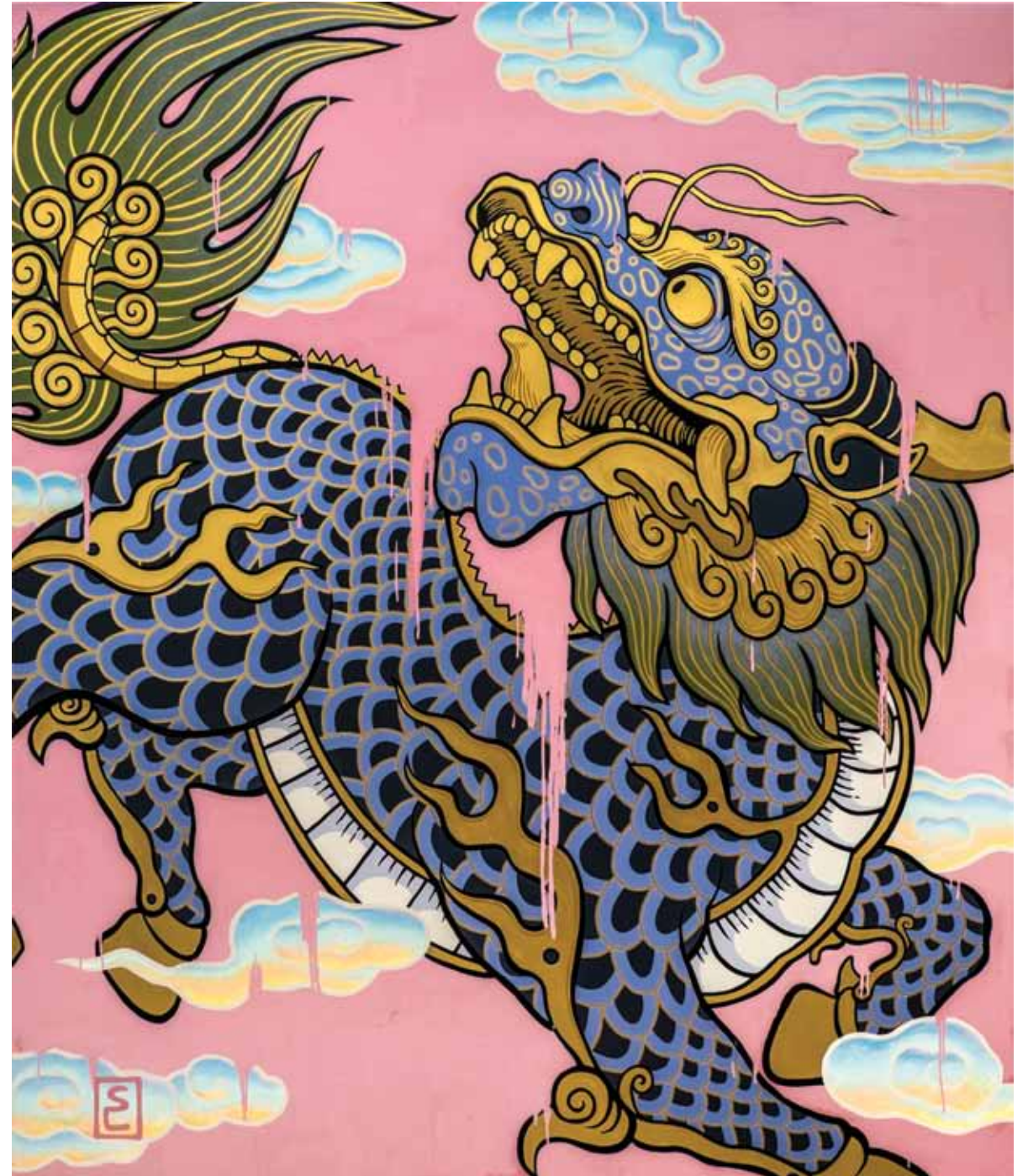
Cotton Candy Pink Mixed media on canvas 229cm x 196cm 2015