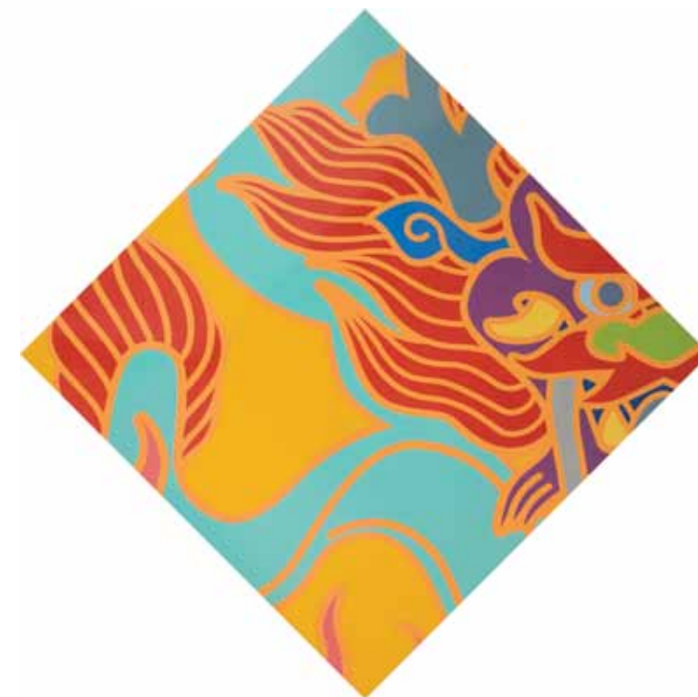
Multicolor Dragon, Large, Yellow. Alkyd Enamel on canvas 177cm x 177cm 2015