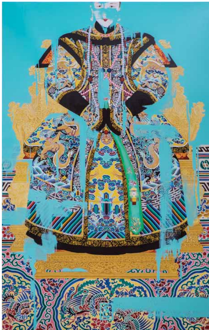
Tiffany Blue Alkyd Enamel on canvas 231cm x 146cm 2015