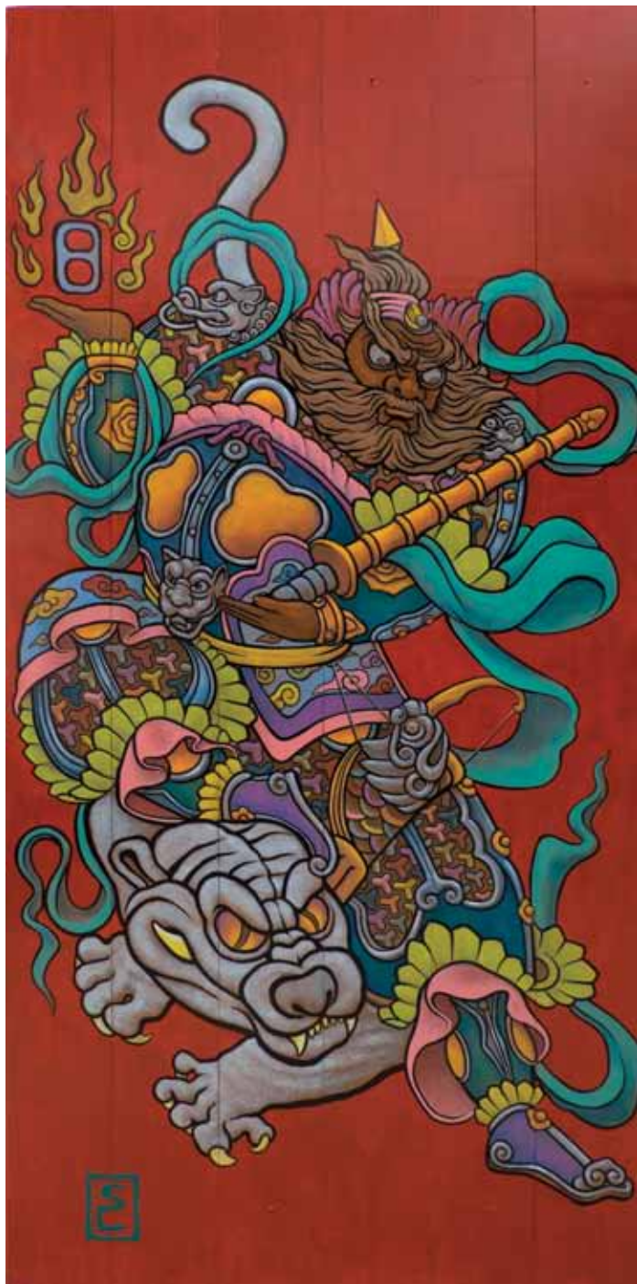
Red Door (Guardian) Alkyd Enamel on panels 230cm x 113cm 2015