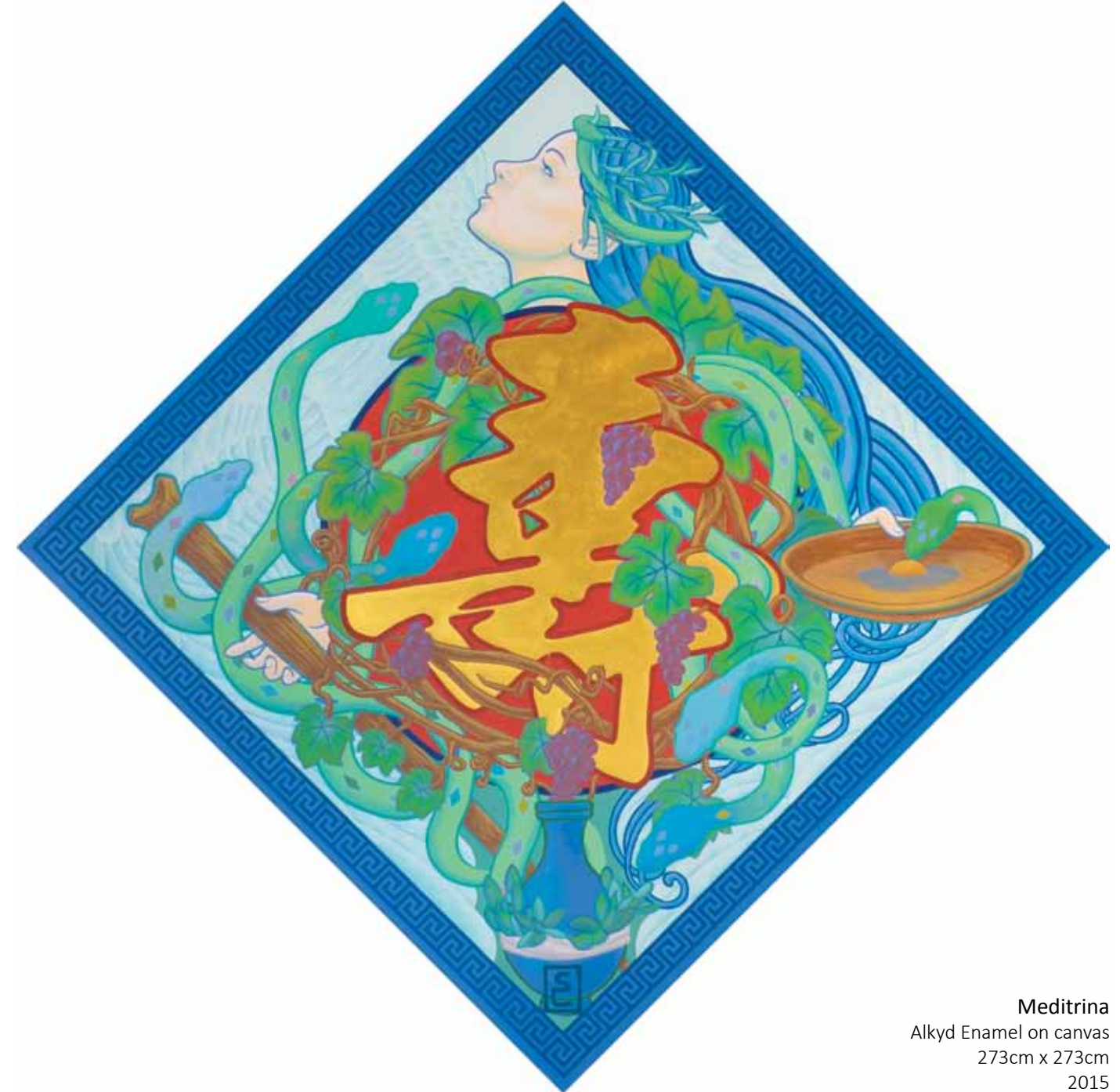
Meditrina Alkyd Enamel on canvas 273cm x 273cm 2015