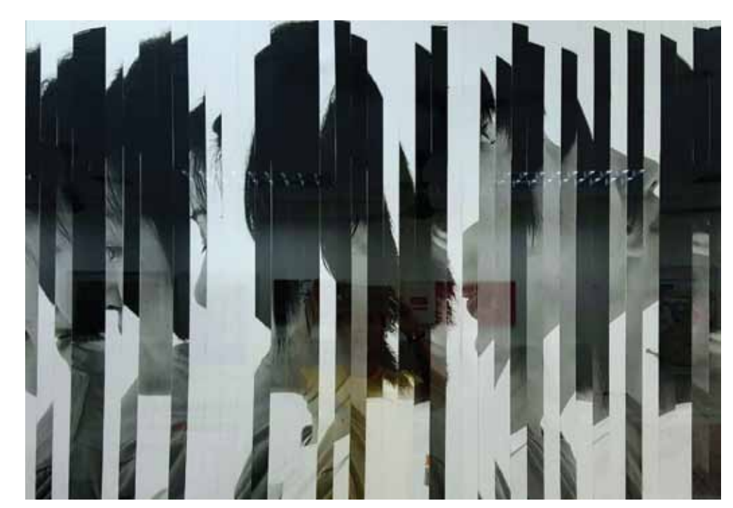
Patchwork of not seeing face to face 89 x 122 x 3cm Laminated print on matt paper, framed 2016