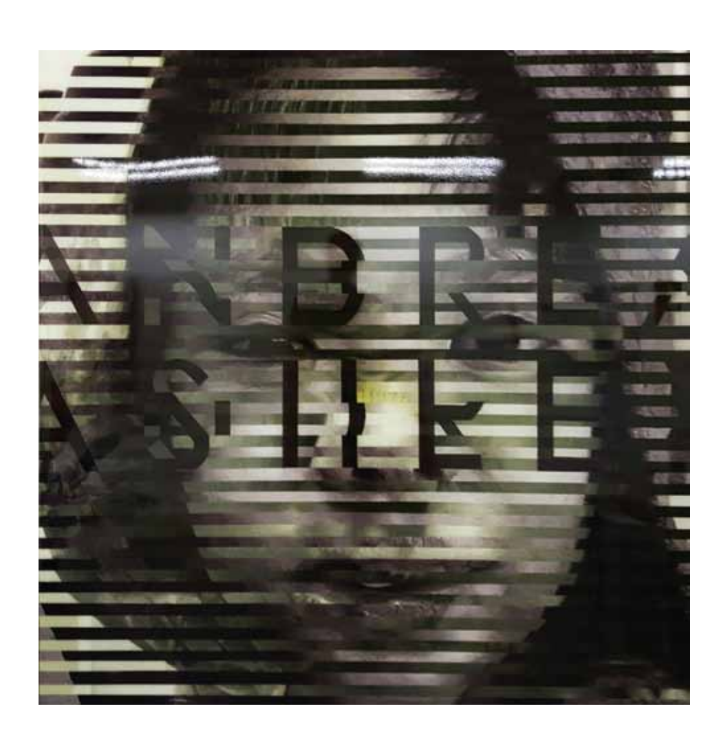
59 cuts 150 x 150 x 7.6cm Synthetic house paint and resin on canvas on board 2015