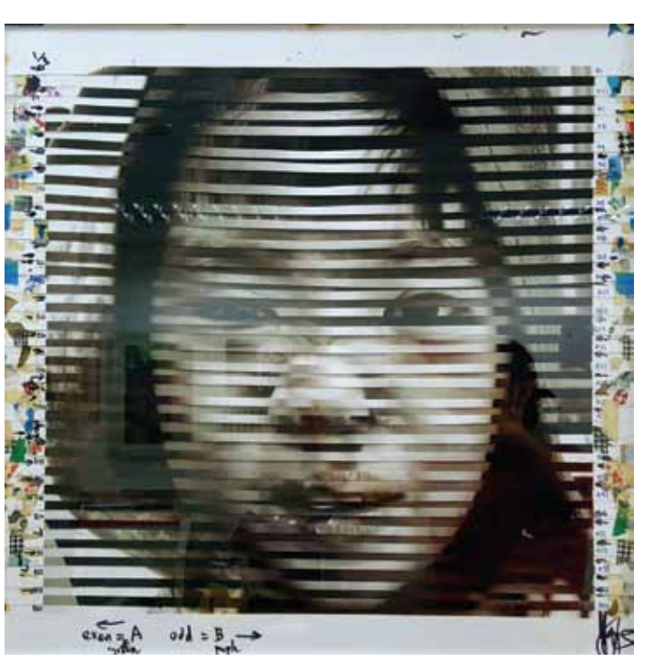
Patchwork of sibling rivalry 73.6 x 73.6 x 3.8cm Laminated print on matt paper, framed 2015

For full CV please visit http://weiling-gallery.com/wp-content/uploads/2016/02/lvan-Lam.pdf