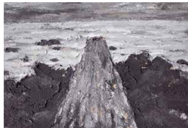
Untitled Acrylic and sand on canvas 30.5cm x 46cm 2000-2005