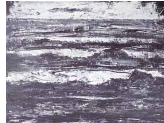
Untitled Acrylic on canvas 40cm x 60cm 2000-2005