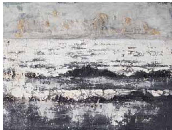
Untitled Oil and sand on canvas 46cm x 61cm 2000-2005