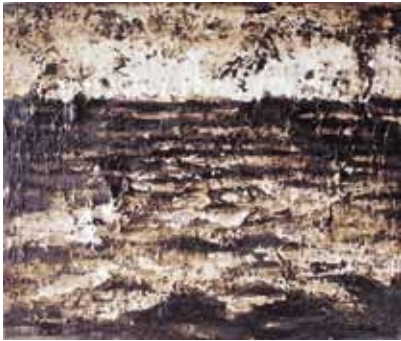
Untitled Acrylic and bitumen on canvas 28.5cm x 33.5cm 2000-2005