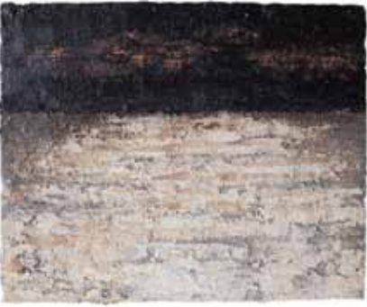
Untitled Acrylic, bitumen and sand on canvas 42cm x 51cm 2000-2005