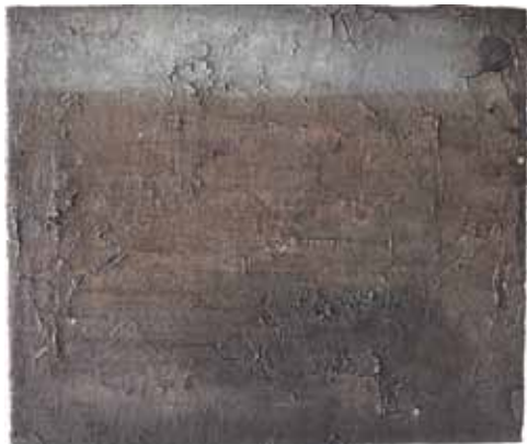
Untitled Oil, acrylic and sand on canvas 28.5cm x 33.5cm 2000-2005