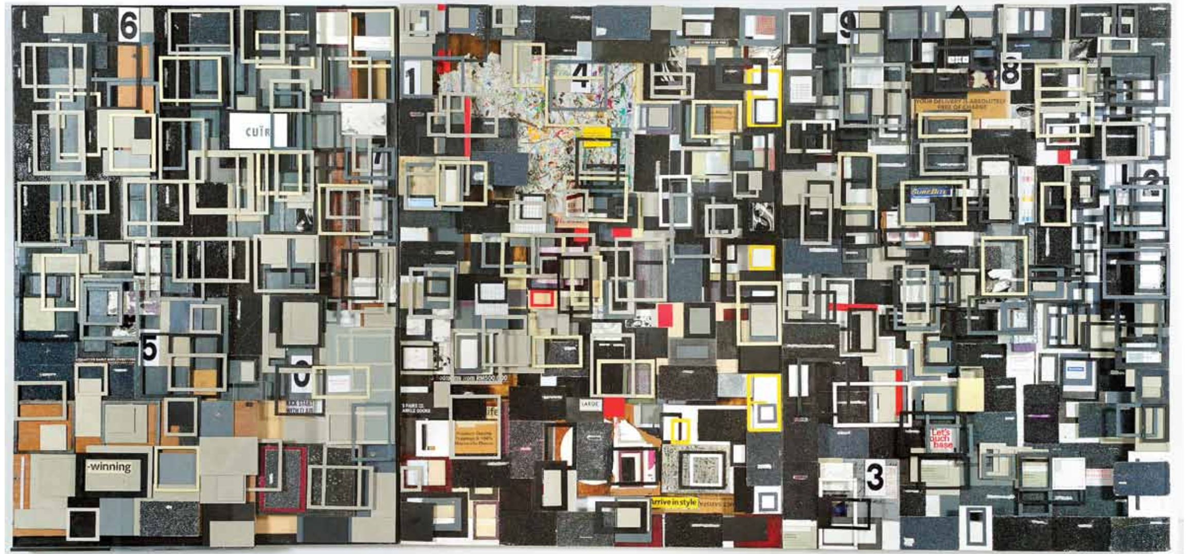
Bricolage of Identities - II Mixed media on wood panels 84.5cm x 177.5cm 2016