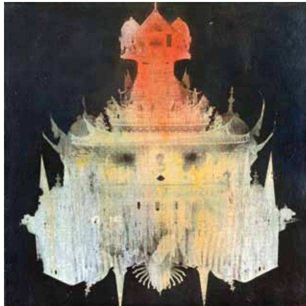
Untitled I Mixed Media on canvas 60cm x 60cm 2016