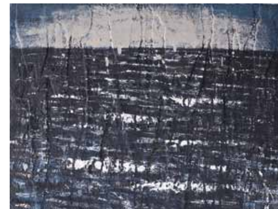
Untitled Acrylic and sand on canvas 46cm x 61cm 2000-2005