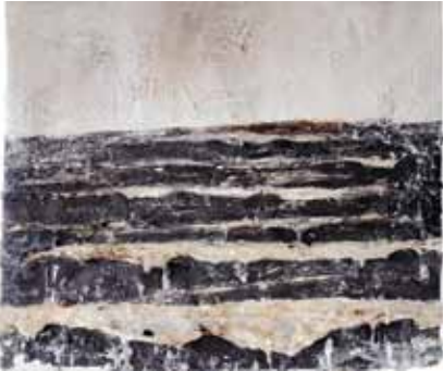
Untitled Acrylic and hot glue on canvas 28.5cm x 33.5cm 2000-2005