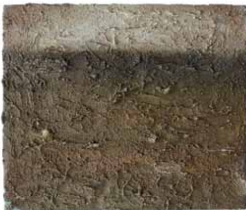
Untitled Oil and sand on canvas 28.5cm x 33.5cm 2000-2005