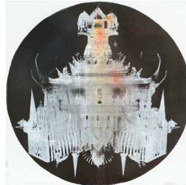
Untitled II Mixed Media on canvas 60cm x 60cm 2016