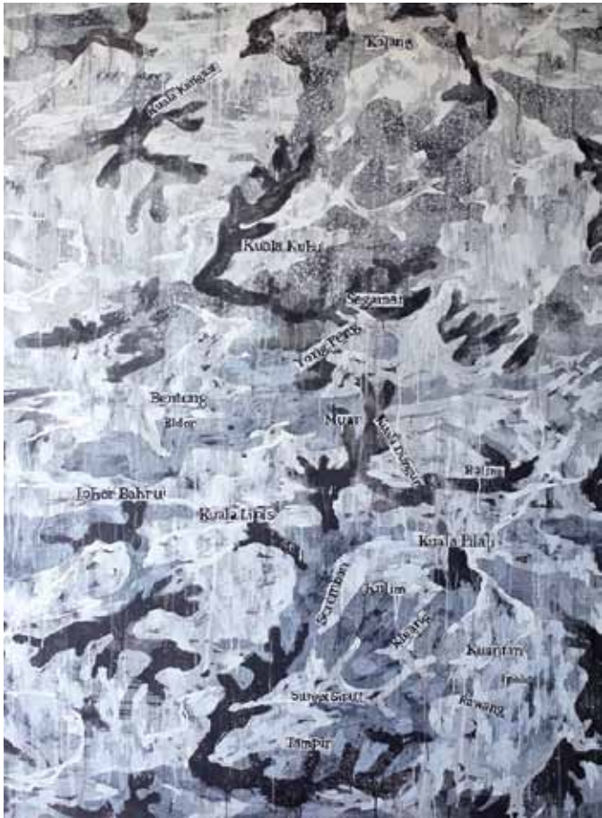
Invisible Word Acrylic and tape on canvas 163cm x 122cm 2016