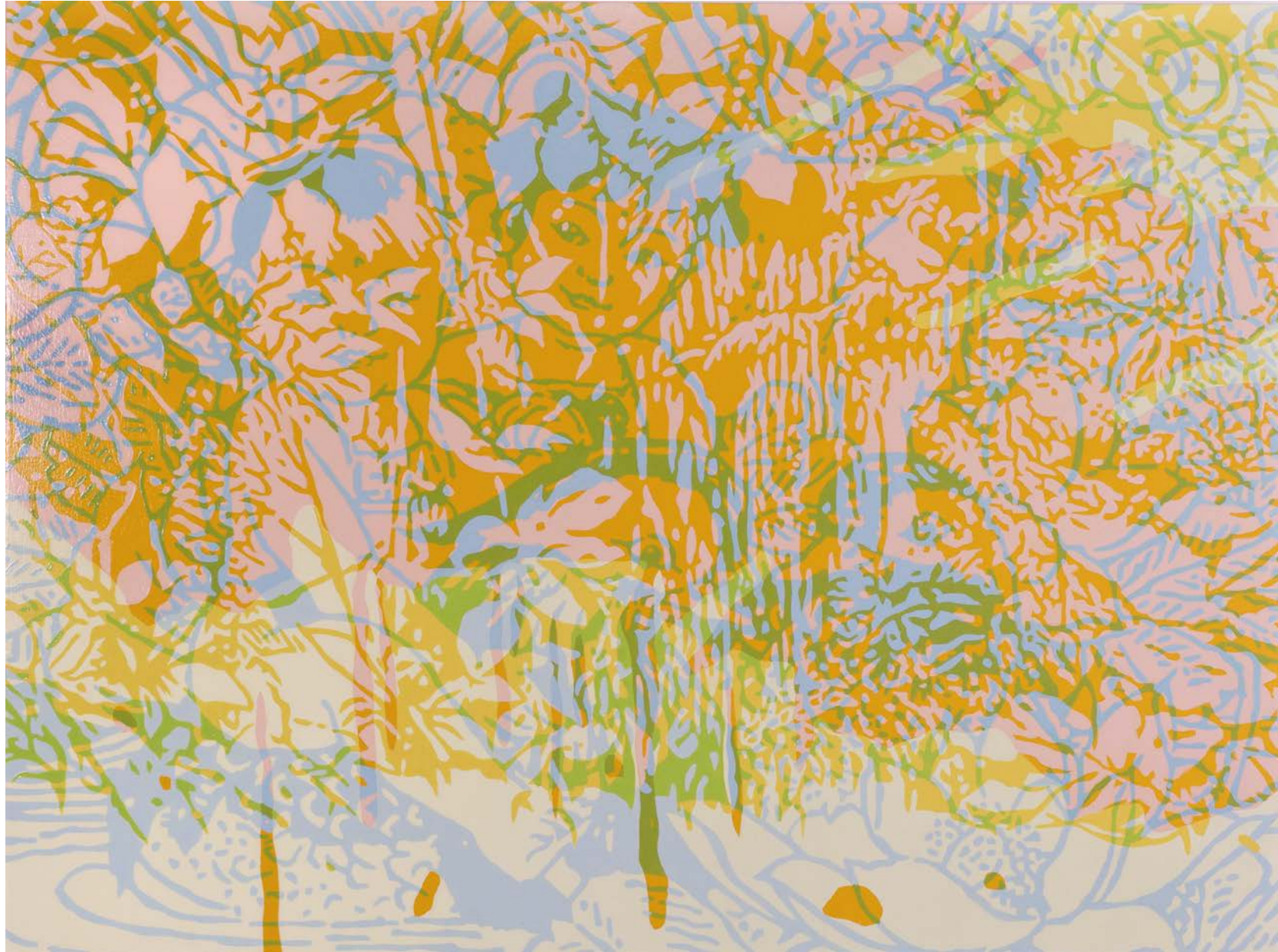
520 Happily Ever After (2020) | Acrylic on canvas; 91.5cm x 122cm

When pronounced in Chinese, 520 (wǔ'èrlíng) sounds similar to the phrase I love you (wǒ ài nǐ). Therefore, the number 520 became an online slang used by the Chinese as a shortcut to express love, similar to 'ILY' in English. This word then came to be associated with the date May 20th (5/20), which made it a meaningful day linked with love.