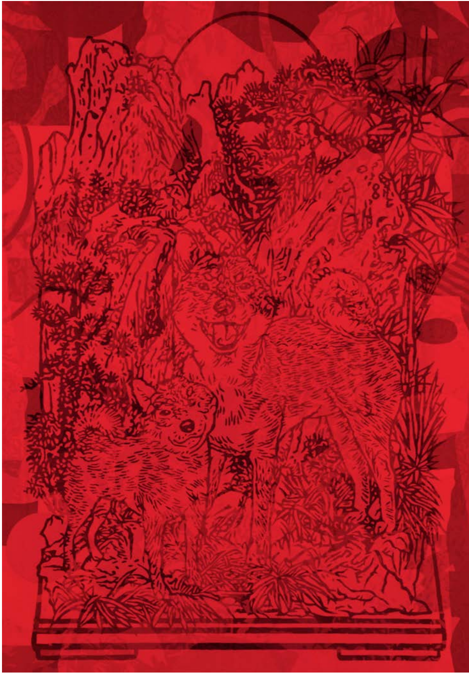
13 Safe and Sound (As seen through red lenses)