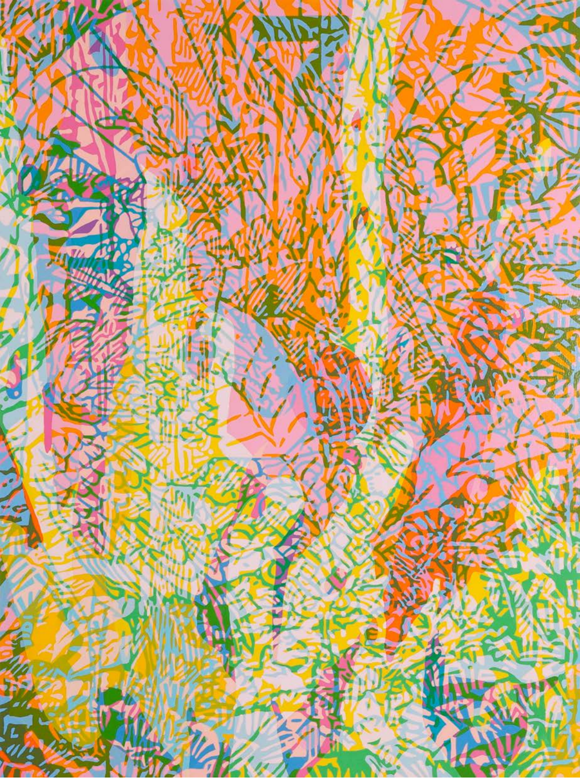
7 Rising Stars (2020) Acrylic on canvas 122cm x 91.5cm

‘7’ is known to be a lucky number in many cultures. In Chinese belief system, the number sounds like both (qǐ), which means “start” or “rise”, and also (qì), which means “vital energy”. The number also holds a special meaning for relationships and the Qixi Festival, falls on the 7th day of the 7th month of the lunar calendar. This day of love is based on an ancient folktale, a love story between the weaver girl and the cowherd. As their love was not allowed, they were to remain at opposite sides of the Silver River – however, on the 7th of July of every year, a flock of magpie birds would form a bridge to reunite the couple.