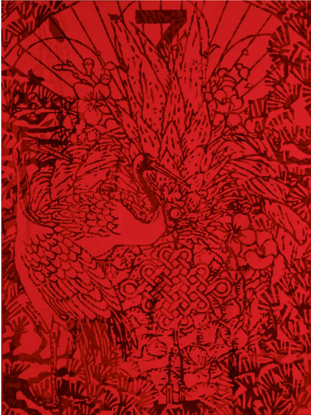
7 Rising Stars (As seen through red lenses)