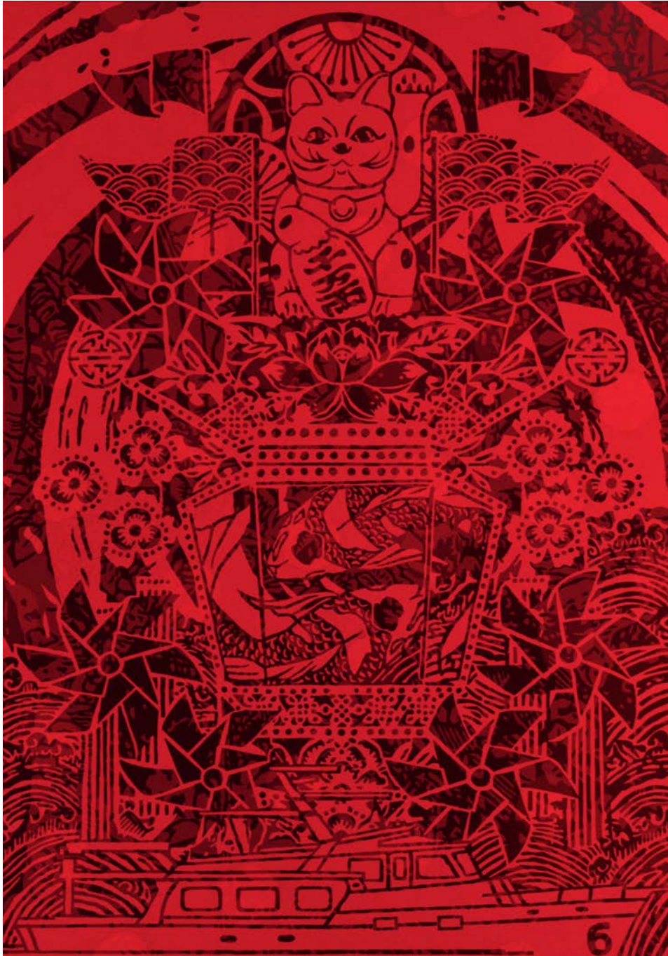
6 May You Have a Smooth Sailing (As seen through red lenses)