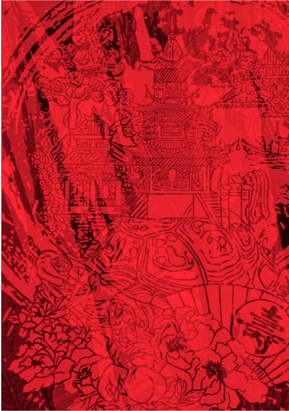
19 Eastern Sea, Southern Mountain (As seen through red lenses)