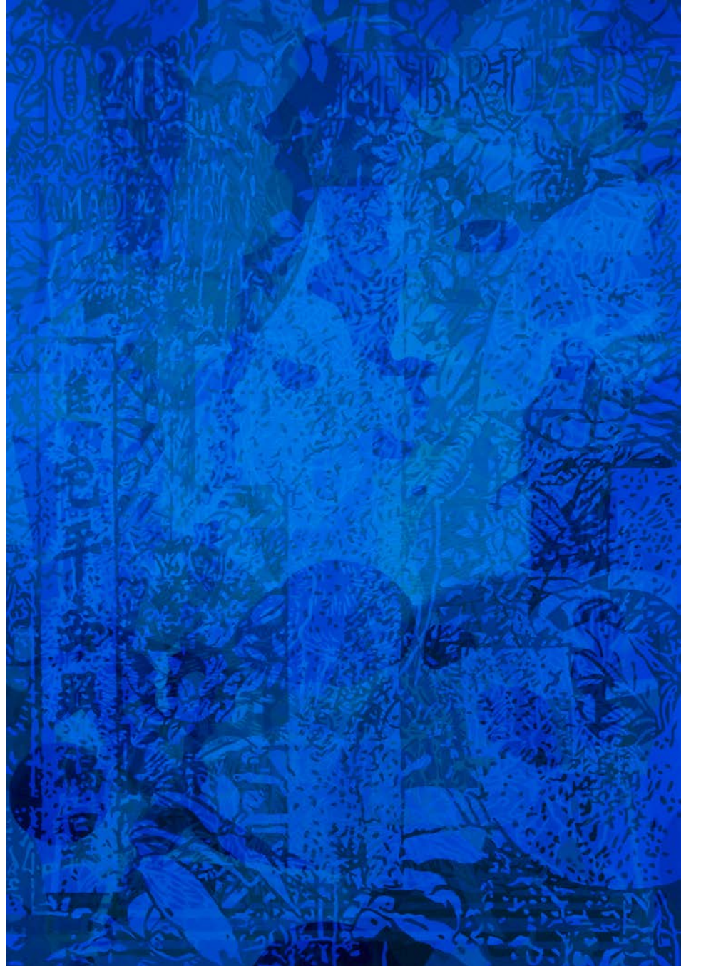
13 Safe and Sound (As seen through blue lenses)