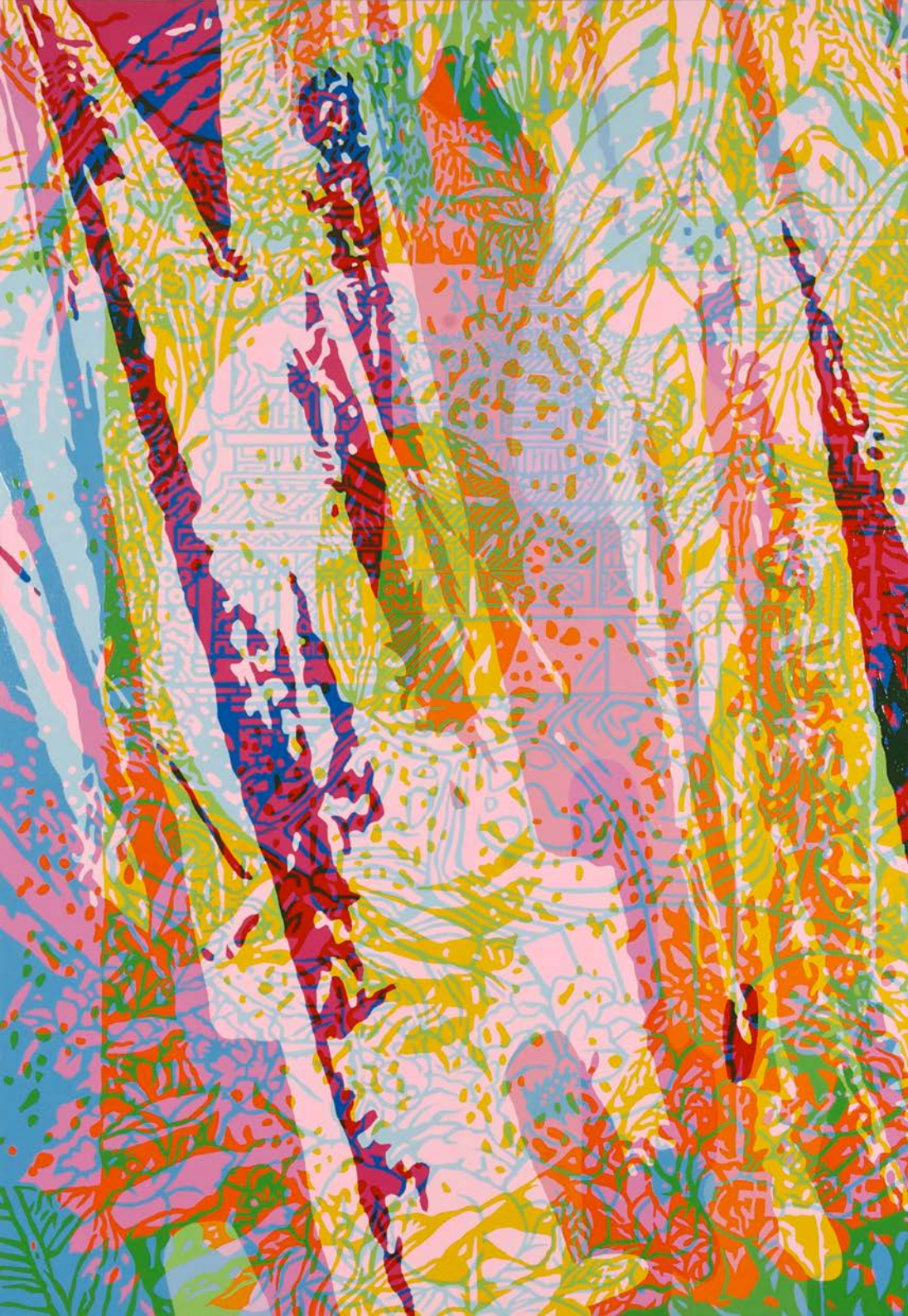
19 Eastern Sea, Southern Mountain (2020) Acrylic on canvas 152.5cm x 107.5cm

There is a custom in traditional Chinese culture of wishing a person “happiness as immense as the Eastern sea, and longevity as long as the Southern mountain,” usually on one’s birthday. This saying inspired the title of this piece, as the artist highlights the hope for a long and joyful life. The idea of a long life is also symbolised through an illustration of a turtle, considered as a sacred creature that holds mythical power, also known for its patience and wisdom. Next to it is placed a Chinese pagoda, a holy place that marks faith and hope.