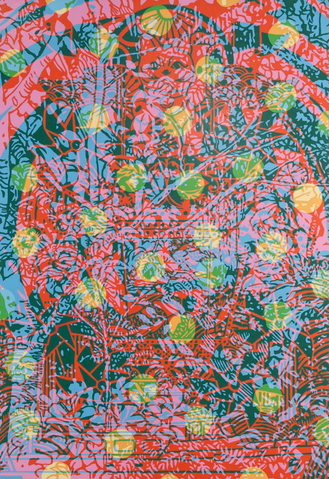
6 May You Have a Smooth Sailing (2020) Acrylic on canvas 152.5cm x 107.5cm

The ‘Maneki-Neko’ is a common Japanese figurine of a cat which is also popular in Chinese culture nowadays, believed to bring good luck to the owner. The cat has a paw raised with constant beckoning gesture, allowing the flow of good fortune. Luck and prosperity are also represented here by falling golden coins and spinning pinwheels. In traditional Chinese culture, the pinwheel is believed “to turn one’s luck around”, and is therefore used commonly to welcome a new year or chapter.