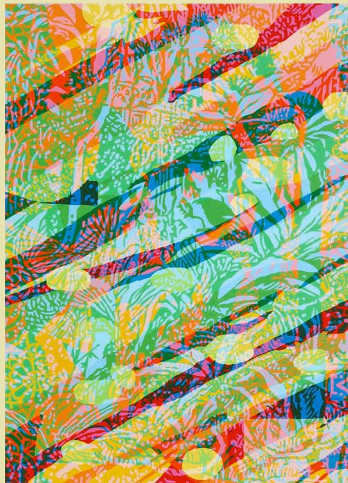
Good Days Will Come Wong Chee Meng