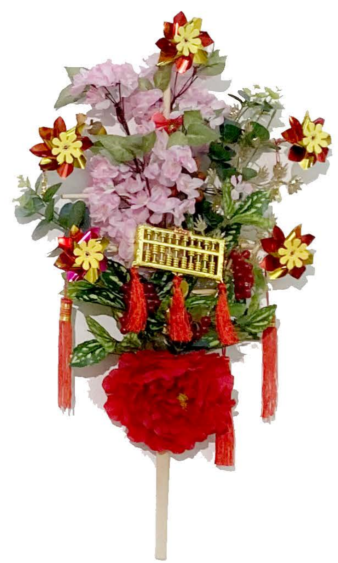
5 Lucky Connections (2020) | Mixed media; Dimension variable