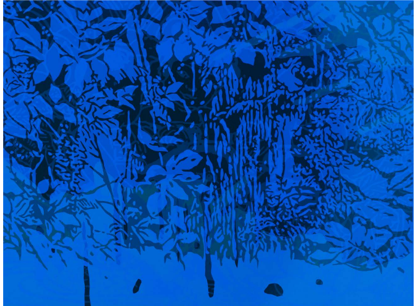
520 Happily Ever After (As seen through blue lenses)