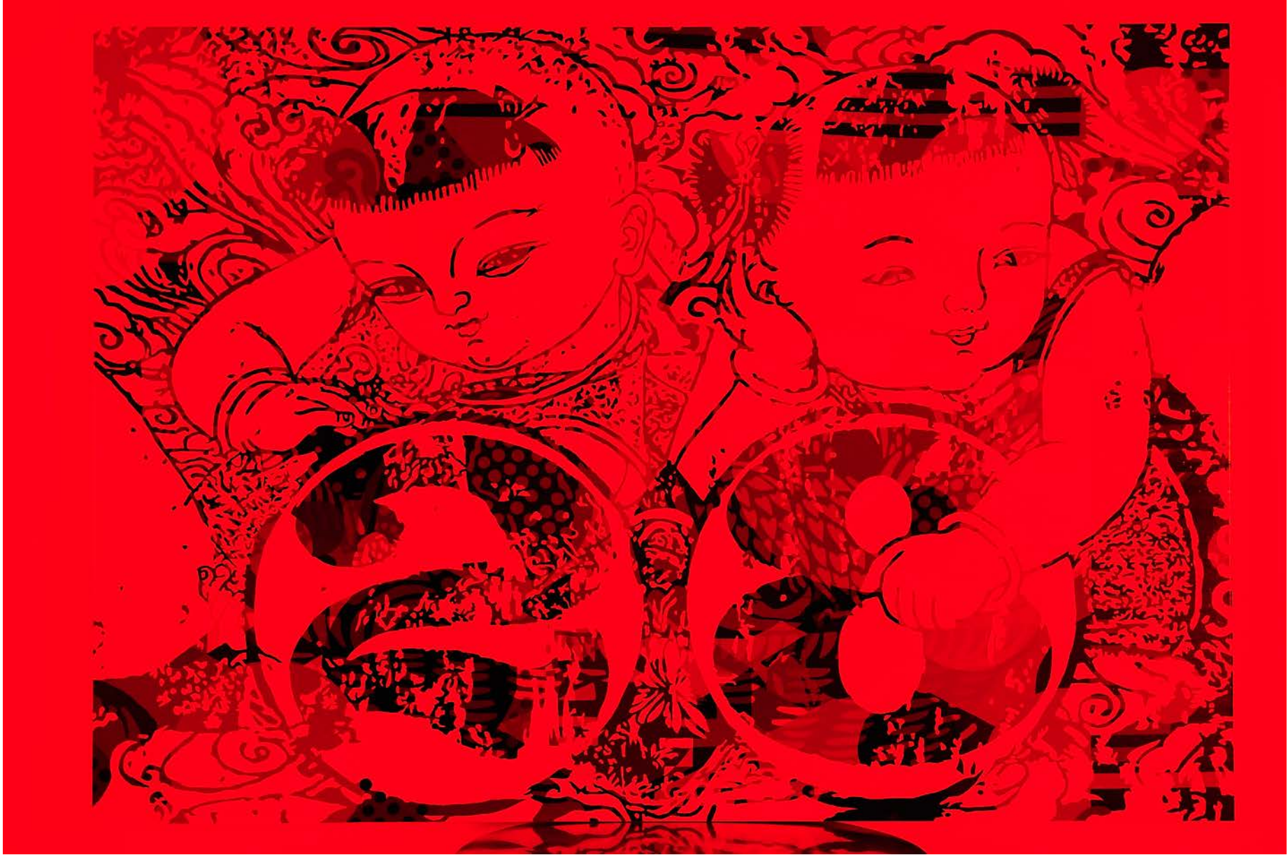
The Yearning Realm (As seen through red lenses)