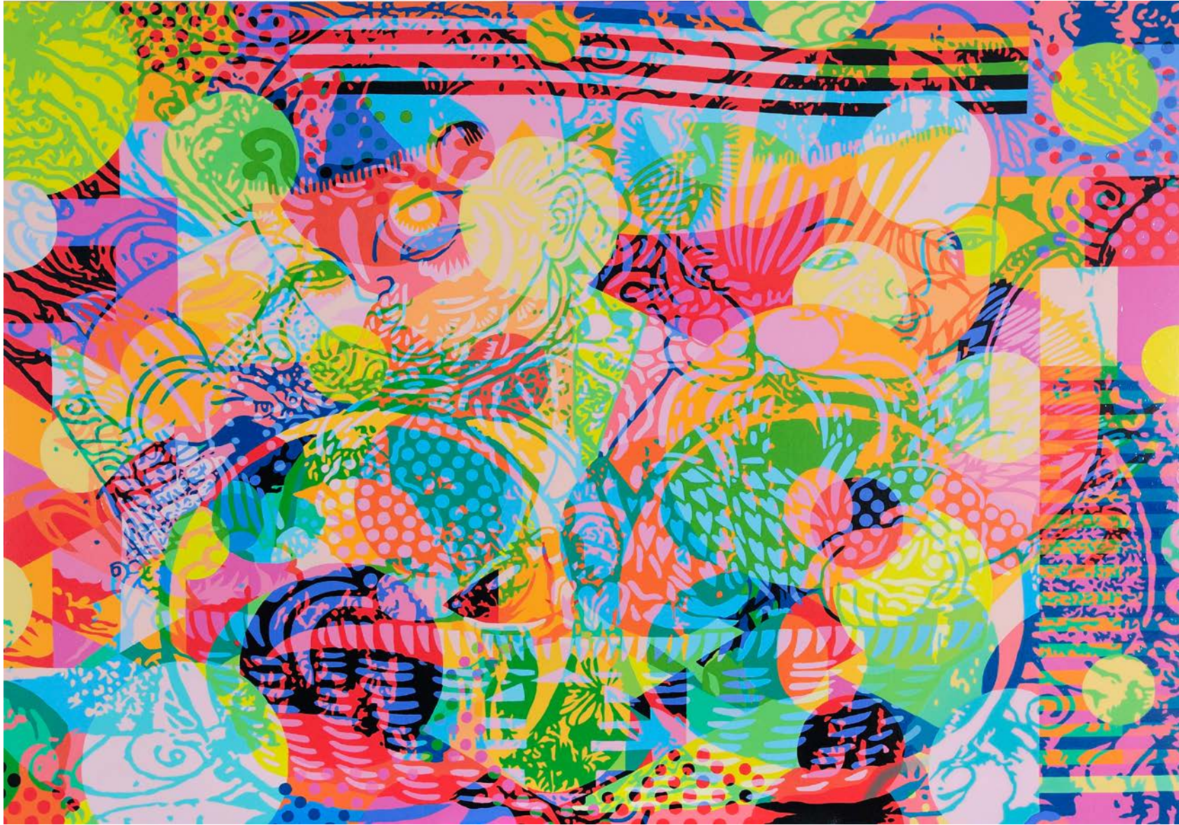
The Yearning Realm (2019) | Acrylic on canvas; 107.5cm x 152.5cm

This painting is the first of the series and offers mainly two images and a pair of numbers. The first shows a pair of siblings as symbols of love. The saying ‘family is life’ is a concept that holds true in Chinese culture. In fact, several Confucian thoughts are based around the family. Children are highly valued within a family structure, and I considered as a good luck. The second image is a basket of fish, fruits, vegetables and paddy, representing a healthy and prosperous life.