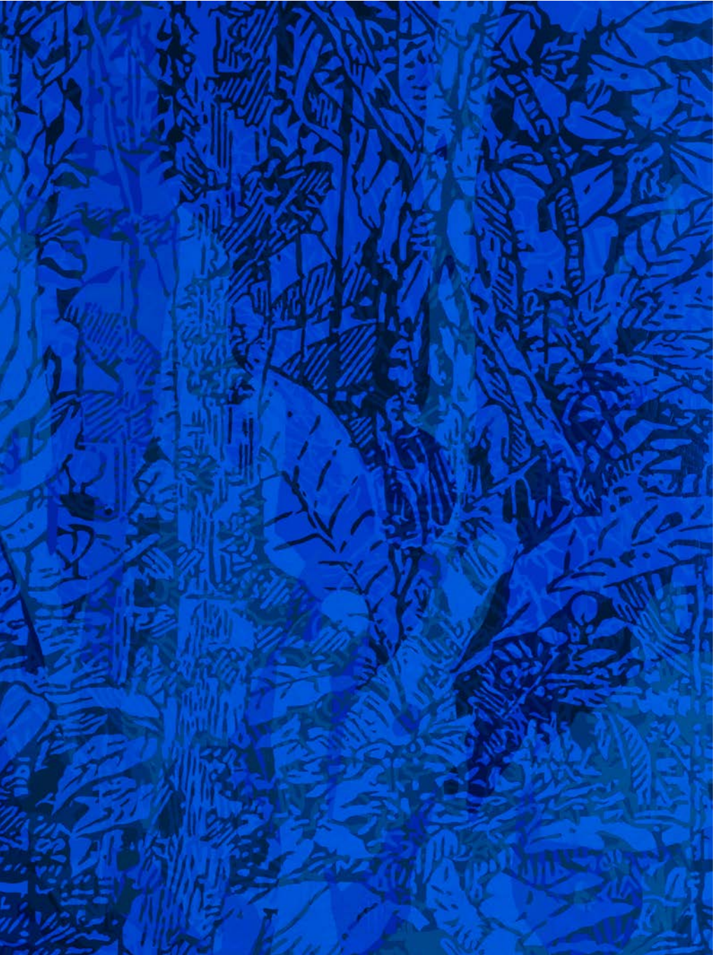
7 Rising Stars (As seen through blue lenses)