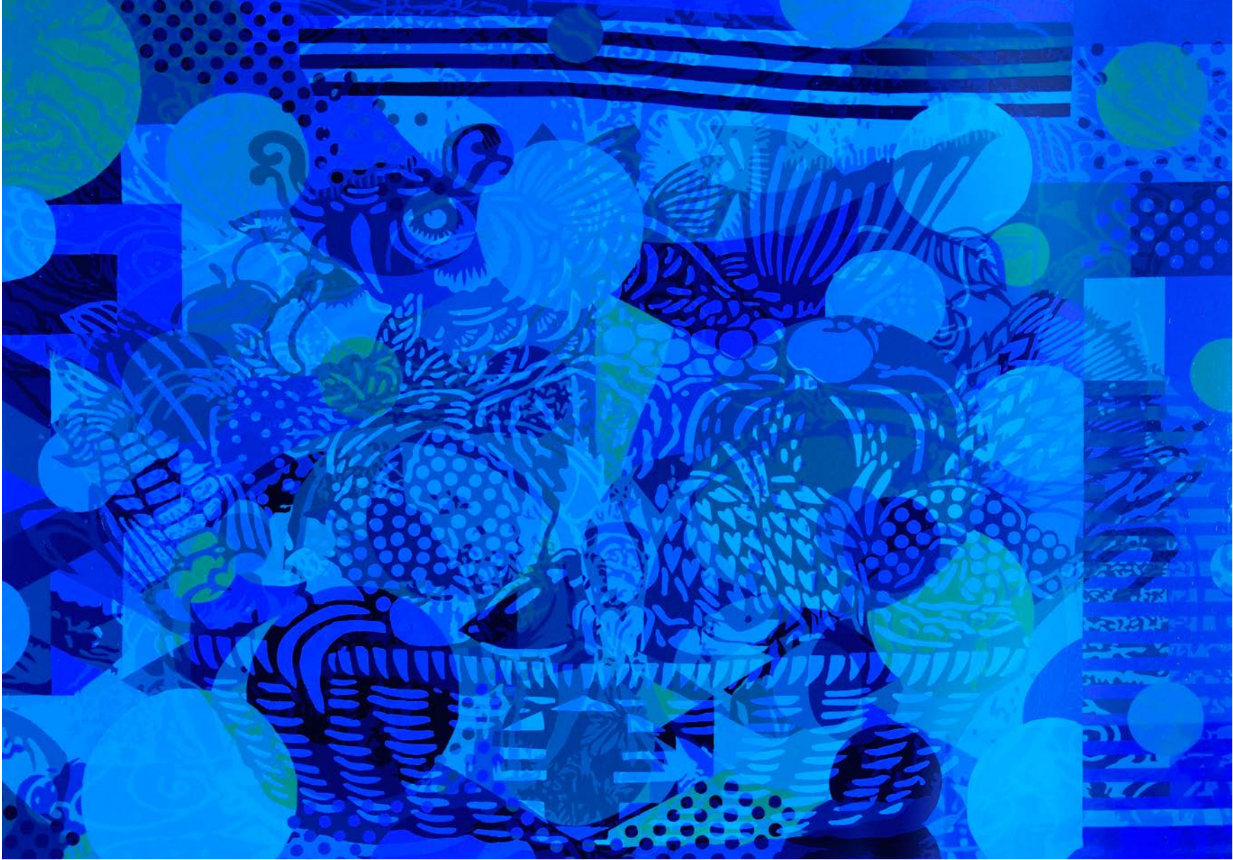
The Yearning Realm (As seen through blue lenses)