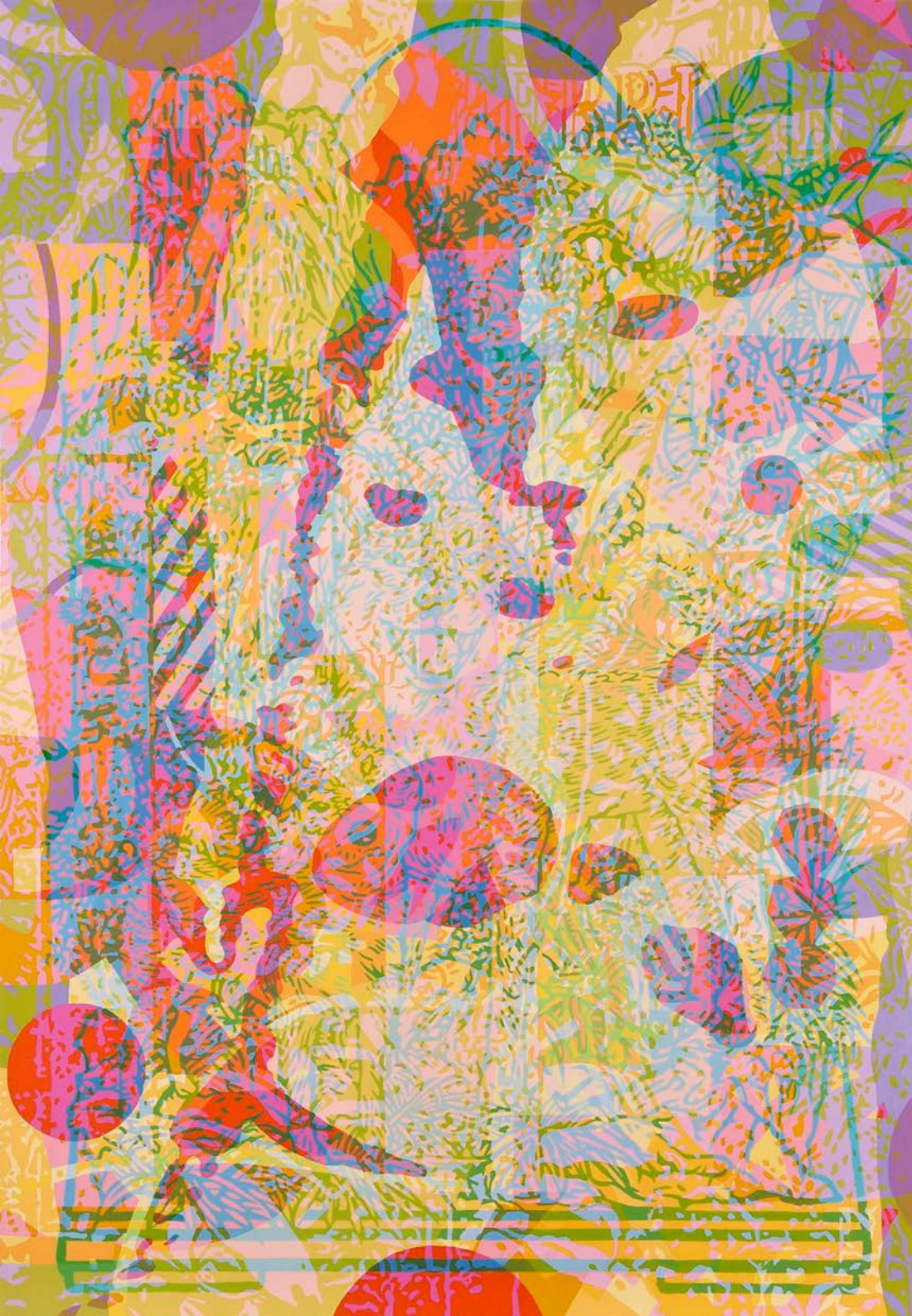
13 Safe and Sound (2020) Acrylic on canvas 152.5cm x 107.5cm

To the artist, hope itself is a mysterious thing. It is similar to faith in the sense that it acts as a visualization of what we truly believe, yet at the same time being intangible. Hope blurs imagination and reality, as it refers to a conception that may or may not materialize in the way we foresee it. As a human being, we tend to invest our thought, time, and energy in what we have confidence in, although fate might suggest otherwise, and lead us onto a different path altogether. Regardless of its ambiguity, hope allows us to feel a sense of persistence and contentment in moving forward. A reason to fight.