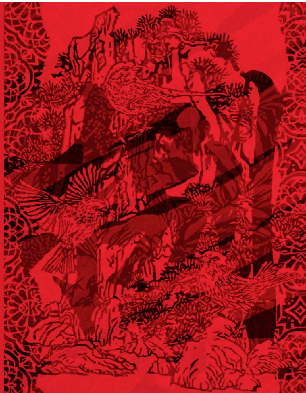
168 Prosperous Landscape (As seen through red lenses)