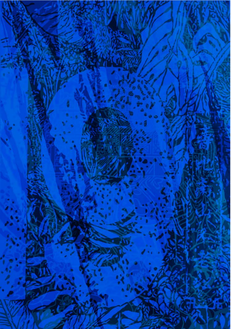
19 Eastern Sea, Southern Mountain (As seen through blue lenses)