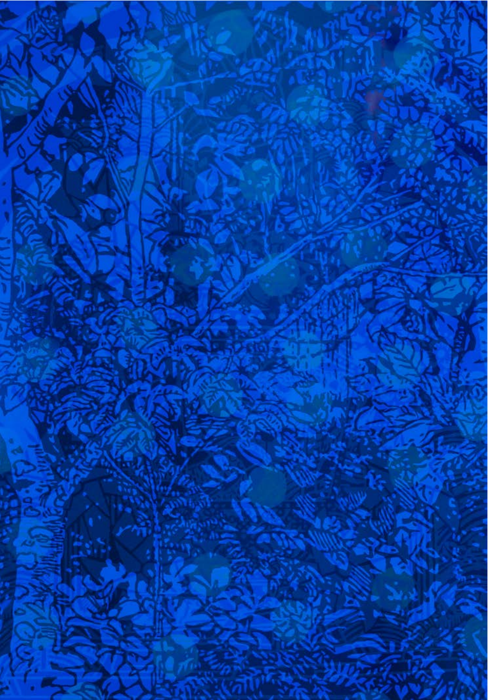
6 May You Have a Smooth Sailing (As seen through blue lenses)