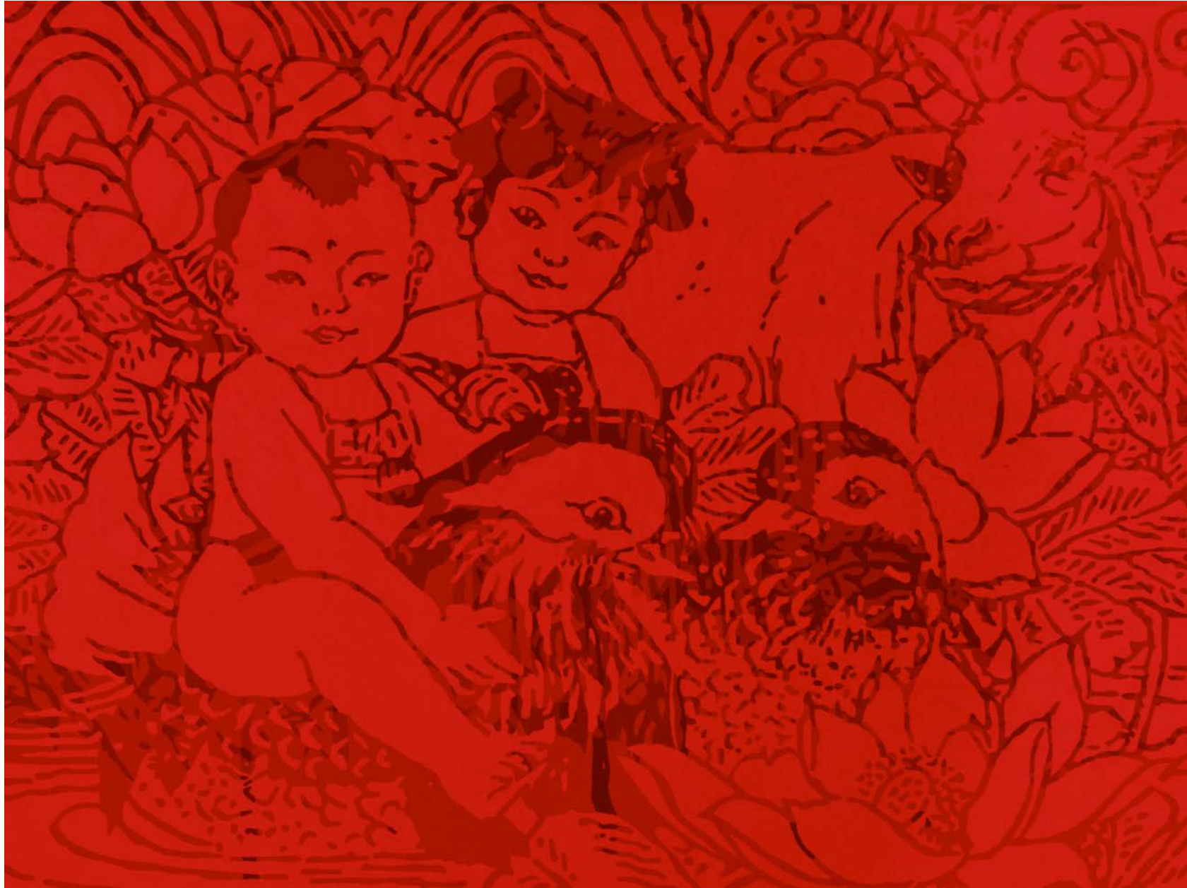
520 Happily Ever After (As seen through red lenses)