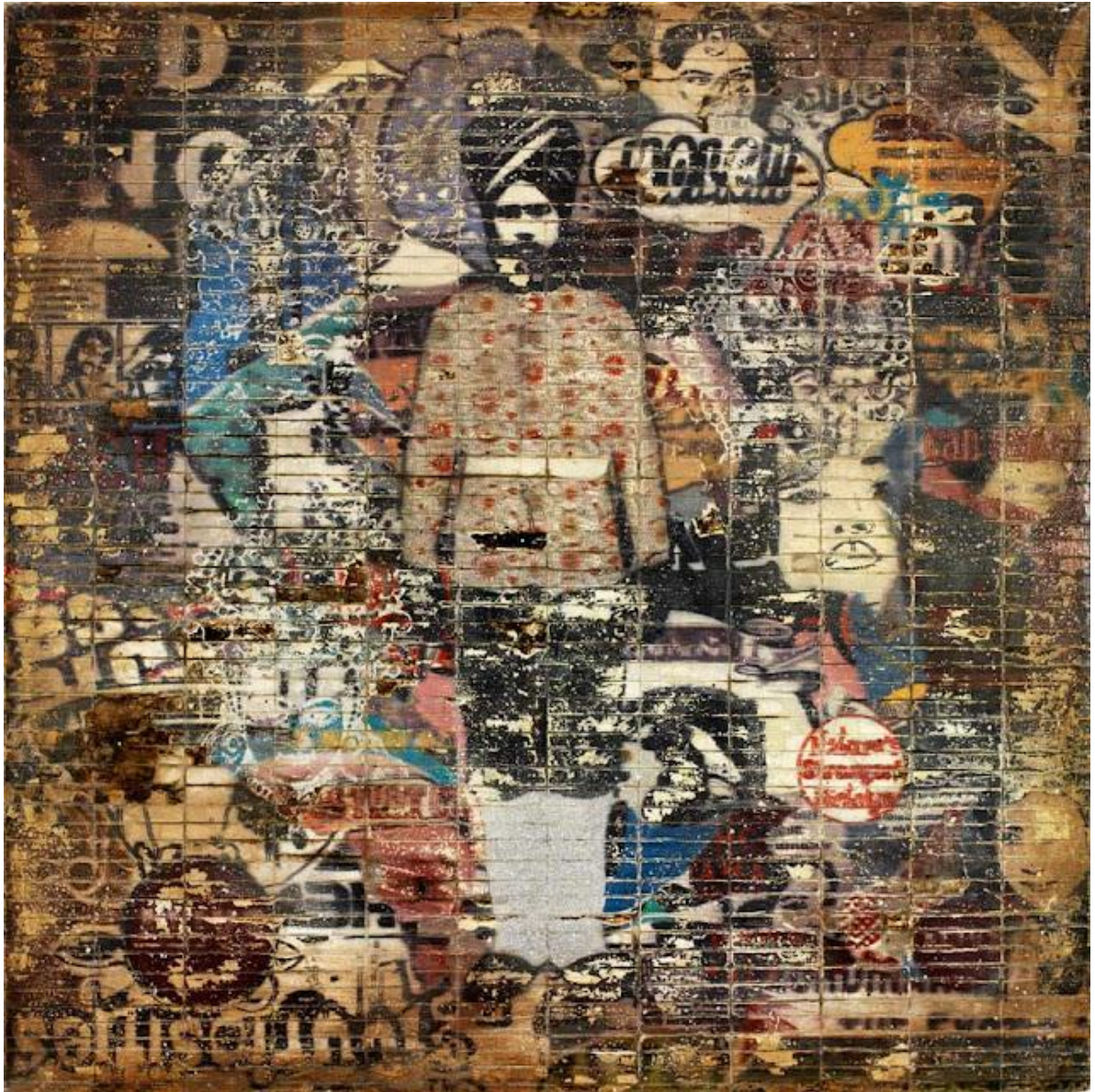
Rajinder Singh Inimitable Southall Bitumen, acrylic paint, oil paint, varnish on unprimed canvas 120cm x 120cm 2011

Exhibition: Mixed hanging of works by represented artists Group Show April – May 2014 WEI-LING CONTEMPORARY