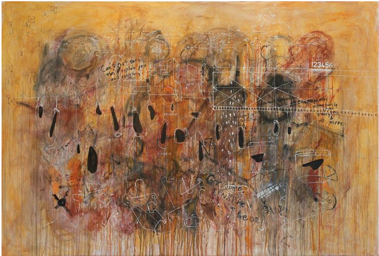
Rajinder Singh A Weighted State Mixed Media on Canvas 213cm x 150cm 2006