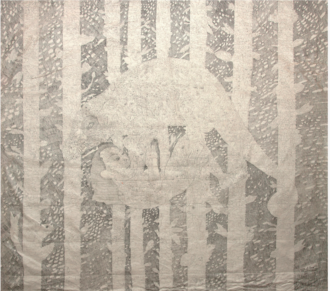
You and me Ink on canvas 158cm x 178cm 2023

"In this arrangement, there is a sense of interconnectedness, where you and I are not separate but rather two parts of a greater whole. Like a drop of water in the ocean, we are small yet significant. Each individual is like a universe, experiencing both independence and a connection to the world around us."