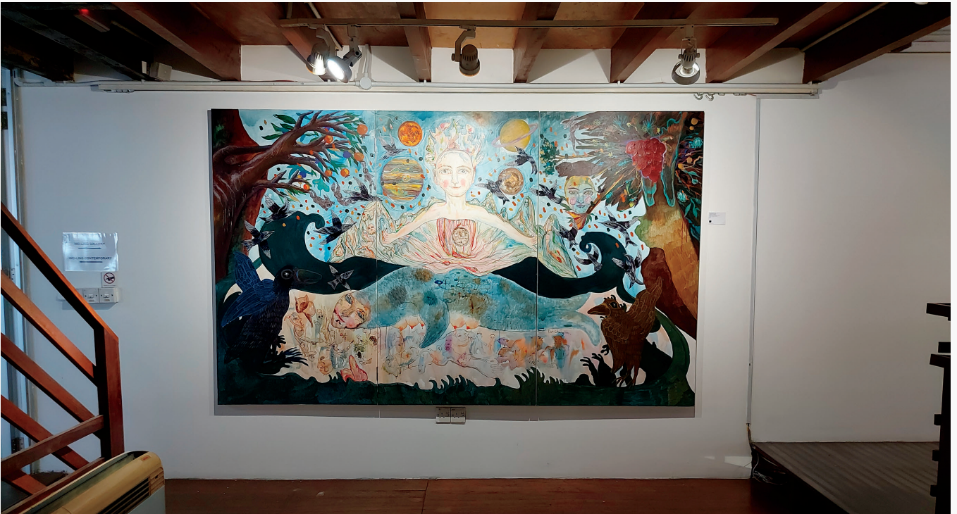
Creator and caregiver (Insitu for scale)