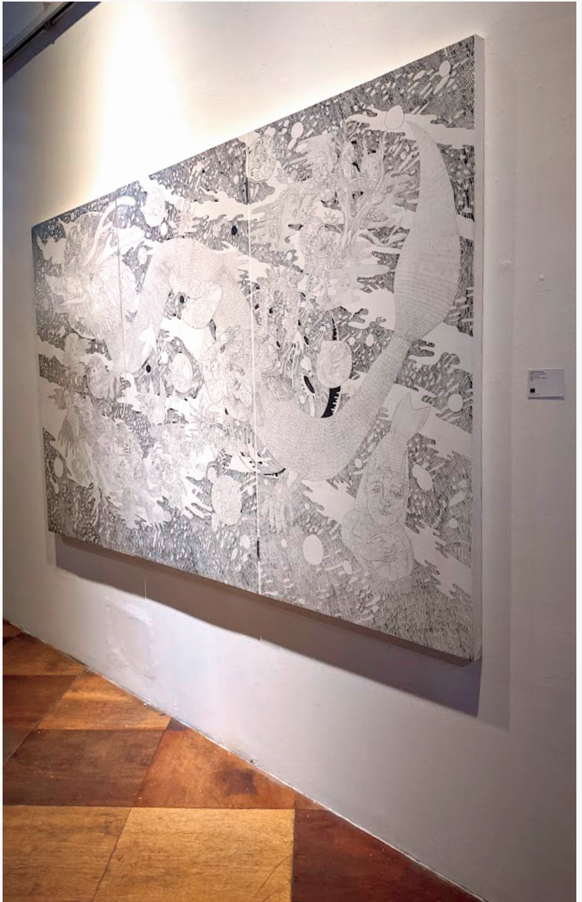
Reunion. Come together (Insitu for scale)