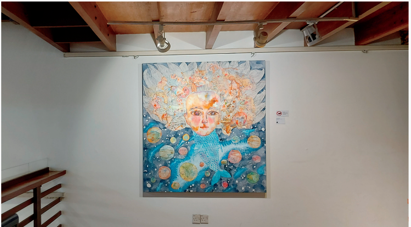
Cosmic wanderings (Insitu for scale)