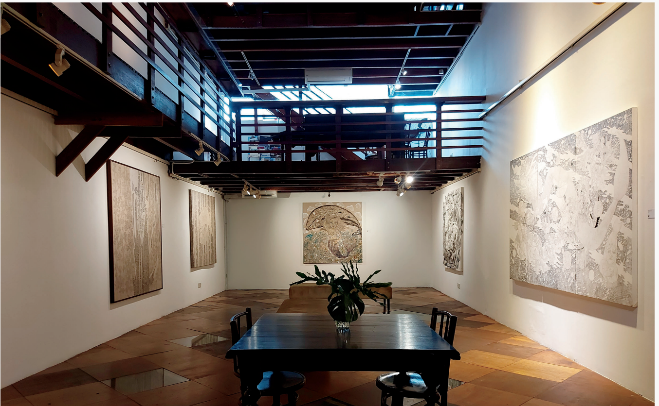
Installation view at Wei-Ling Gallery, Brickfields