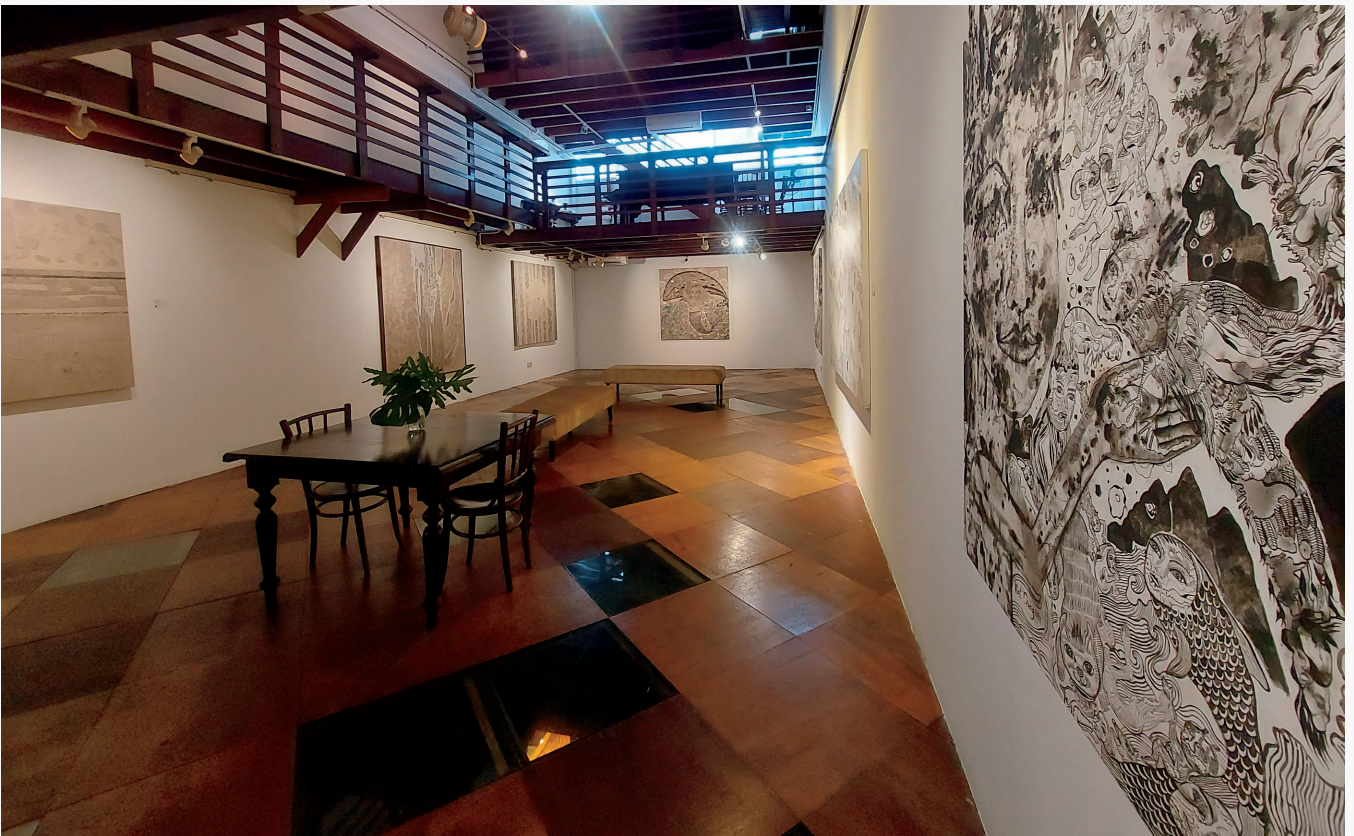
Installation view at Wei-Ling Gallery, Brickfields