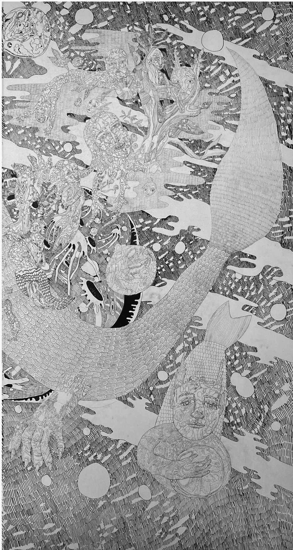
Reunion. Come together (Right Panel)