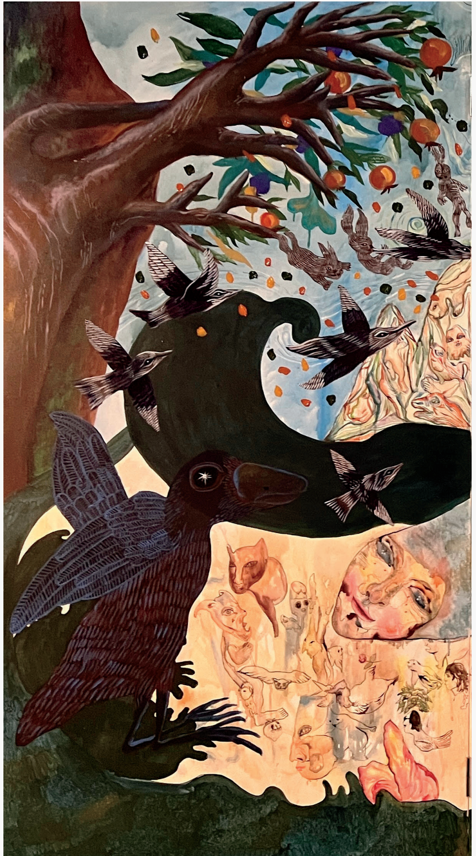
Creator and caregiver (Left Panel)