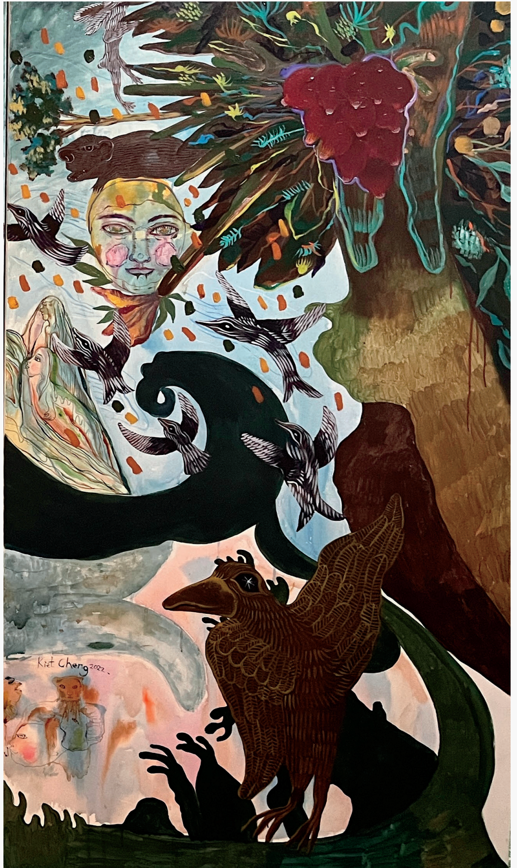
Creator and caregiver (Right Panel)