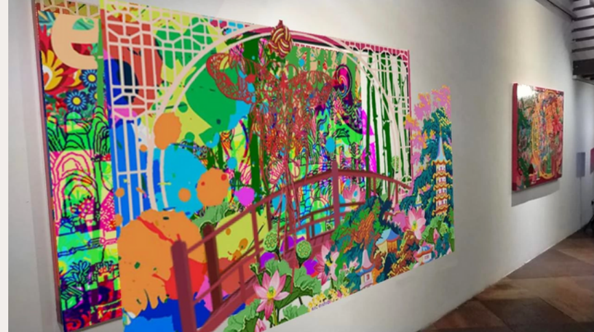
Love Song | Acrylic On Canvas; 122cm x 183cm 2023 (With AR filter)