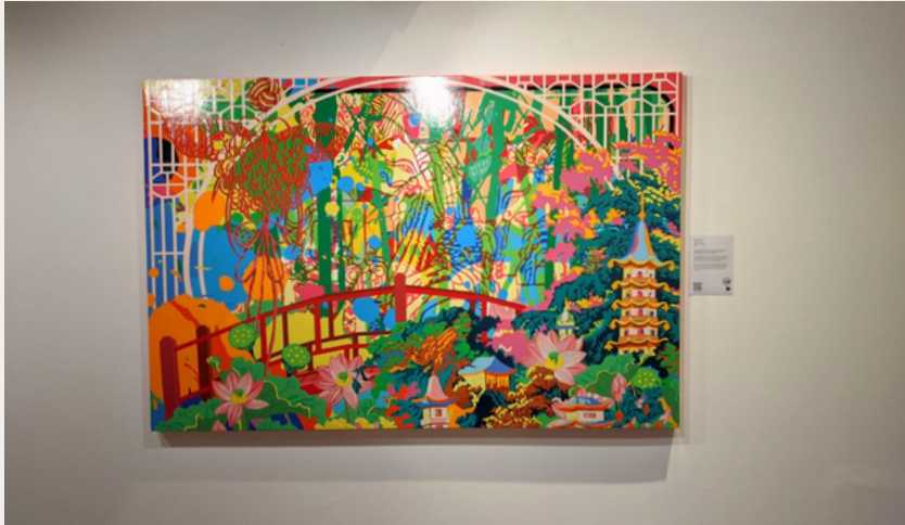
Love Song | Acrylic On Canvas; 122cm x 183cm 2023