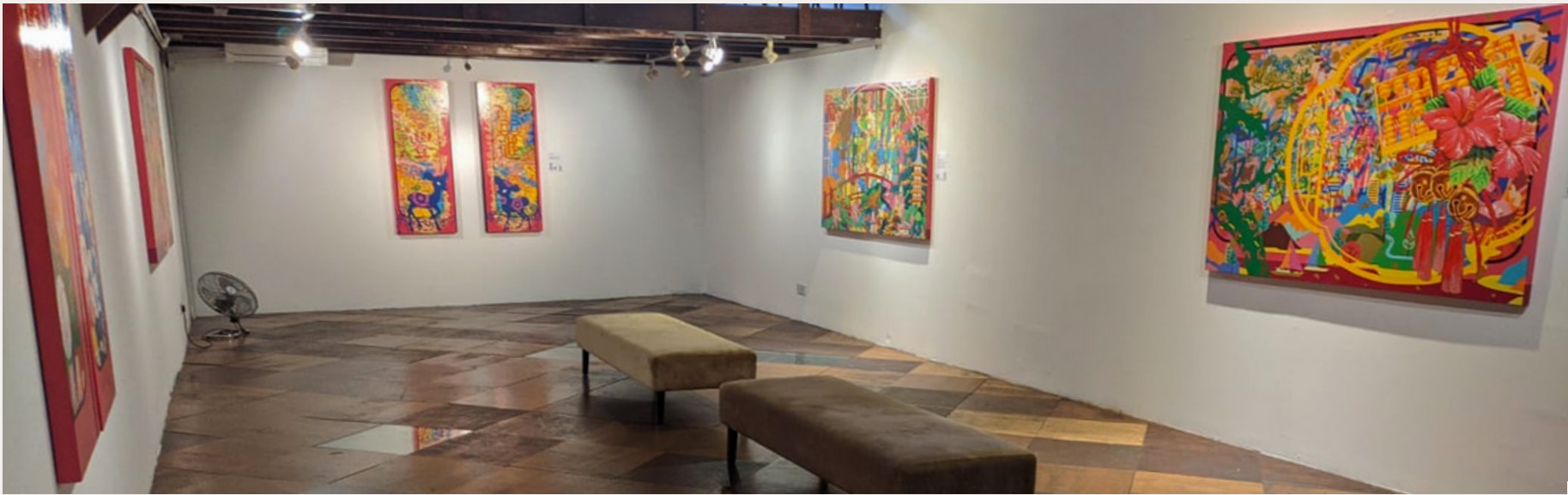
Installation view in Wei-Ling Gallery (2023)