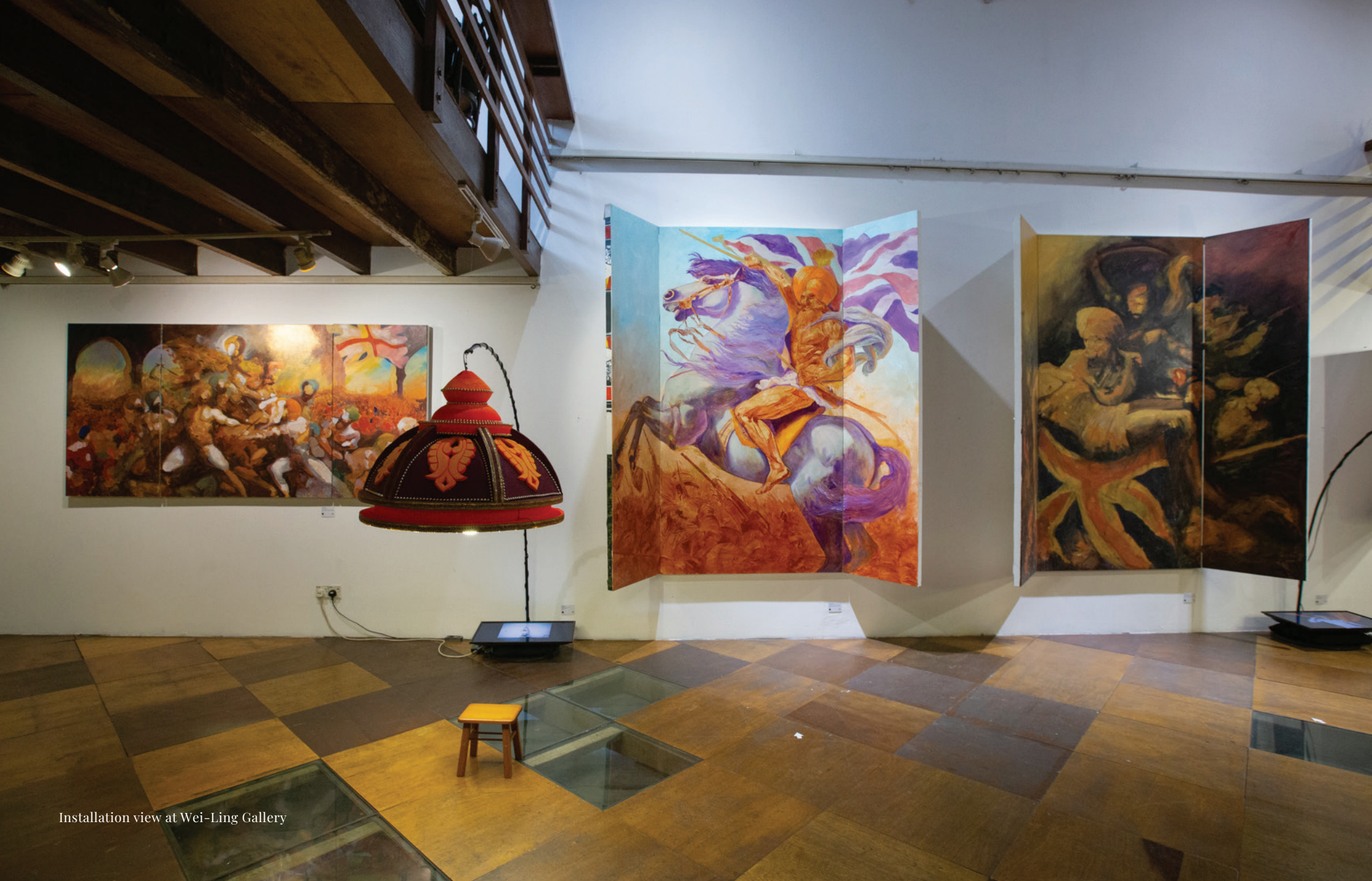
Installation view at Wei-Ling Gallery