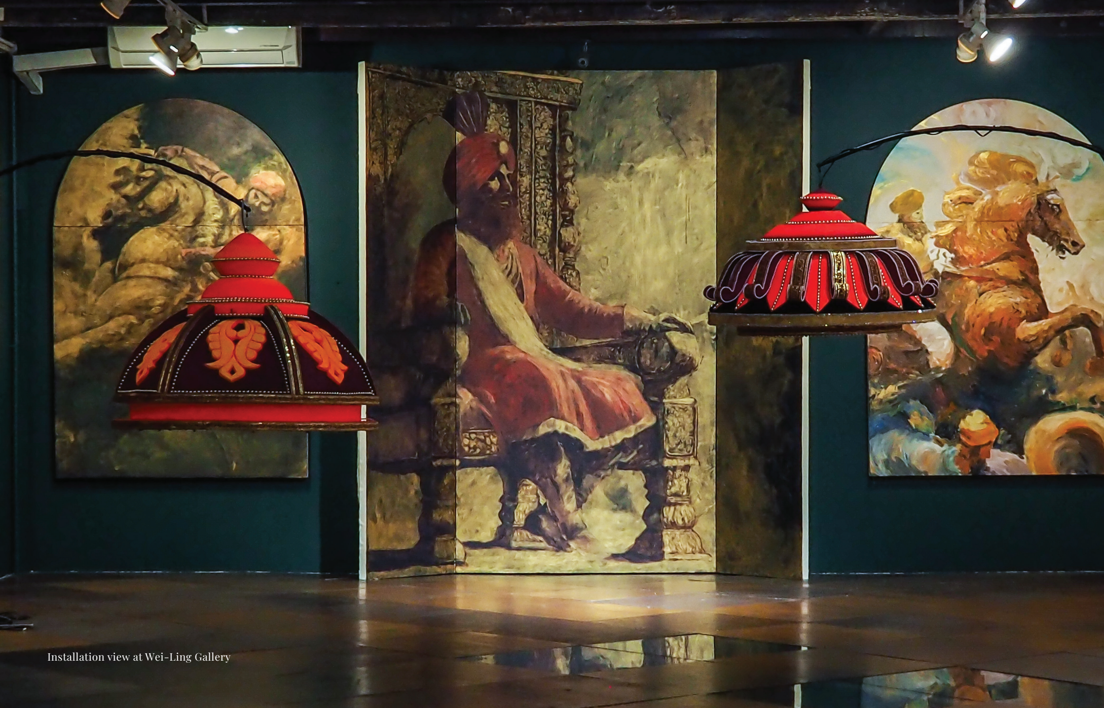
Installation view at Wei-Ling Gallery