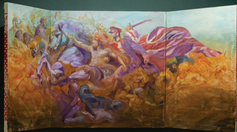
Installation view at Wei-Ling Gallery