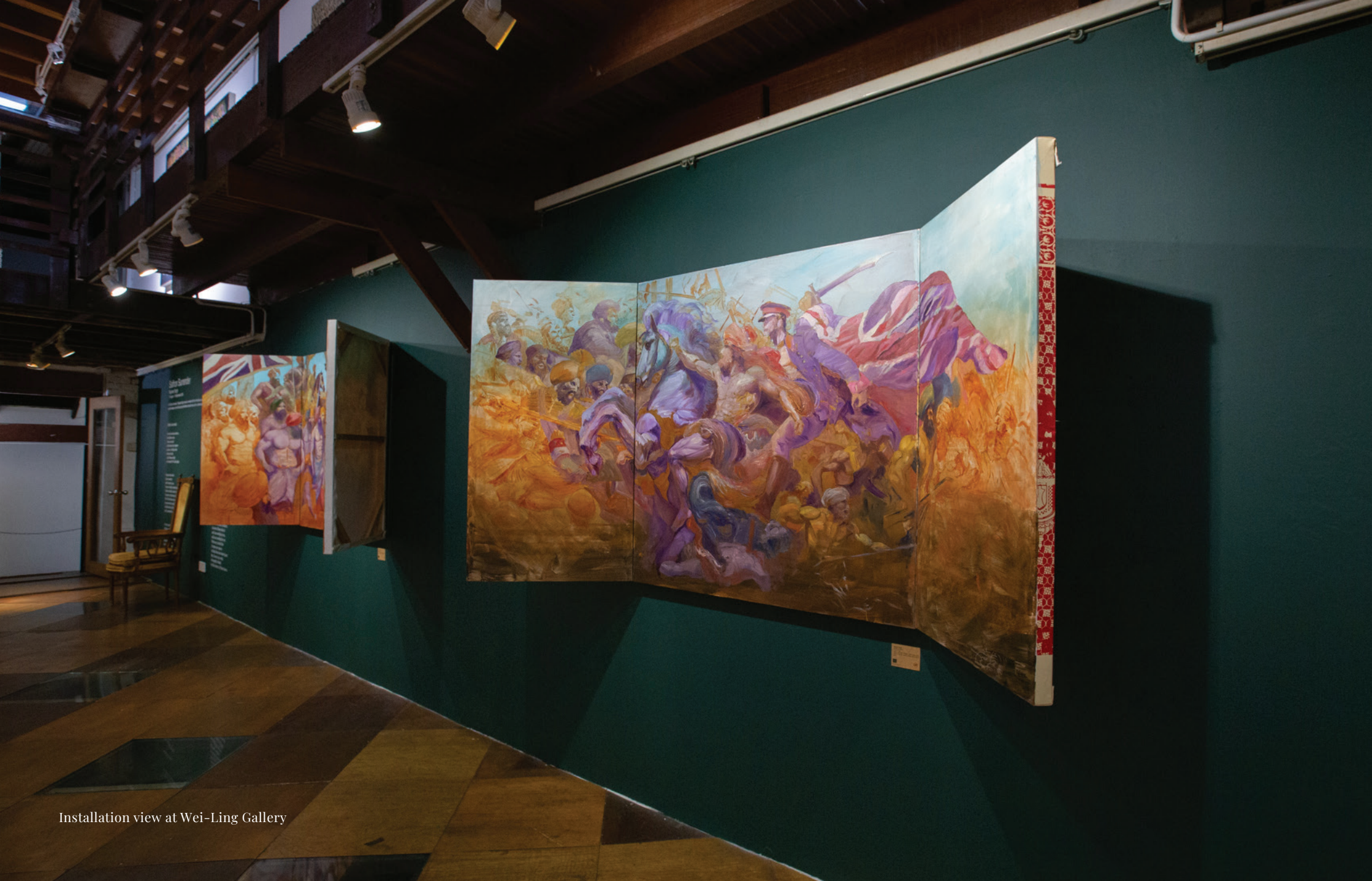
Installation view at Wei-Ling Gallery