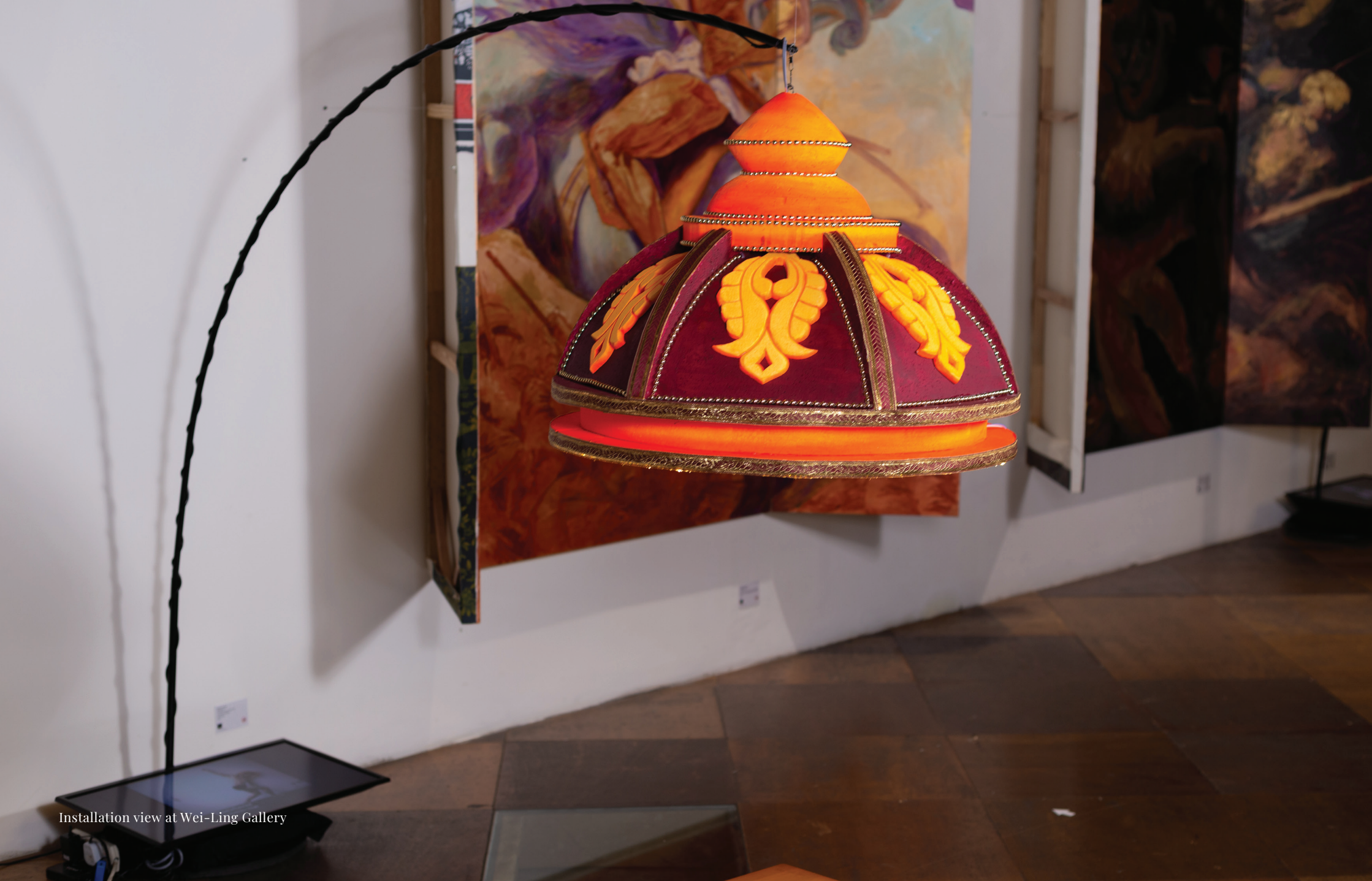
Installation view at Wei-Ling Gallery