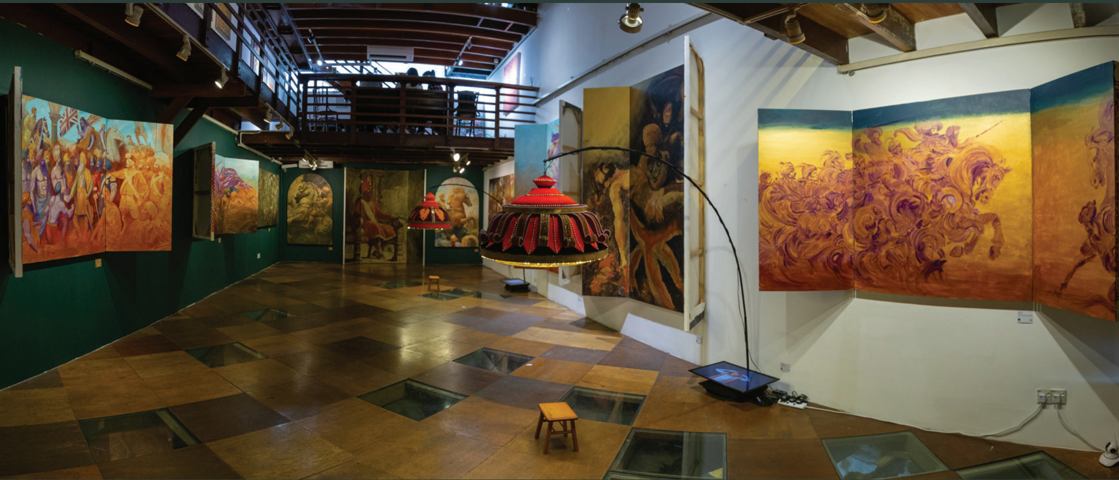
Installation view at Wei-Ling Gallery