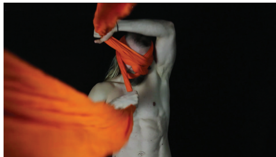
Knot (video still image)

HD Single channel video with sculptural installation