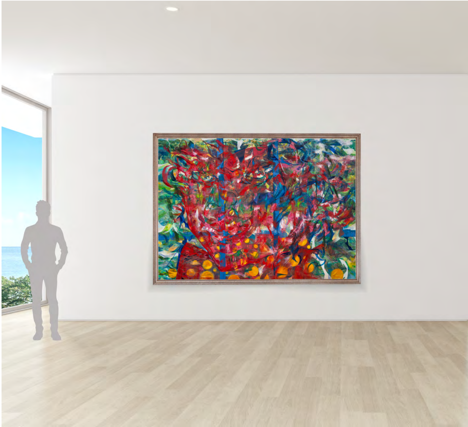
In situ for scale