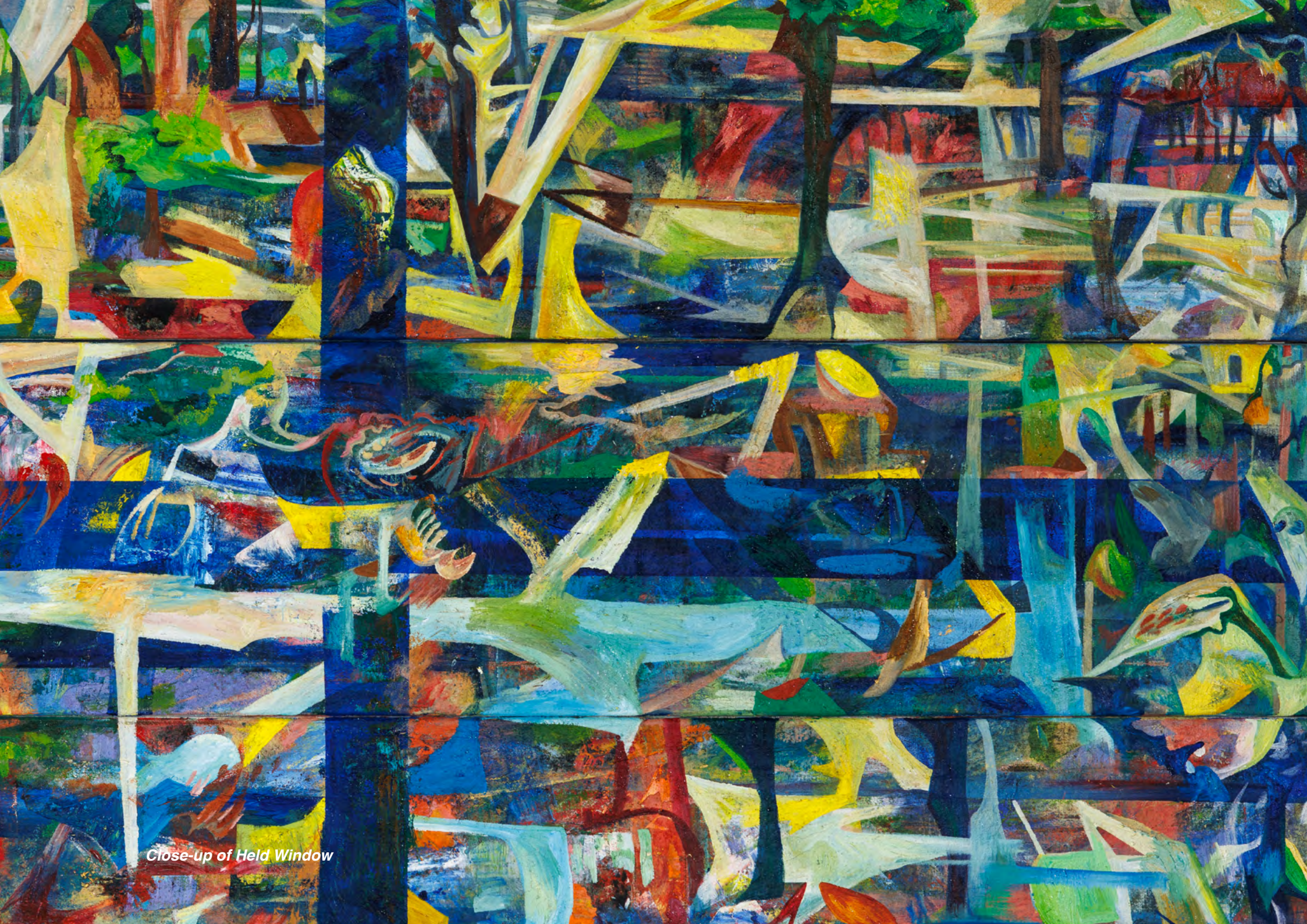
Close-up of Held Window