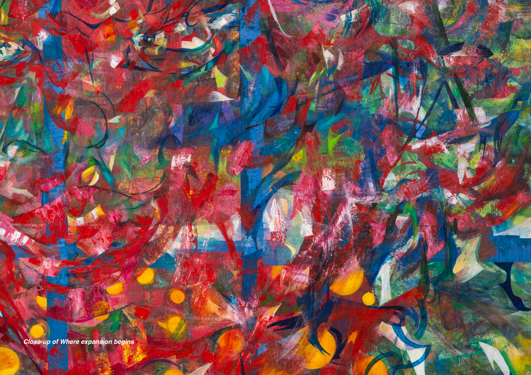
Close-up of Where expansion begins