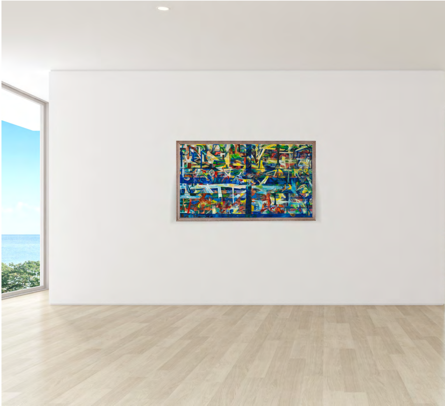
In situ for scale