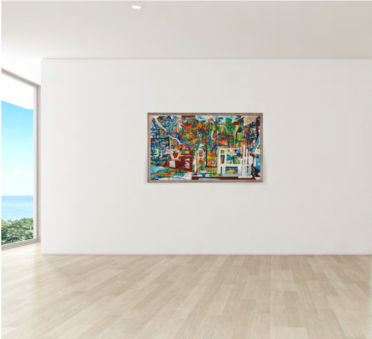
In situ for scale