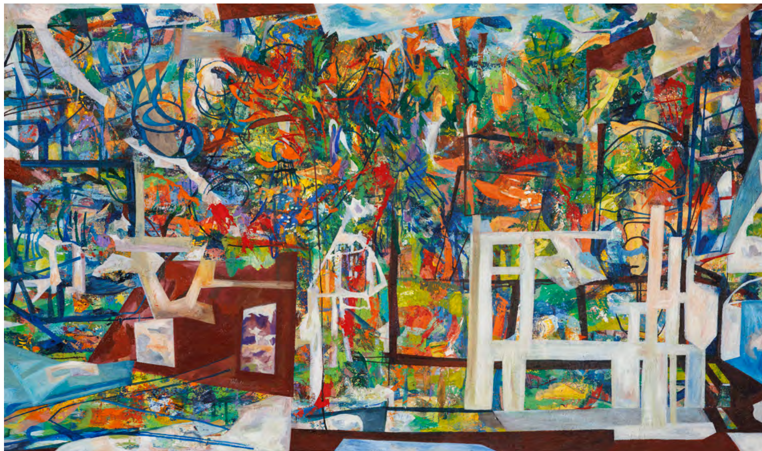
Constructing Presence - memory room Oil on jute canvas 89cm x 150cm 2026