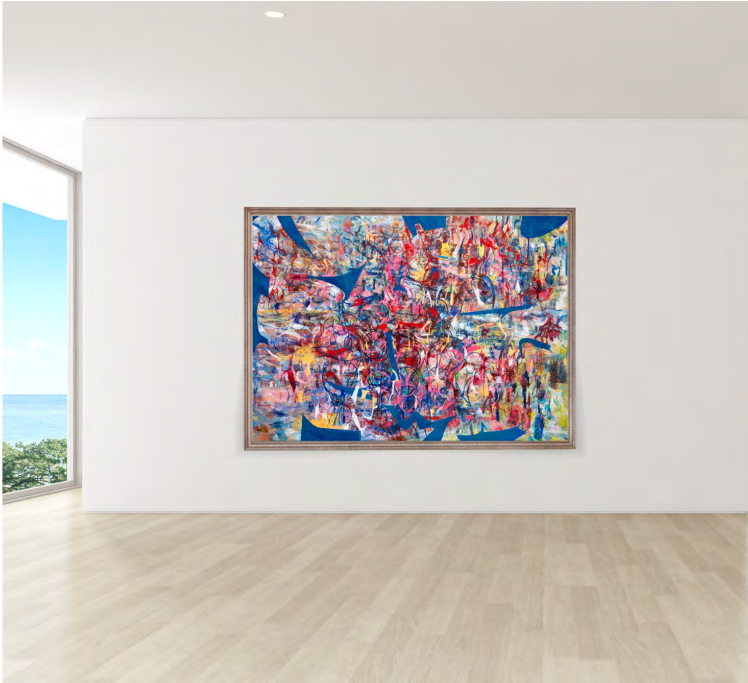
In situ for scale