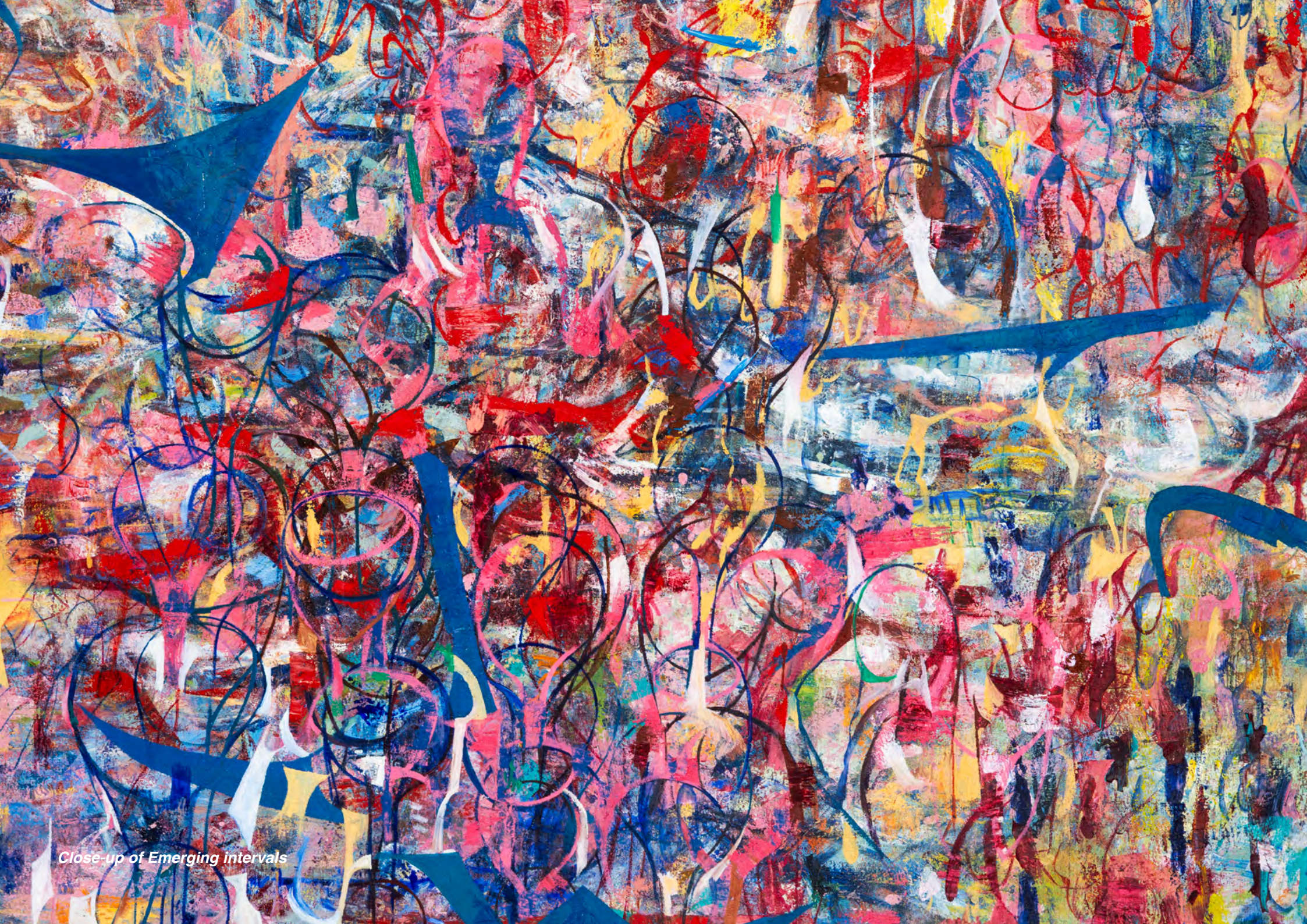
Close-up of Emerging intervals