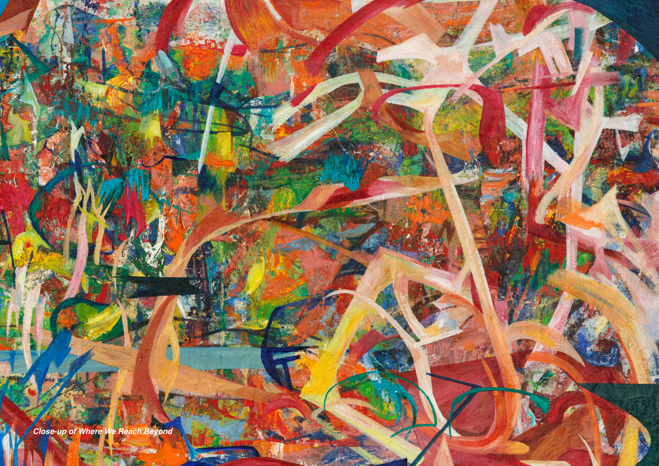
Close-up of Where We Reach Beyond