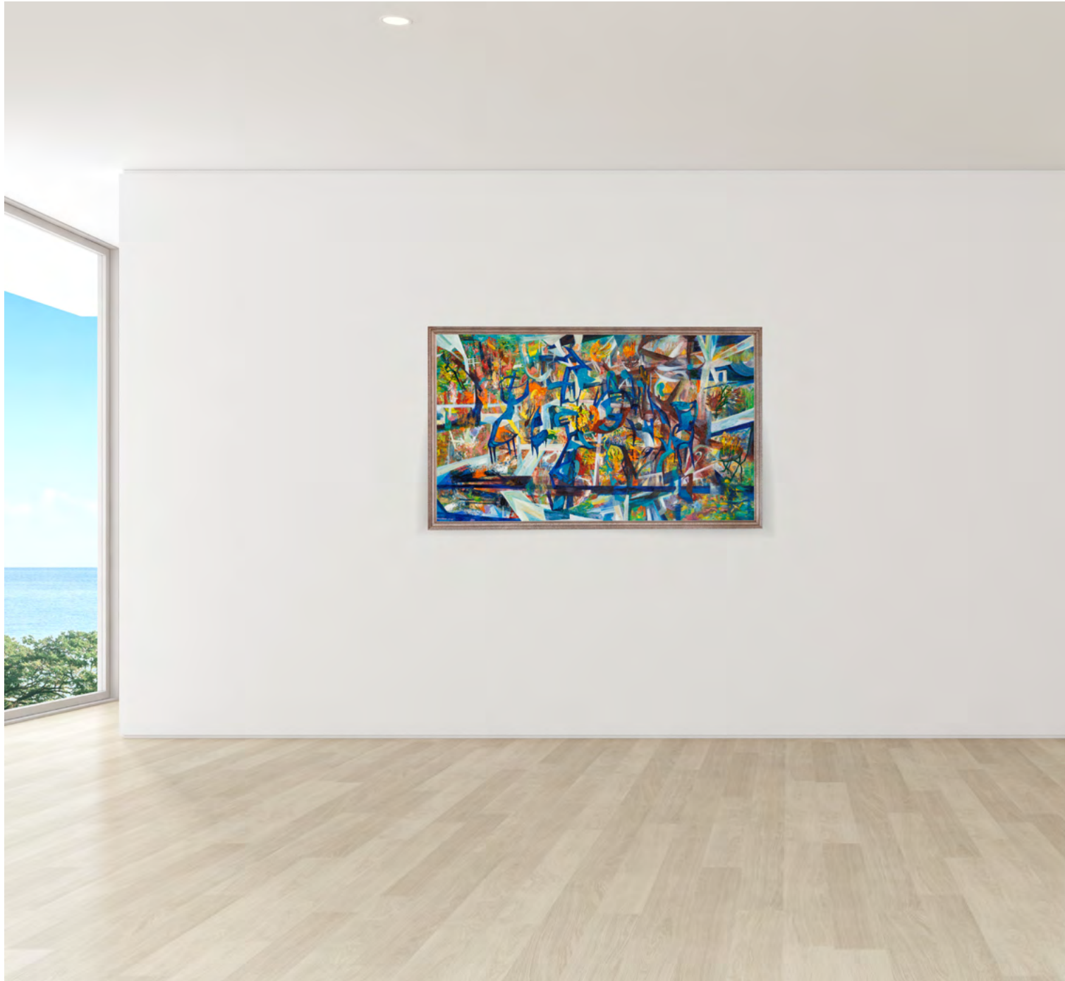
In situ for scale