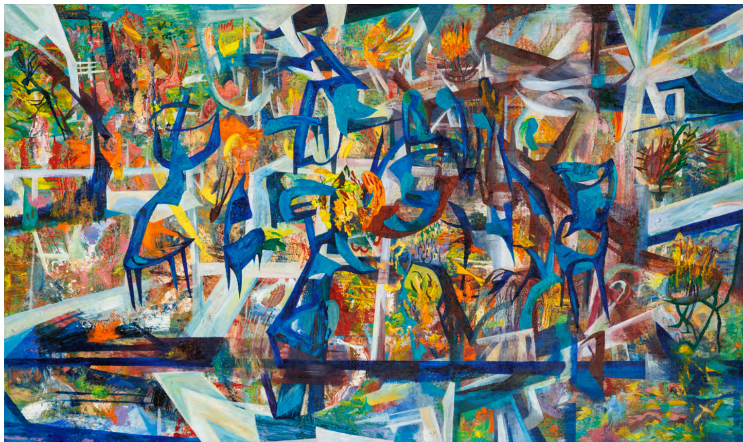
Held in Absence Oil on jute canvas 89cm x 150cm 2026