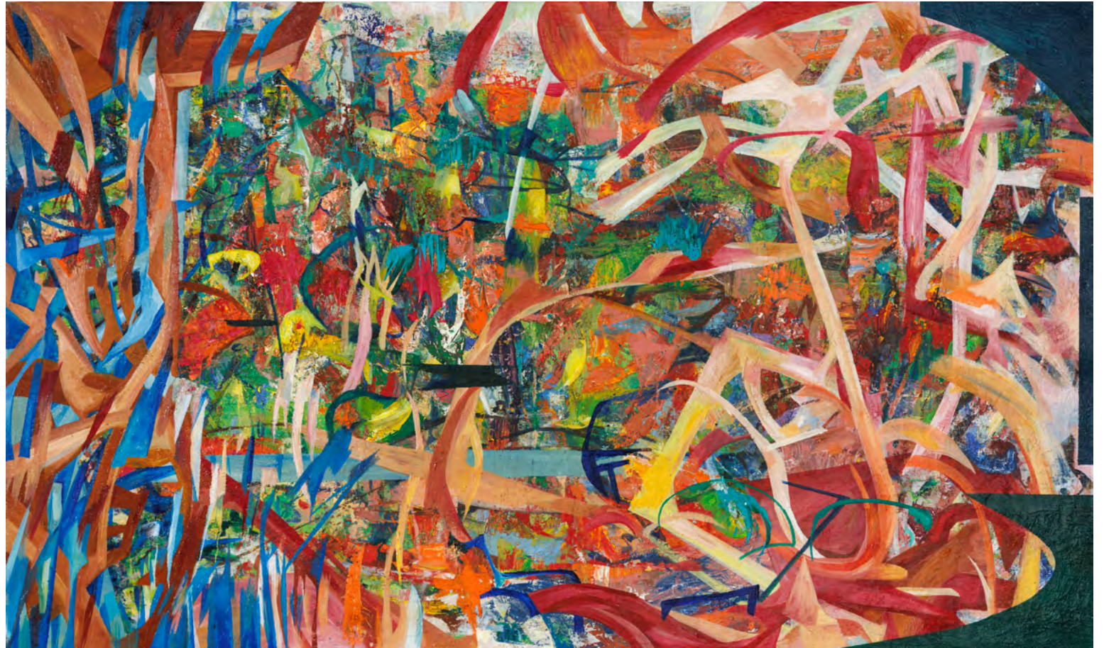
Where We Reach Beyond Oil on jute canvas 89cm x 150cm 2026