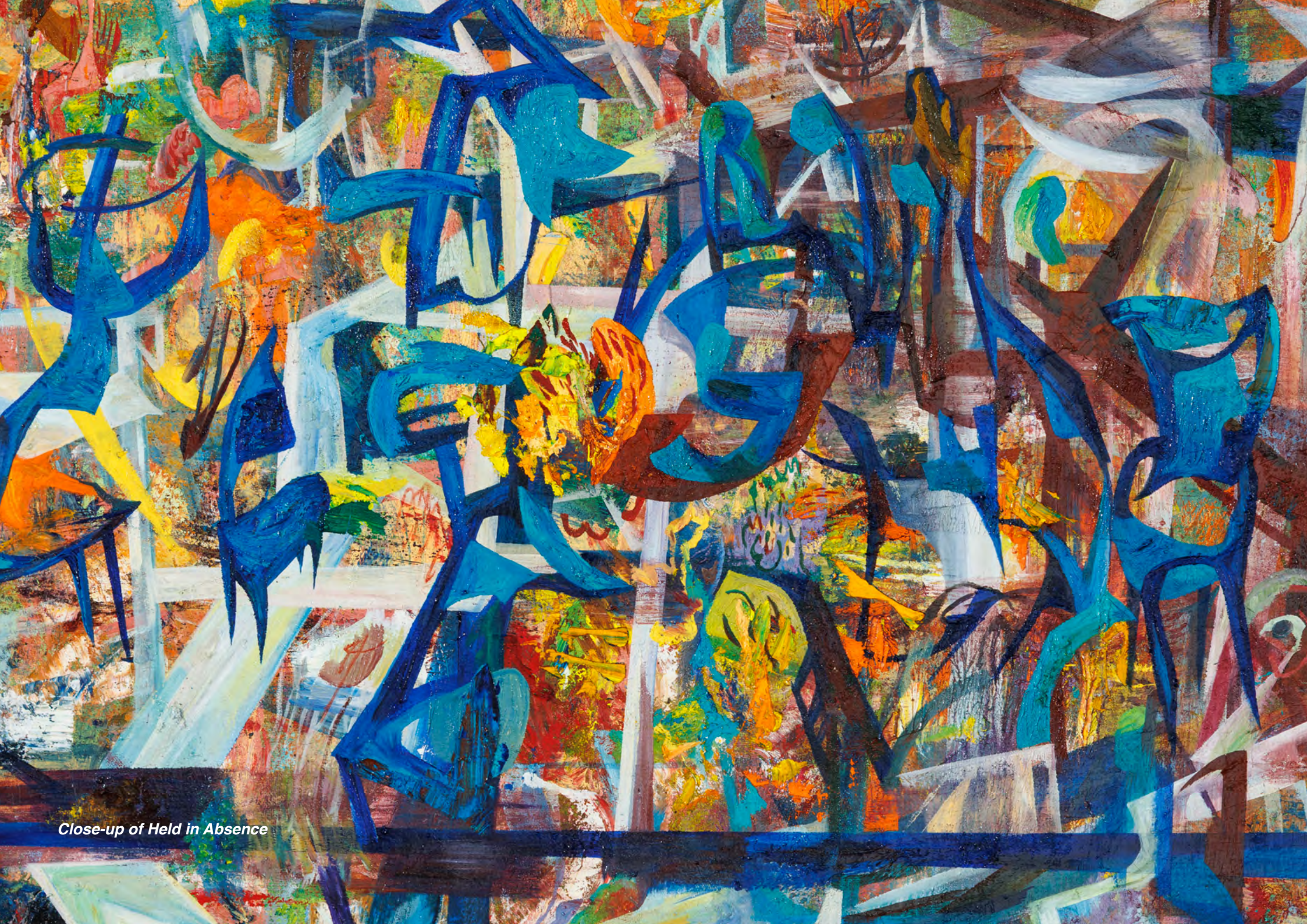
Close-up of Held in Absence