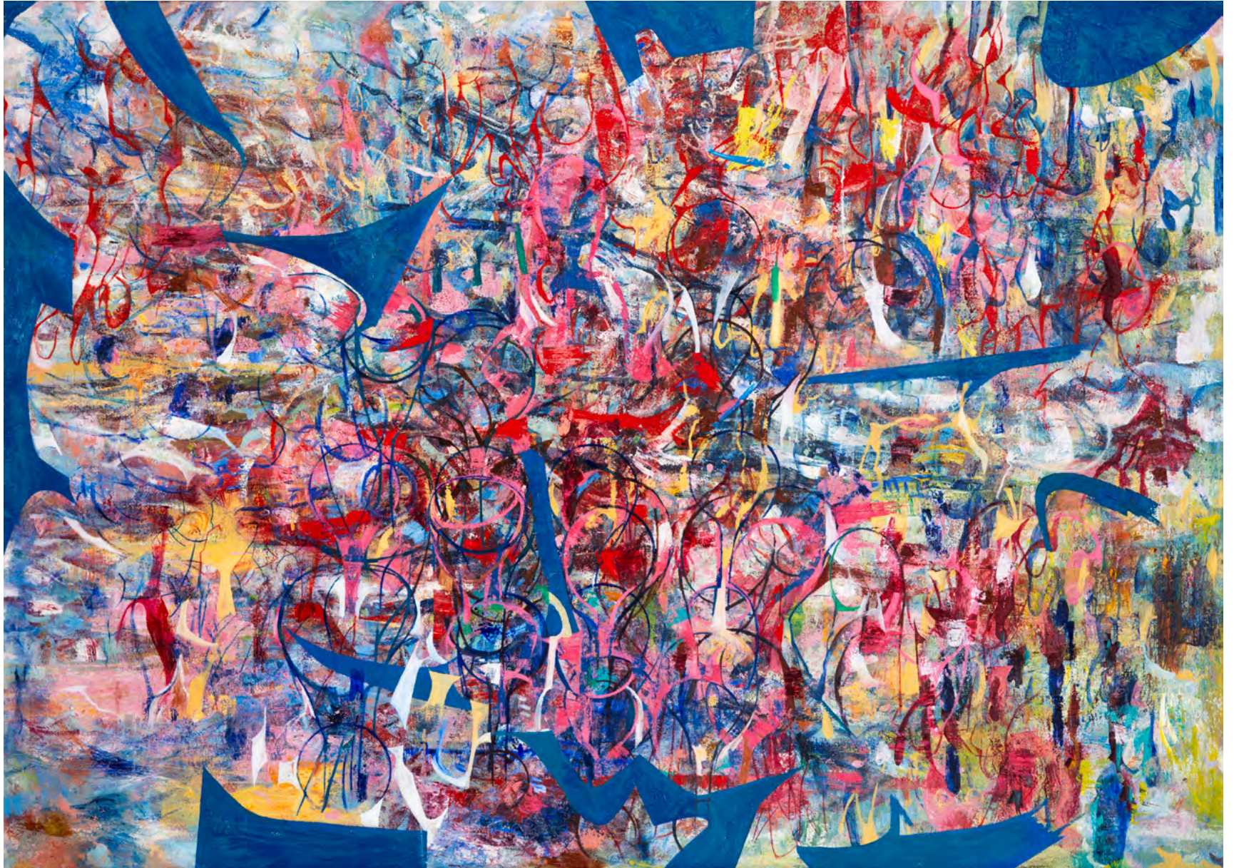
Emerging intervals Oil on jute canvas 150.5cm x 213.5cm 2026