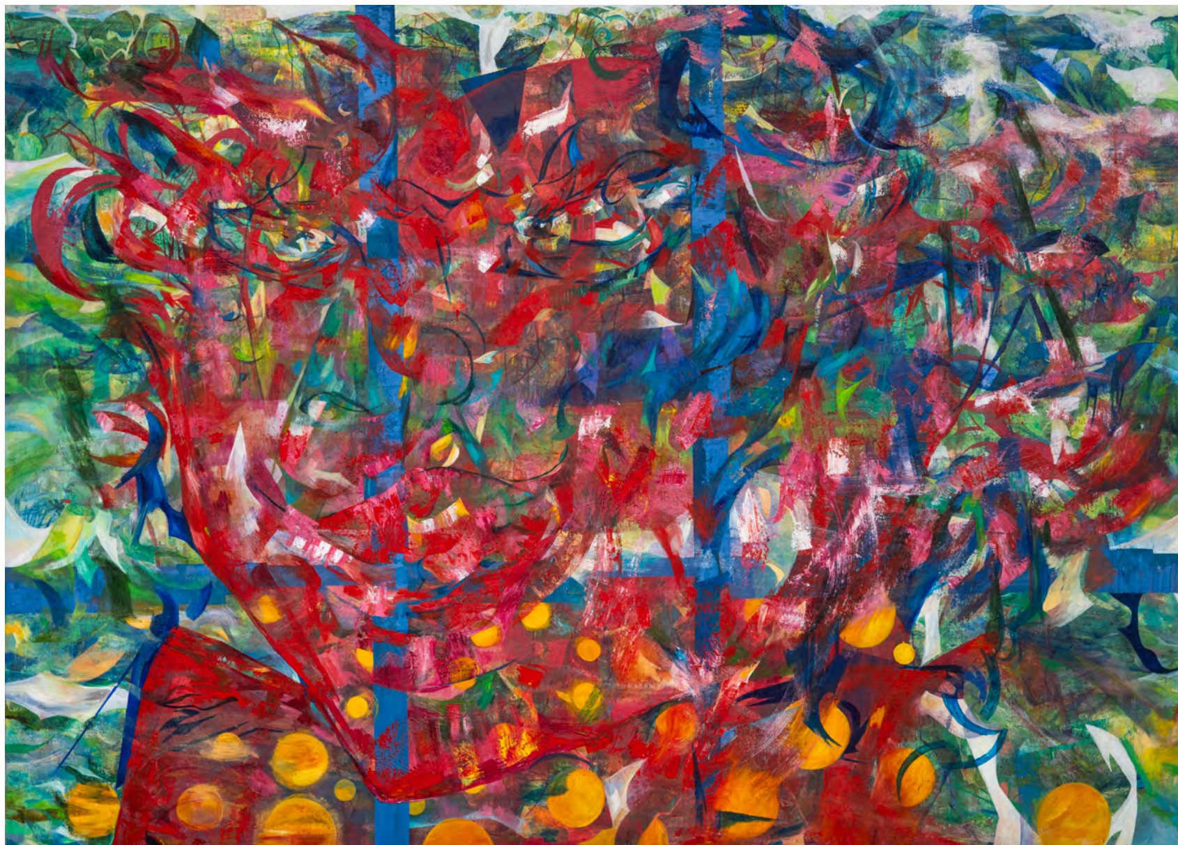
Where expansion begins Oil on jute canvas 150.5cm x 213.5cm 2026