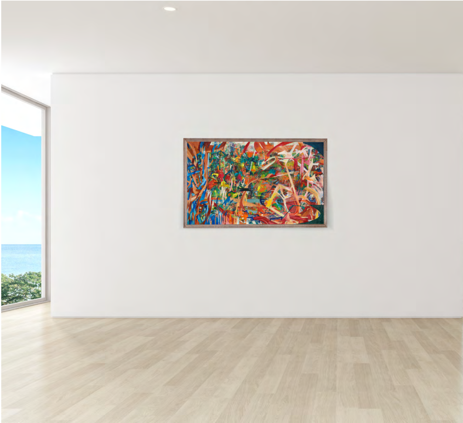
In situ for scale