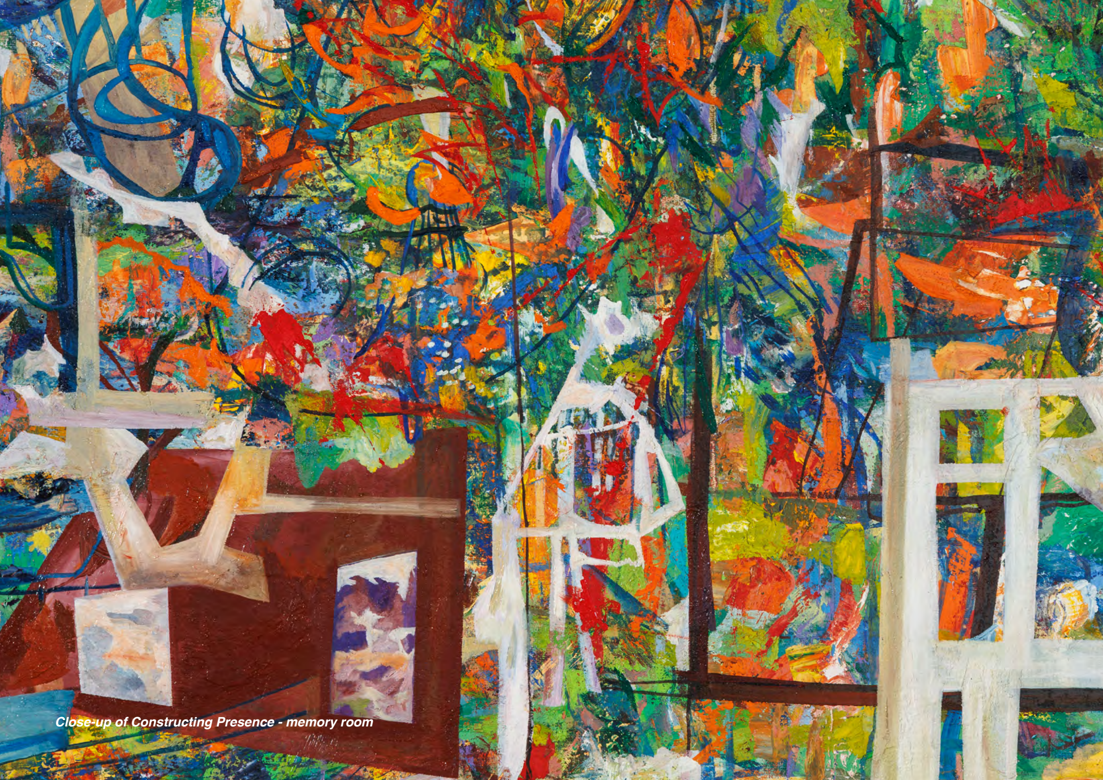
Close-up of Constructing Presence - memory room